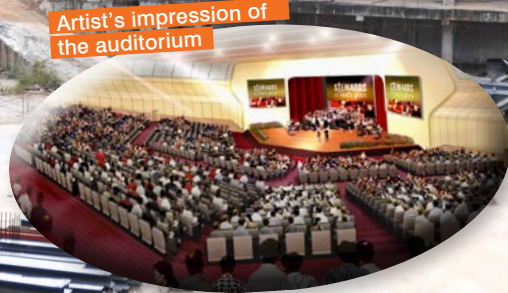
Artist's impression of the auditorium