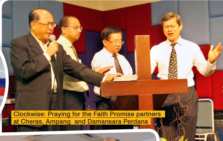
Clockwise: Praying for the Faith Promise partners at Cheras, Ampang and Damansara Perdana