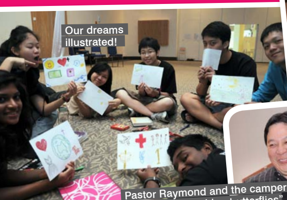
Our dreams illustrated!

Besides the sessions, games were organised and enjoyed by the campers in “life-like” Monopoly. The campers went around buying up “property” around the hotel grounds and charging people rent as they passed through.