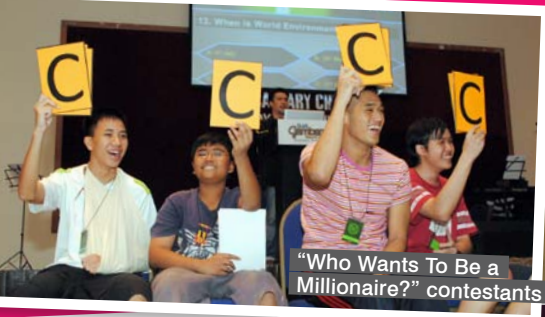
“Who Wants To Be a Millionaire?” contestants