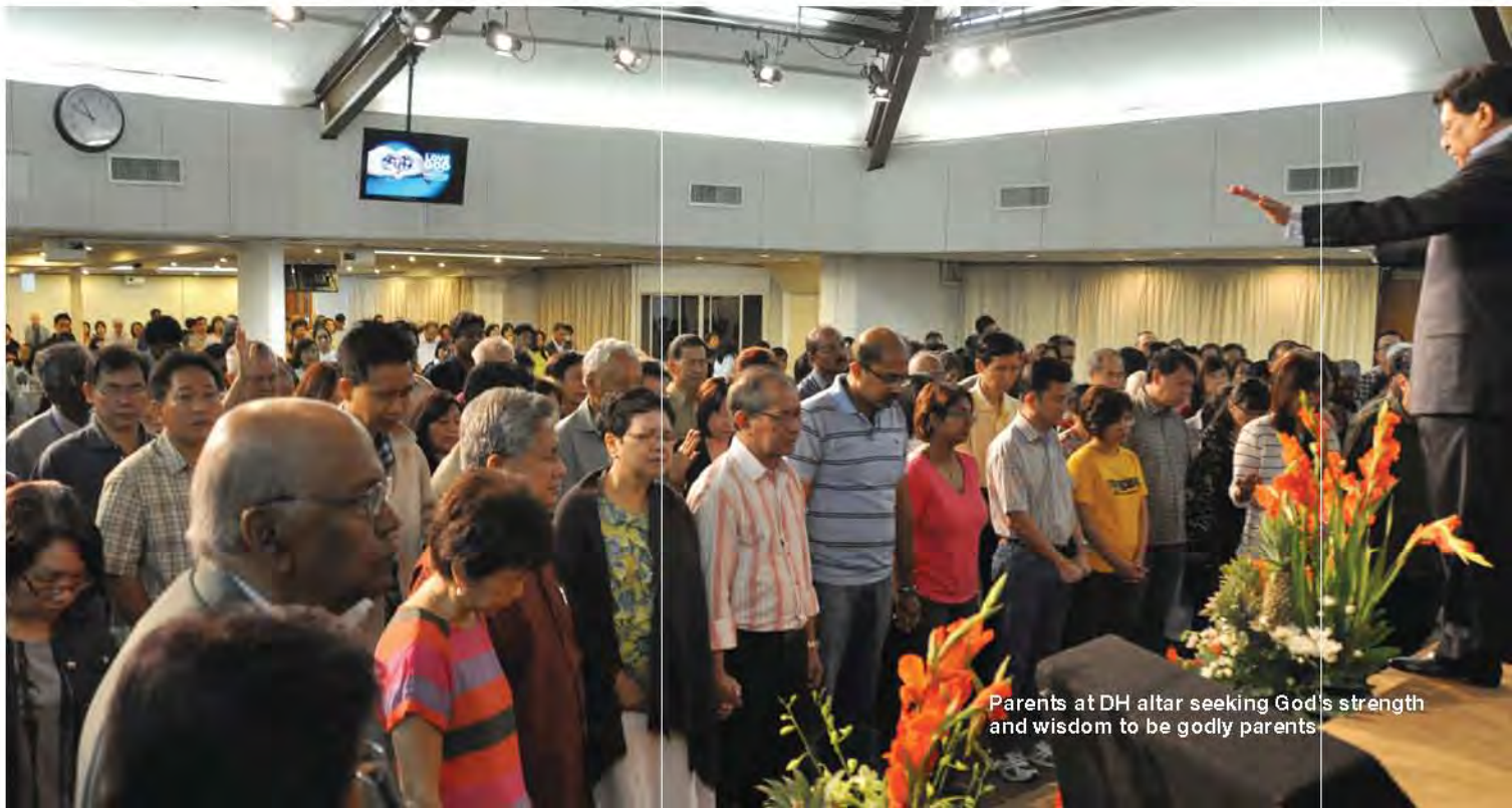
Parents at DH altar seeking God's strength and wisdom to be godly parents

As a gesture of appreciation, a little gift was also distributed to every father in attendance. It was a pen inscribed with this Scripture, "He who walks in integrity, walks securely" (Proverbs 10:9), precious Godly wisdom for fathers to keep close to their hearts. +