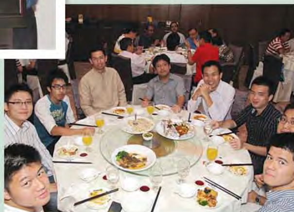
Blessed by both the spiritual and physical food