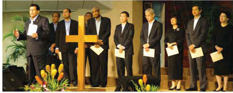
Senior Pastor preparing to charge the Deacons

After the Church prayed for the Deacons, they in turn, prayed for the Church. +