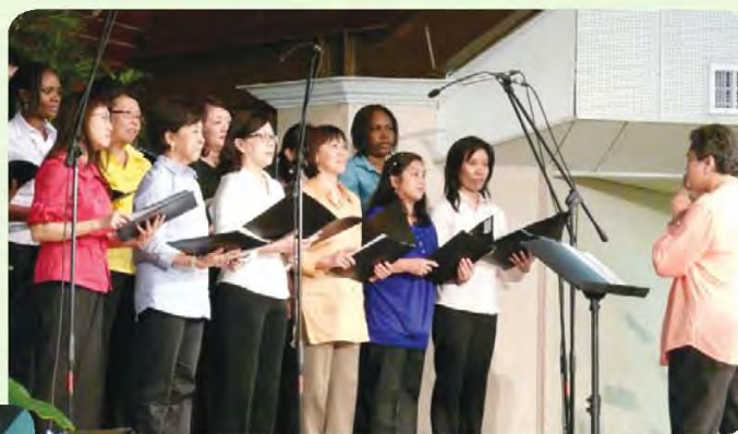
LG choir in action