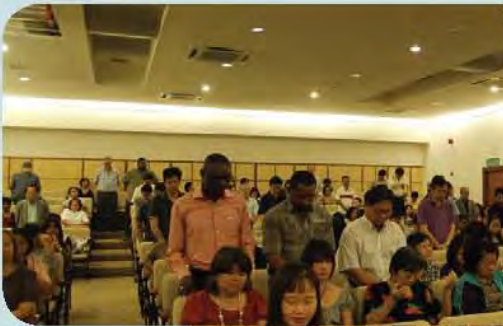
Fathers at Damansara Perdana (top) and Cheras (on the right) being acknowledged and prayed for