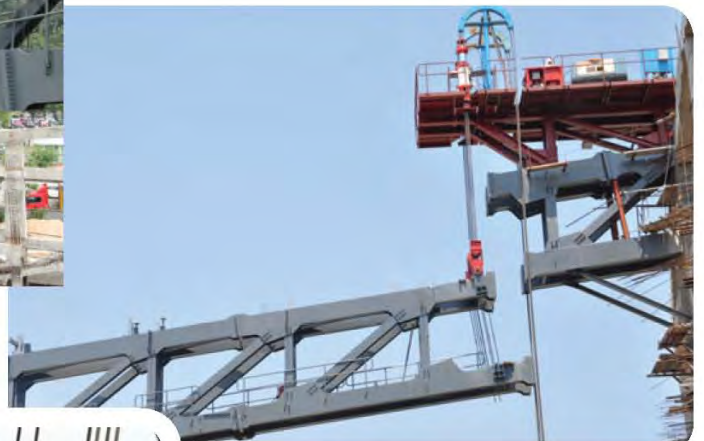
Almost there: Mega truss 2 almost reaching final position and connected to its end segment embedded into the mega column