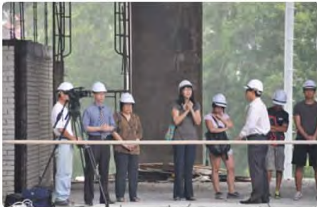
Prayer: Pastors pray for all involved in the lifting operation