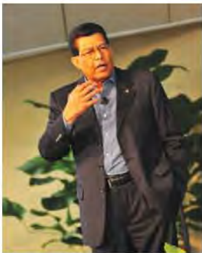
Senior Pastor's exhortation when congregation renews our Faith Promise pledge