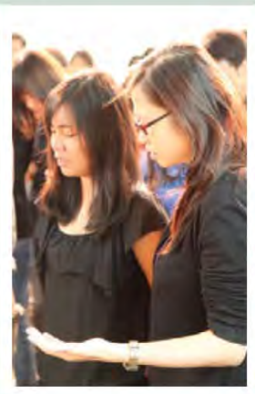
Youths responding to God and being ministered to at altar

Many youths responded to the altar call for God to fan into flame the gift of God that He has given us. For some it was discovering their "Bethel" for the first time. For others it was time to rediscover their "Bethel". Every believer should endeavour to keep the flame of the passion of God alive in us, so that we might be a blessing and bring blessings to our families, friends and country. This brings honour and glory to His Name. +