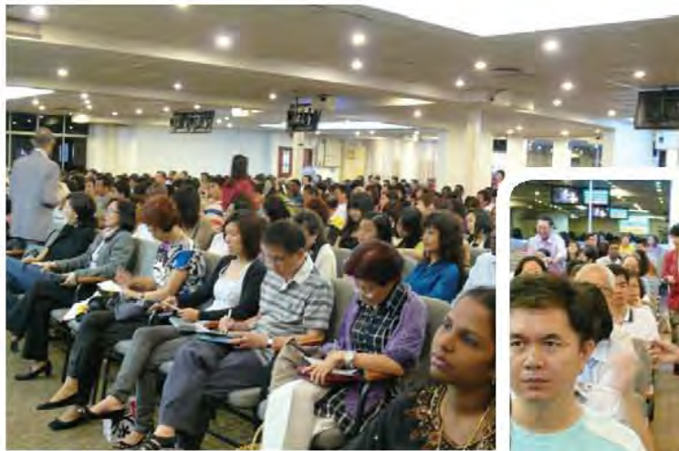
Calvarites making their FP pledge