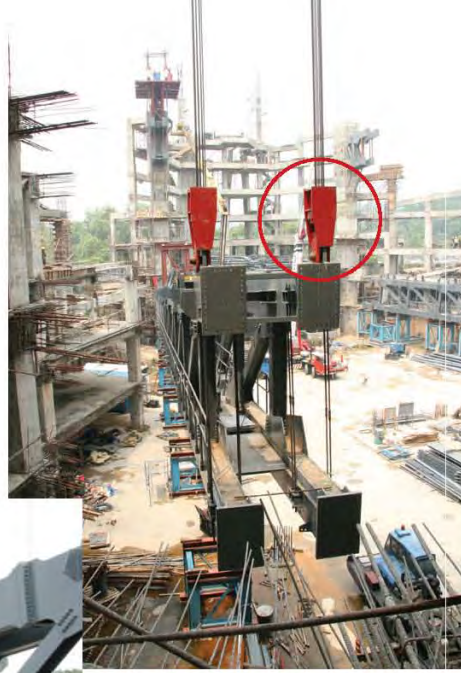
Strand jacks fixed to anchor housing: Each mega truss is hoisted up via cables