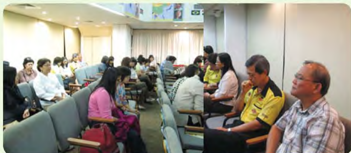
Praying in small groups of twos at morning watch

Let us look forward to the PEW in October. The challenge is to fast & pray for 21 Days. +