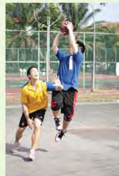
A leap to land a winner