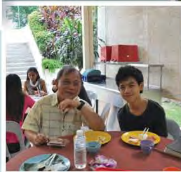
Father and son enjoy their meal after the 8am service