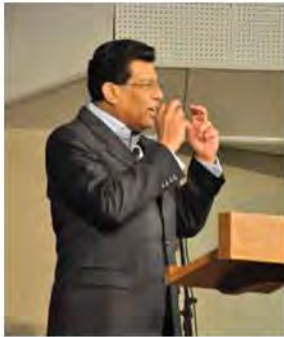
Senior Pastor encourages fathers through poem, parable and message

“A Dad is respected because he gives his children leadership. A Dad is appreciated because he gives his children care. A Dad is valued because he gives his children time. A Dad is loved because he gives his children the one thing they treasure most – himself.”