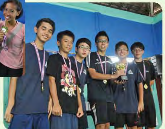
The football winning team