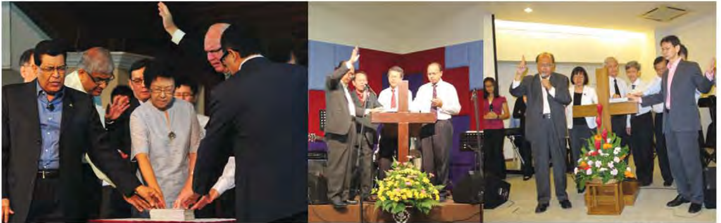
Deacons, Pastors and Missions Committee pray for God to bless every Faith Promise Partner represented by the FP cards, at DH, Cheras & DP (top left, centre and right)