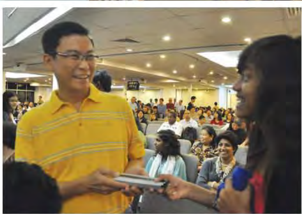
A father happily receives the Father's Day gift