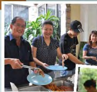
Serving good food with goodwill