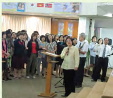
Corporate prayer at the Wednesday morning watch