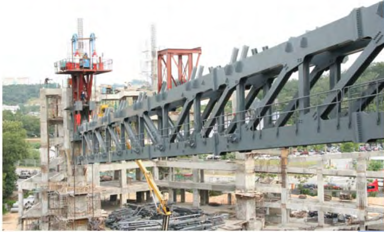
Jacking equipment: Temporary rigging platform holds the two hydraulic jacks.