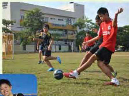
An exciting tussle