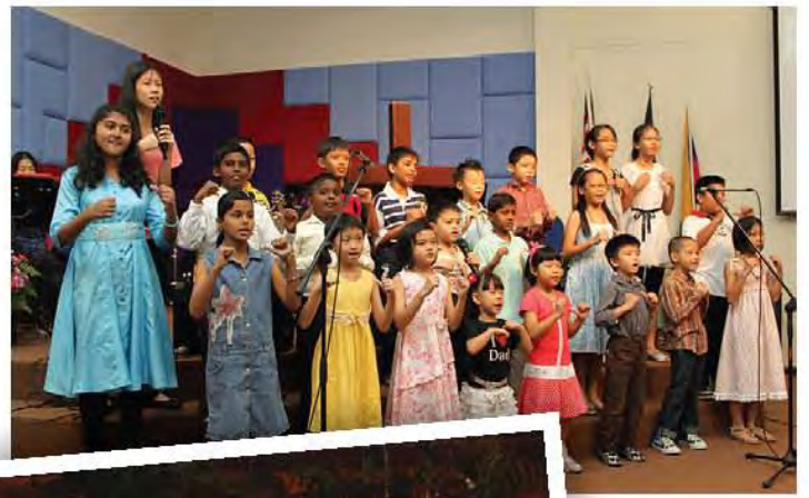
CW choir at all service locations sing in appreciation, "Dad You Are The Greatest"