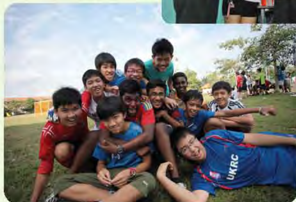
Epitome of carefree gaiety