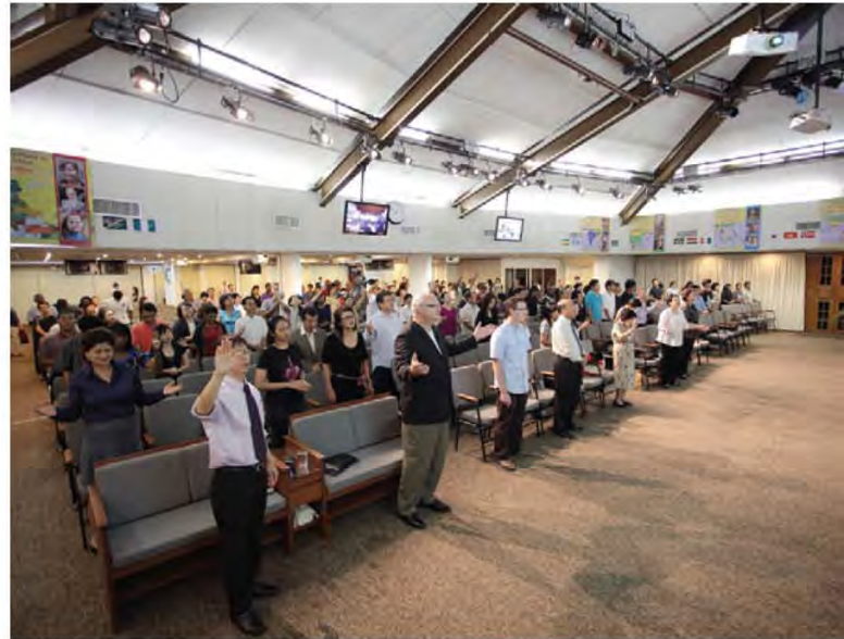
Calvarites enjoying a time of exuberant worship

During the altar call, Senior Pastor challenged us to move in total obedience to God, whether through giving of ourselves or finances. +