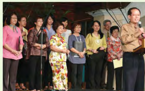
Chinese choir sings of God's majesty and holiness