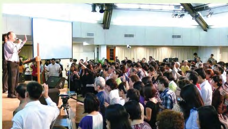
Friday prayer meeting ends on a note of praise at the altar