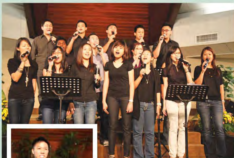
Svelte youth choir sounds as good as they look