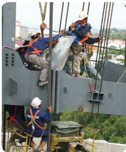
Bolting works: Workmen insert a shim plate to close joining gap