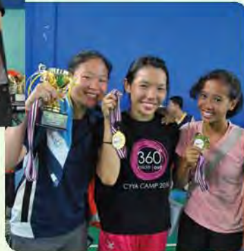
Winners of the women basketball