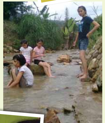
Wading and relaxing in the idyllic stream