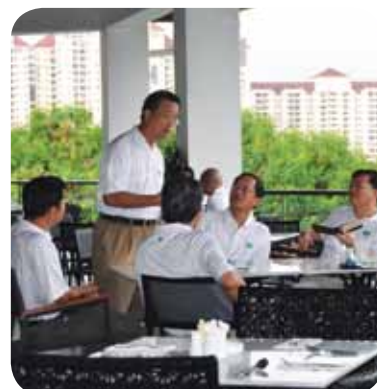
Breakfast at the Mines