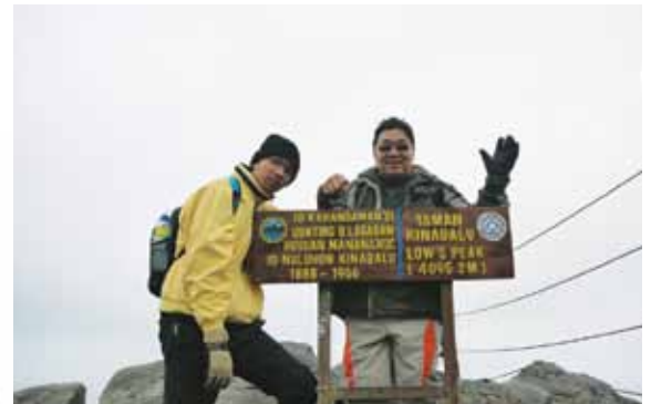
Father and son reach Low's Peak