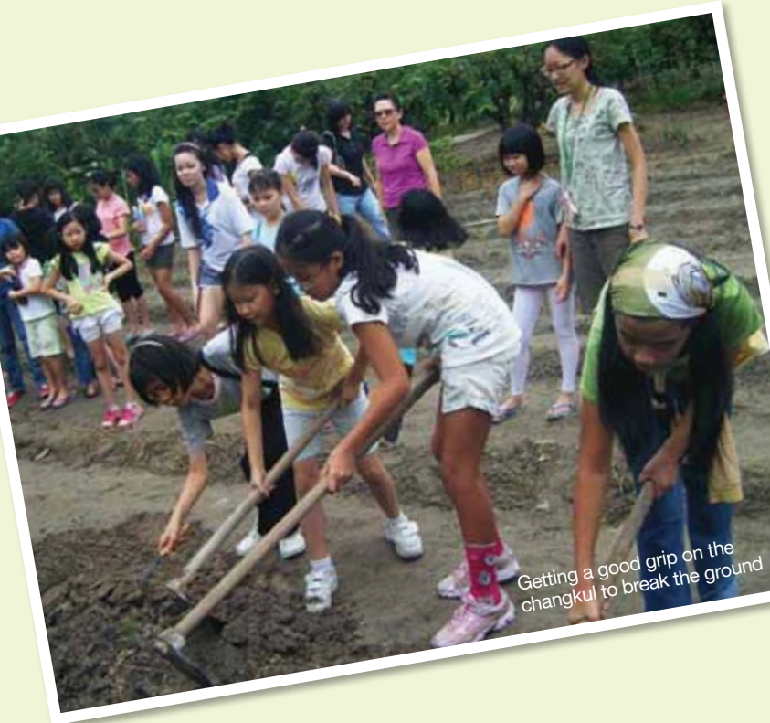
Getting a good grip on the changkul to break the ground