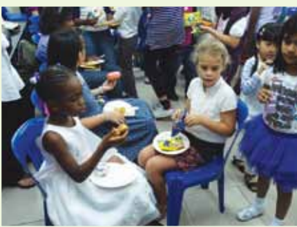
Getting to know one another better over refreshments