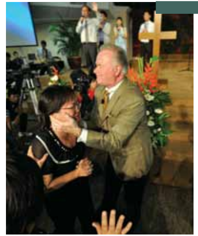
Receiving a special touch from God