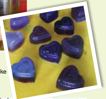
Delicate jelly-like organic soap

We all went home very happy because we had time for fellowship and bonding among the girls and Sponsors besides having the opportunity to enjoy nature and experience life on a farm. It was a trip worth going. Thank you Sponsors! +