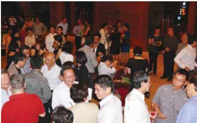
Warm fellowshiping before the Fellowship Dinner