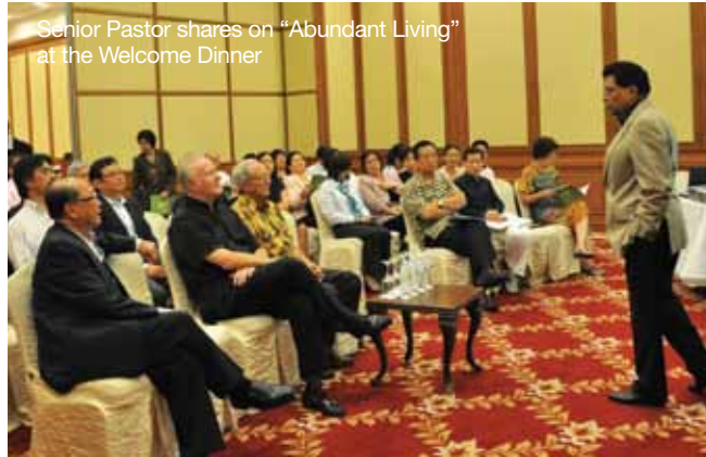
Senior Pastor shares on "Abundant Living" at the Welcome Dinner