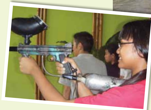
Having a go at paintball target shooting