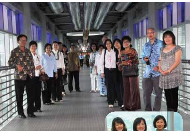
At the sky bridge