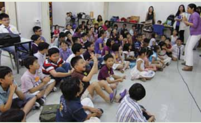
DP children being inspired