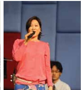
Exuding the joy of the Lord through songs