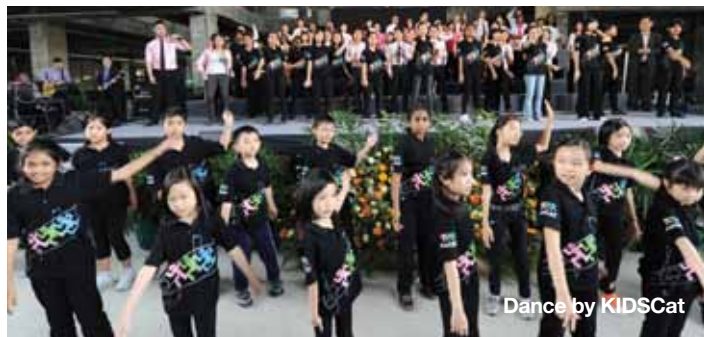
Dance by KIDSCat