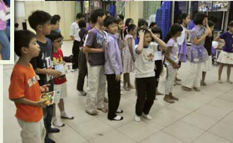
Enjoying a game