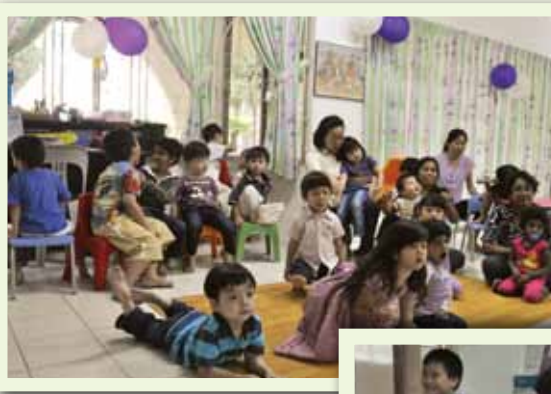
CNC children relaxing and enjoying the Bible lesson