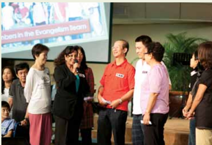
LG members in E-Team members testify of the fruits of their reaching out to their community