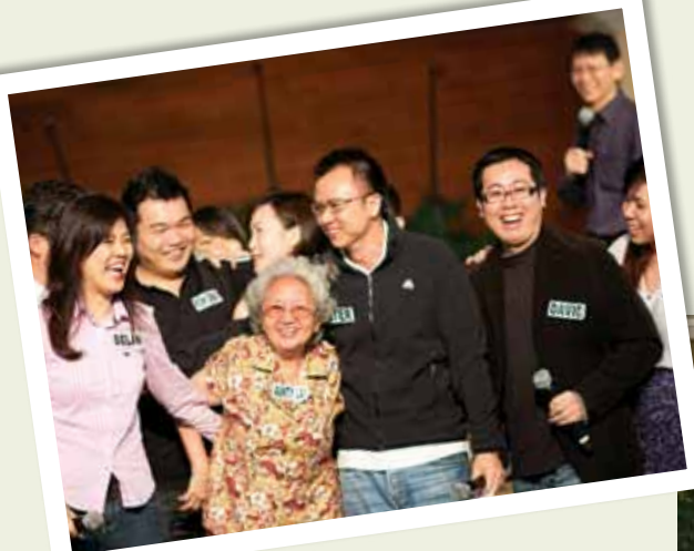
"Divine Ripple Effect" touching friends & business associates