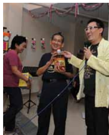
Gan emcees during the fellowship time with panache