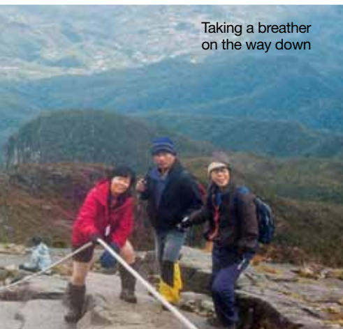
Taking a breather on the way down