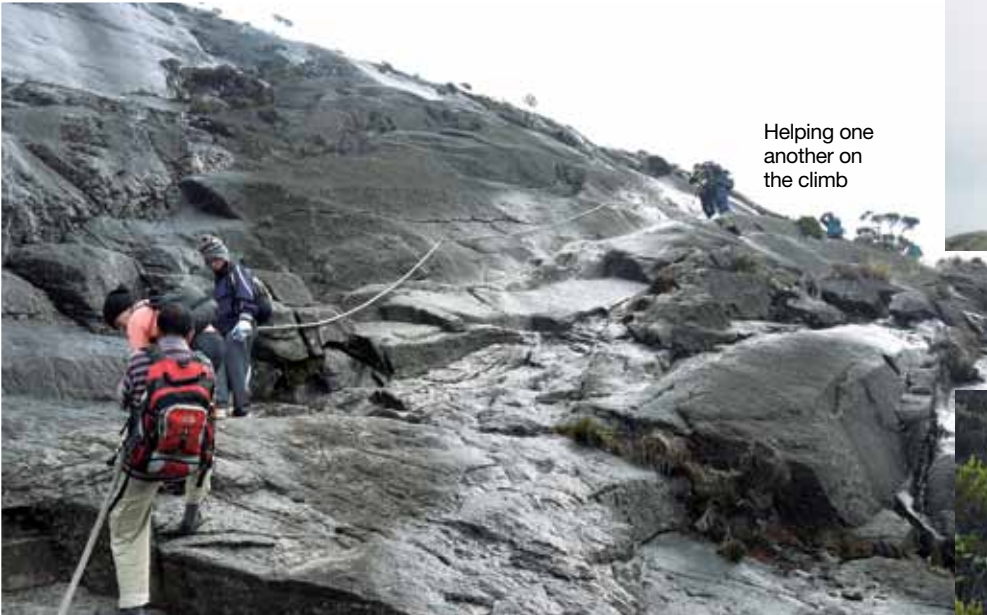
Helping one another on the climb