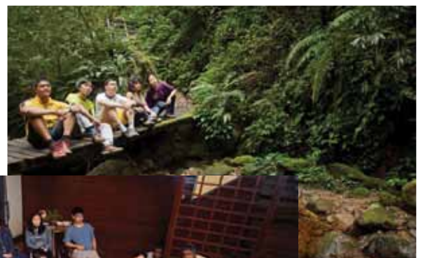
Enjoying the scenic beauty of the trail