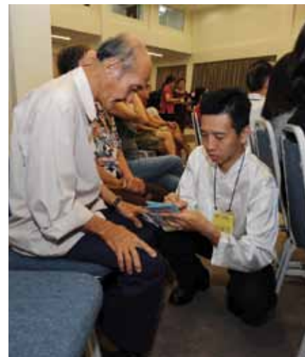
An altar worker follows up on respondent