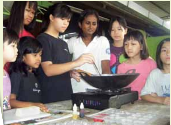
Young enthusiasts learning the art of making organic soap