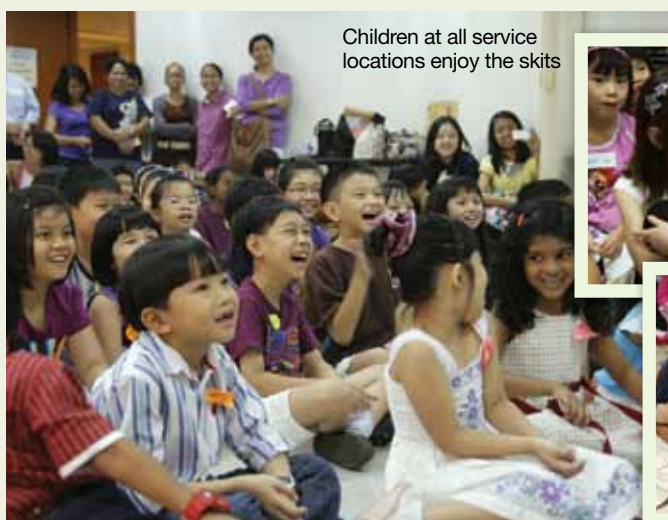
Children at all service locations enjoy the skits

Praise God for the 397 children who were present that day, the 40 (9 from CNC and 31 from CW) who came for the first time and most of all, for the 22 who received Jesus into their hearts! Thank you teachers for your hard work and parents, for generously donating the food and helping with the decorations and games! +