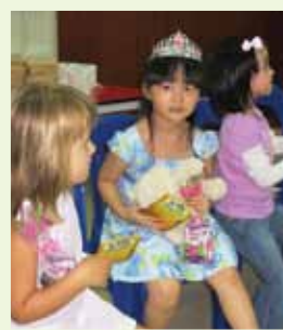
New friends who came