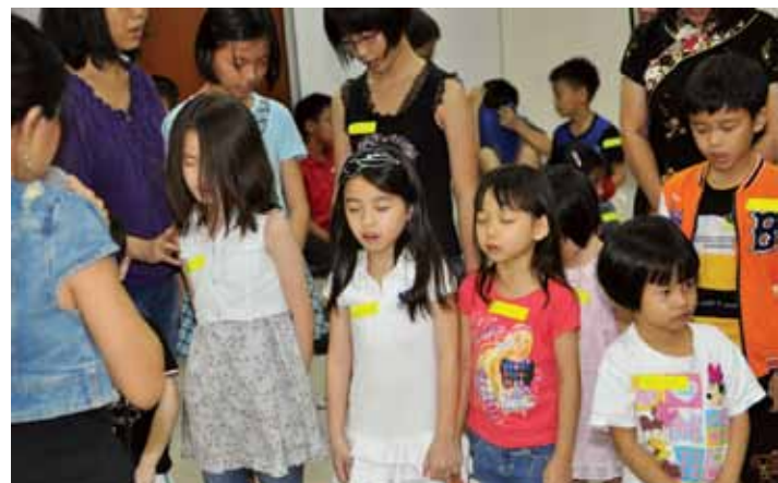
Children also responded for salvation