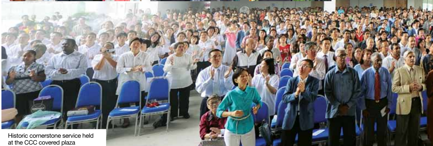
Historic cornerstone service held at the CCC covered plaza