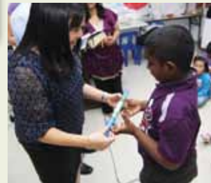
Invited guests give away prizes