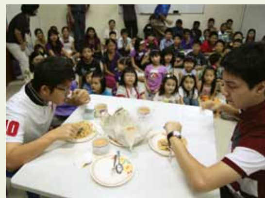
Well acted skit enthralls the audience