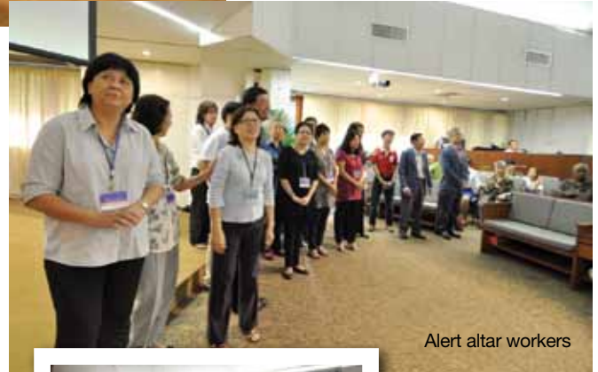
Alert altar workers