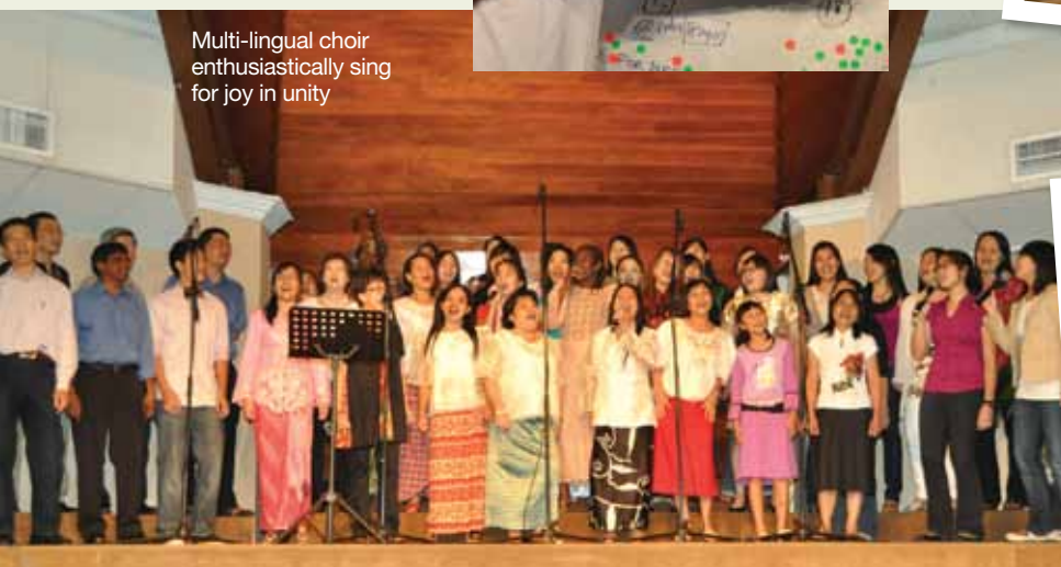
Multi-lingual choir enthusiastically sing for joy in unity