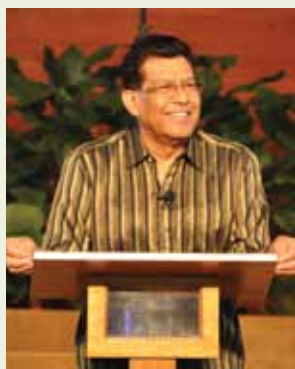
Senior Pastor highlights that LG Leaders are to be good coaches, patrol leaders & shepherds to members