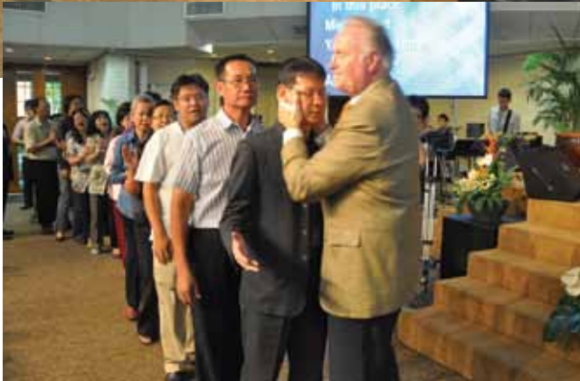
Waiting in line to be prayed for