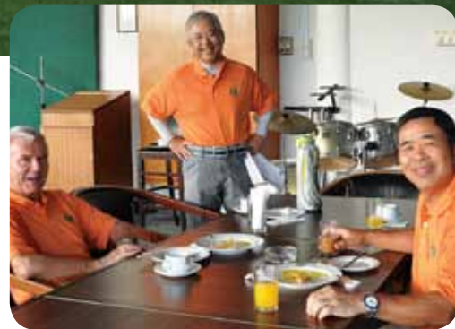
Golfers from Holland, Japan & Hong Kong having breakfast at RSGC

Visit www.calvaryigf.com for photos, information and updates