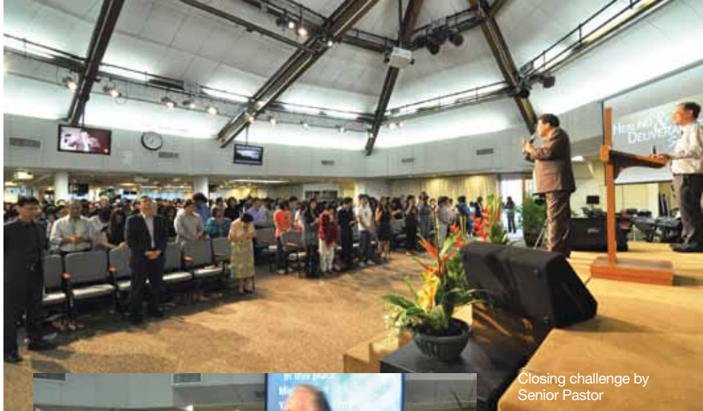
Closing challenge by Senior Pastor