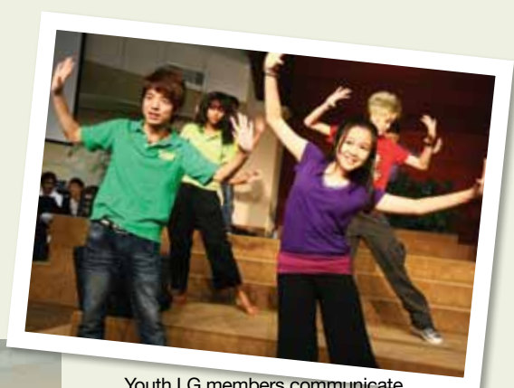
Youth LG members communicate creatively through dance

Senior Pastor further explained that the vision of the LG ministry was born out of the necessity to provide for the gathering of God's people in the event that the Church is not able to function as usual. This vision led to the understanding of Jethro's advice to Moses to appoint leaders over the different tribes which is applicable to the LG ministry. A LG leader is likened to a