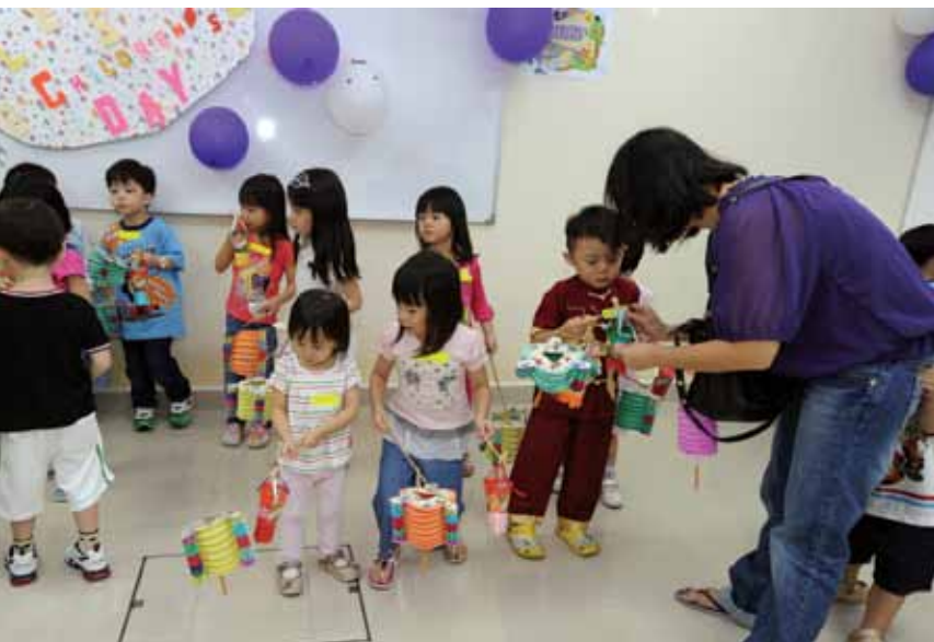
Getting ready for the lantern parade