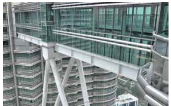
Petronas sky bridge