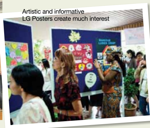
Artistic and informative LG Posters create much interest