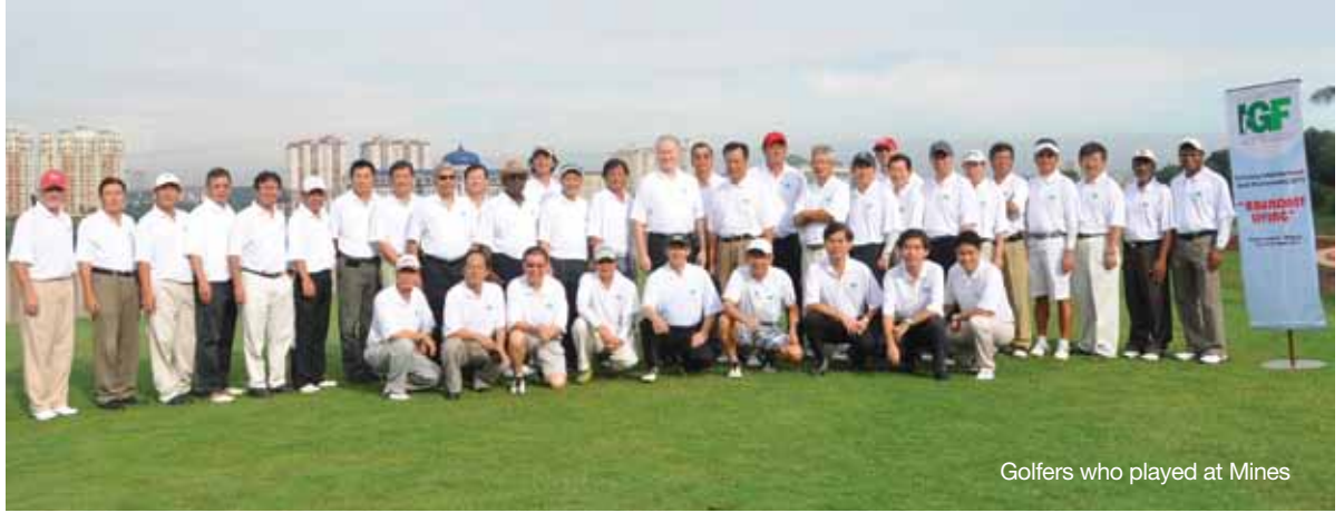
Golfers who played at Mines