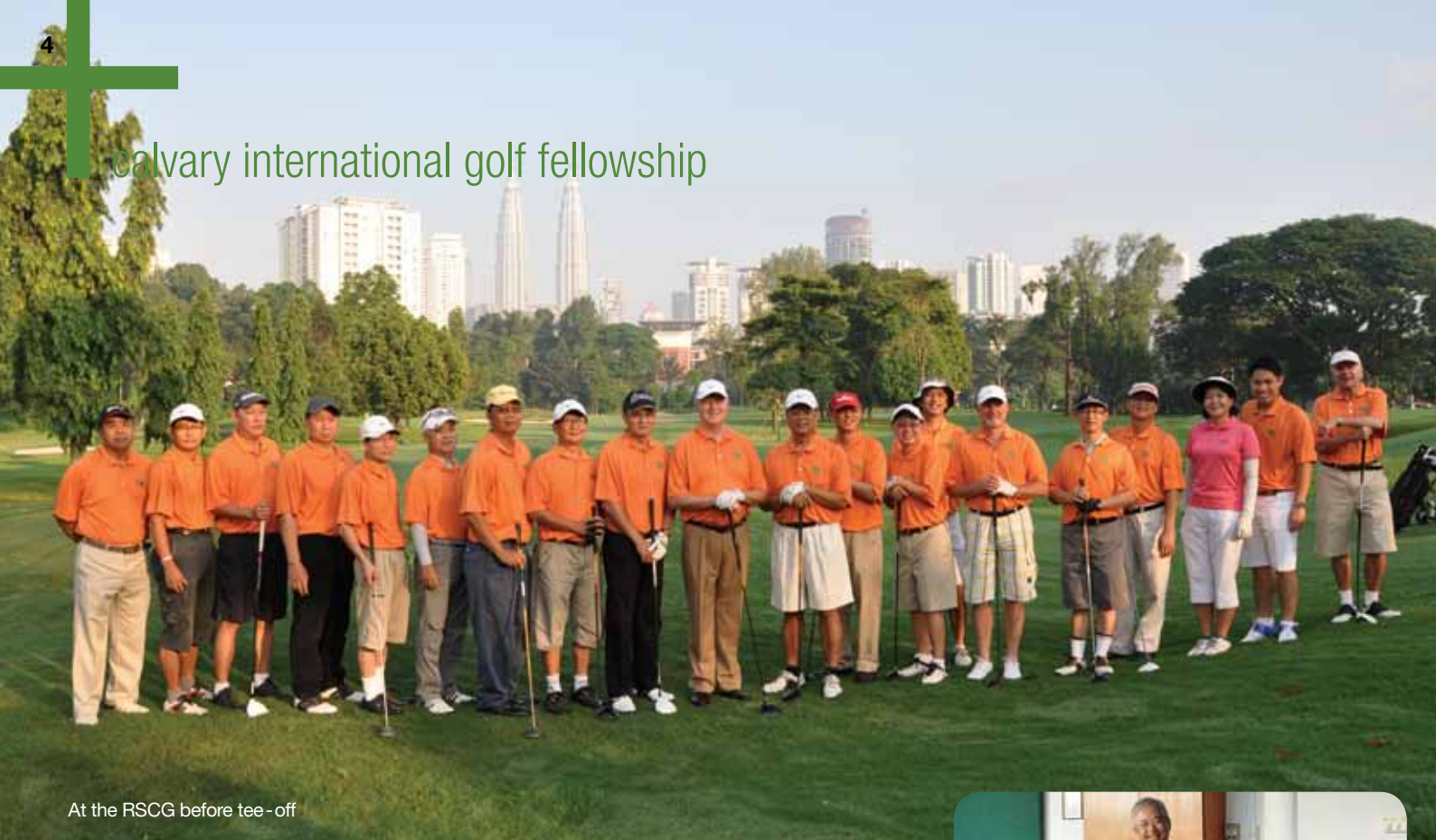
At the RSCG before tee-off