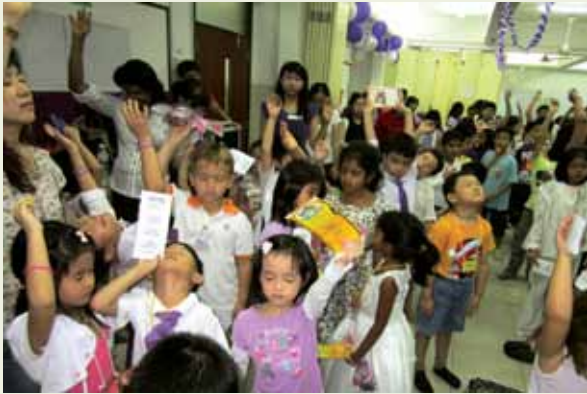
Children desiring to get closer to Jesus