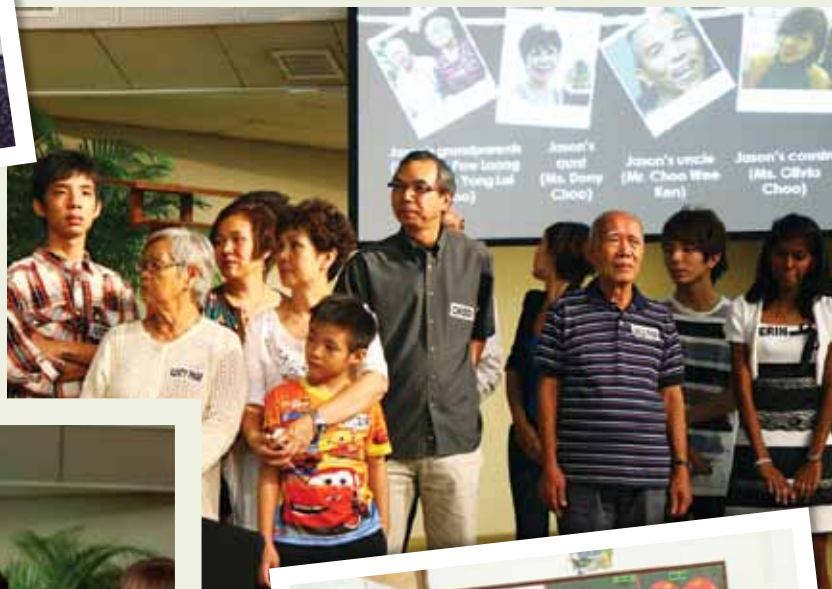
Participants owning the vision

Patrol Leader, a Coach and a Shepherd (2 Timothy 2:3-5; John 21:15-17). Senior Pastor further expounded on the importance of the five-fold ministry in equipping the saints to possess the ministry of a Prophet, Priest and King. Many now understand the underlining principles of the LG Ministry as well as the important role that the church plays in growing every believer in the measure of the stature of the fullness of Christ.