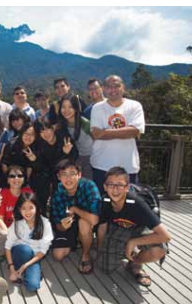
Smiles of success