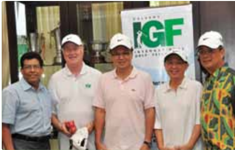
The Winning Team at RSGC