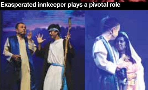
Coping with a nosy neighbour