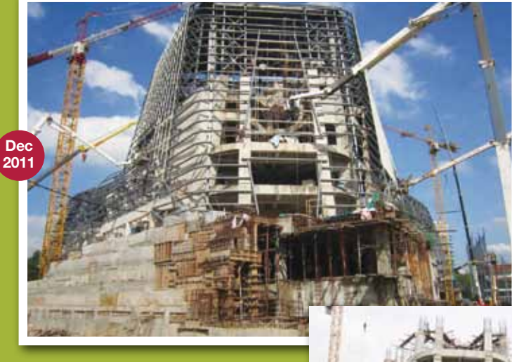
Facade of Prayer Tower

Be blessed by the pictorial report on the progressive developments. +