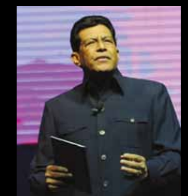
Senior Pastor shares on how one can receive the gift of salvation