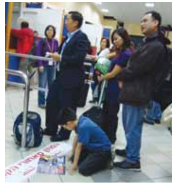
Youngest pilgrim occupies himself at the immigration queue

Geok. The rest of the Cavlarites enjoyed the panoramic view of the undulating desert landscape via the cable car instead. Masada is the famed site where Jewish zealots made their tragic last stand during the great revolt against Roman rule decades after the time of Jesus.