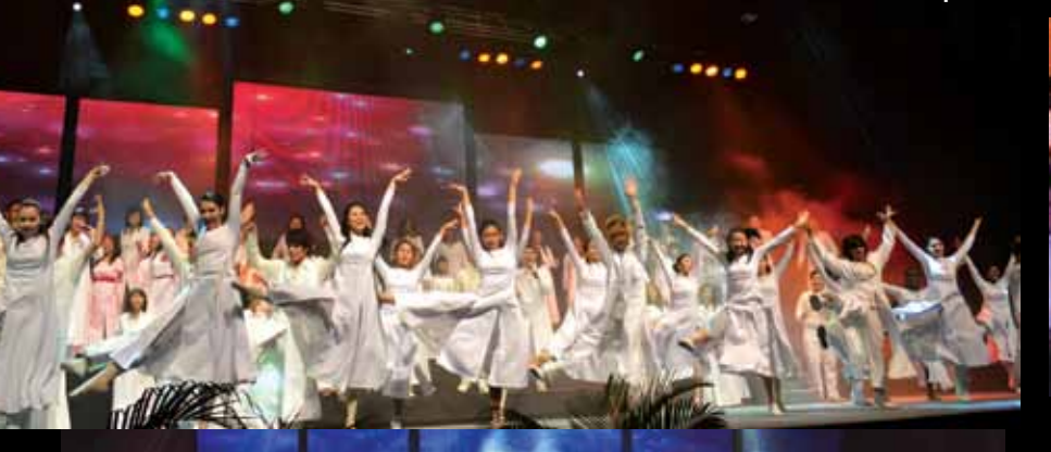
Graceful dancers gliding and leaping across the stage