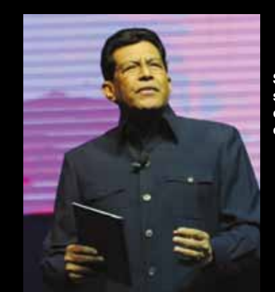
Senior Pastor shares on how one can receive the gift of salvation