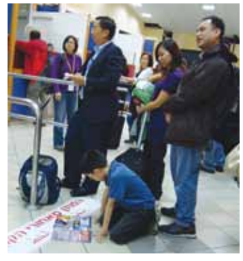
Youngest pilgrim occupies himself at the immigration queue

Geok. The rest of the Cavlarites enjoyed the panoramic view of the undulating desert landscape via the cable car instead. Masada is the famed site where Jewish zealots made their tragic last stand during the great revolt against Roman rule decades after the time of Jesus.