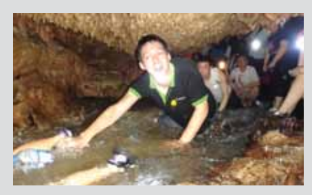
Young adults burrow through the caves at Gua Tempurung

The young adults also explored the caves of Gua Tempurung and the nearby Kellie's Castle. It was exhilarating time, going bellydown to get through the tunnels of the cave!