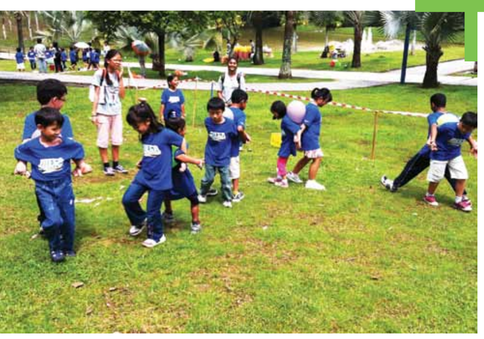
Having games at the Bukit Jalil Park

Avoiding obstacles while treasure hunting at Bukit Jalil Park