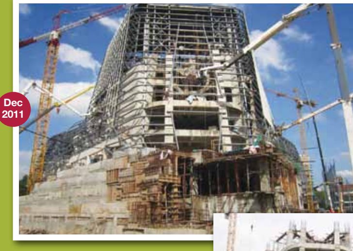
Side view of Prayer Tower as at 20 December 2011

Be blessed by the pictorial report on the progressive developments. +