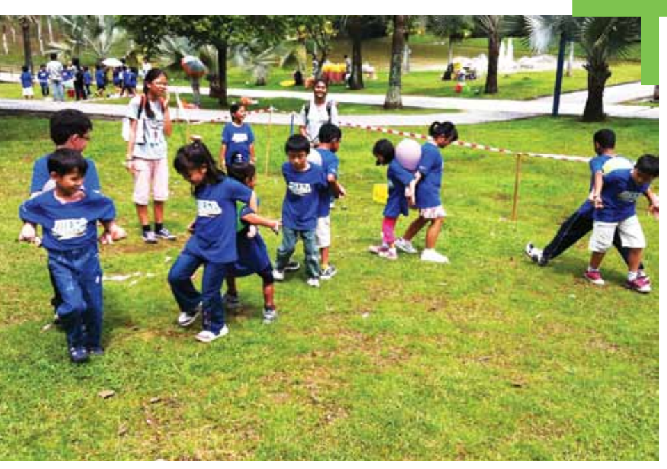
Having games at the Bukit Jalil Park

Avoiding obstacles while treasure hunting at Bukit Jalil Park