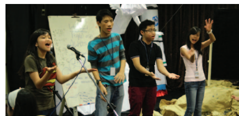
Expressive youth worship team leading the kids

This camp is one of my favorites. I enjoyed and learnt from the interesting lessons. For instance I learnt that we will never stop learning. Everyday we learn something new. Praise God I had the opportunity to be a group leader. It is really fun working together as a group to get things done.