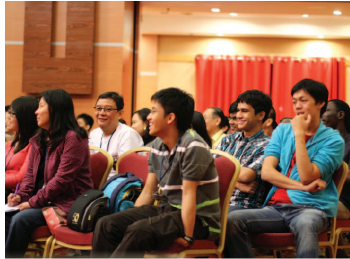
Left and Top: Campers enjoying the sessions | Bottom: Group Photo