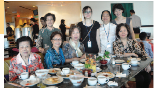
From Top: Some of the Chinese congregation at Camp | Enjoying dinner at the hotel