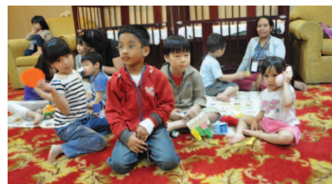
Younger kids enjoying themselves

I want to thank God for a good camp. This was my first experience being a group leader. With the cooperation of all in my group, we made a banner from transparent plastic and colour papers. Praise God, our group scored the highest for the banner.