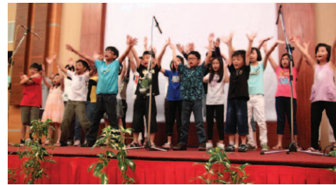
Top: Kids present “Jesus, You’re My Superhero” at conclusion of camp | Left: The space adventurers at Kids Camp

Praise and thank God for His protection and all the wonderful lessons taught by all our Kids Camp teachers.