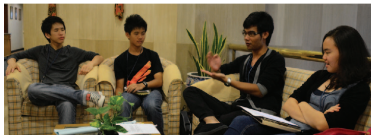
Middle: Campers Worshipping