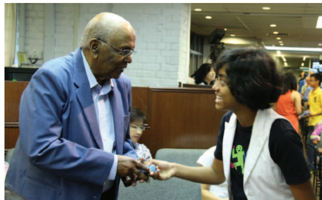
Top and Left: Fathers receiving gifts