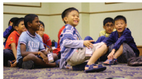
Top: Fun time for kids Right: Lesson illustration — to beware of satan who masquerades himself as light