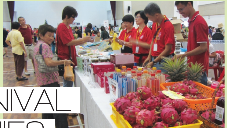
Calvaryland bazaar booth with lots of goodies