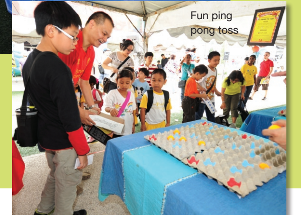
Fun ping pong toss