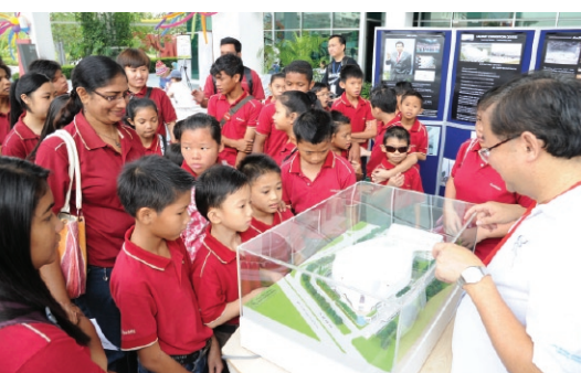
Highlighting features of the CCC model at the Resource Centre