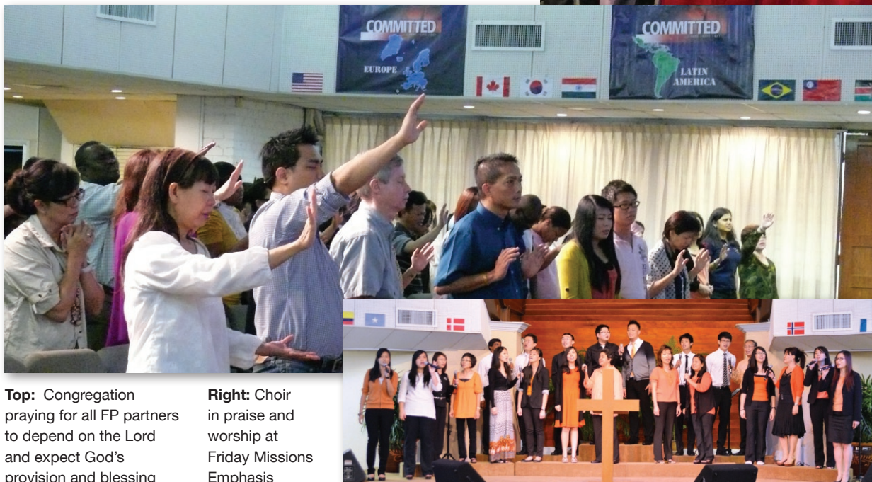
Top: Congregation praying for all FP partners to depend on the Lord and expect God's provision and blessing