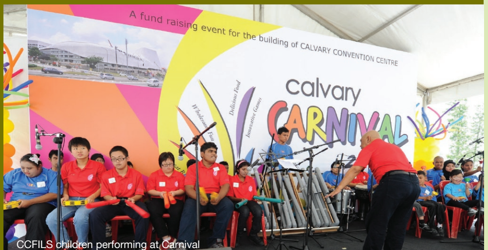
CCFILS children performing at Carnival

The CCFILS children also gave an item on stage. Trained by Teacher Shahrin, our