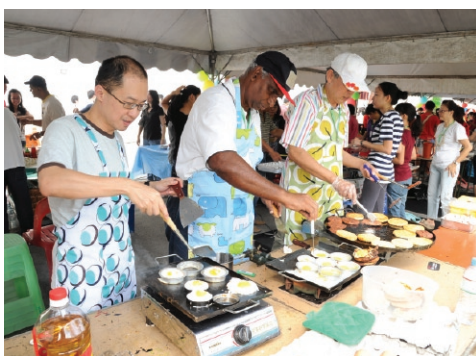
Trio getting a headstart before the crowds come

stage with the serene lake for backdrop. Even around 2pm it was not hot due to the constant breeze and surprisingly cool weather.