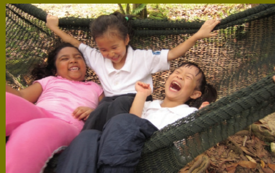
Enjoying a hilarious moment

kasihmu dalam hal saling membantu. Dan berusahalah memelihara kesatuan Roh oleh ikatan damai sejahtera” (Efesus 4:1-3).