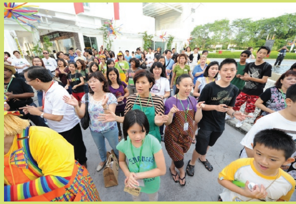
Praising the Lord at the opening of the Carnival