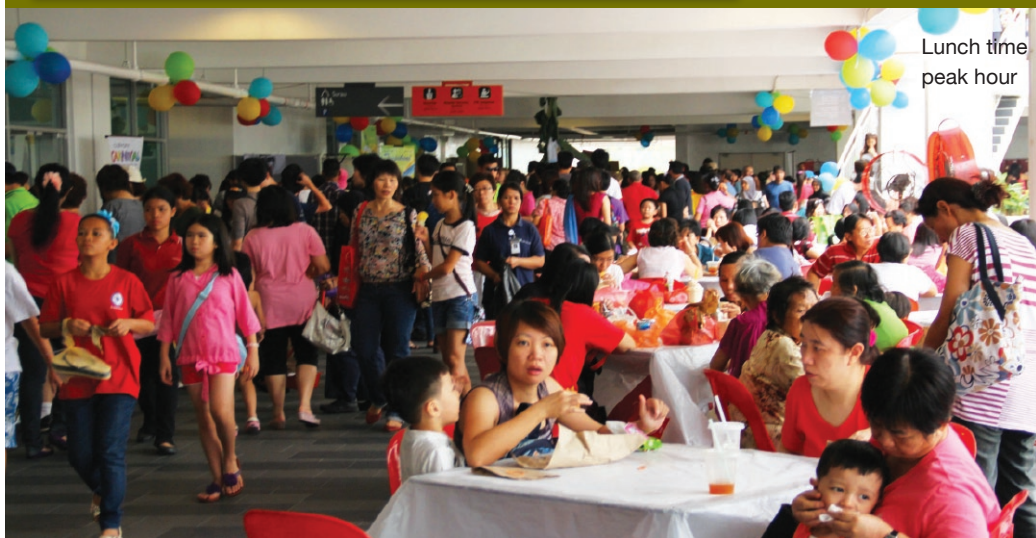
Lunch time peak hour