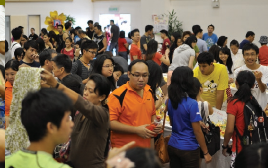
Snapping up good bargains