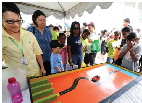
Yes, it's on the right track!

Calvary Carnival 2012 held on 30 June at the Taylor's University Lakeside Campus was hugely successful in raising funds and creating awareness for the CCC. Thank God for the Carnival Committee who worked tirelessly as early as eight months before! Their efforts paid off handsomely. And Calvarites are to be commended! Some 2500 Calvarites participated in one way or another.