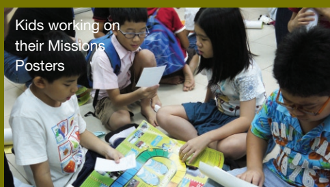
Kids working on their Missions Posters

The Carpenter's Workshop (CW) children were treated to an impactful Missions Weekend from 13–15 July 2012. Their theme was Committed to Finish the Race.