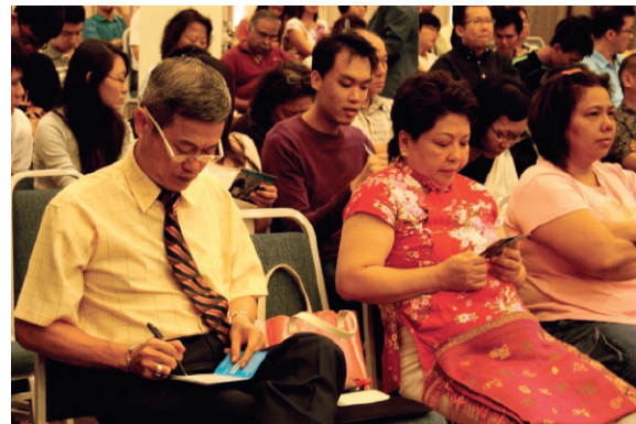
Left: Calvarites making their FP pledges