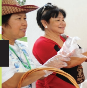
A friendly and warm team