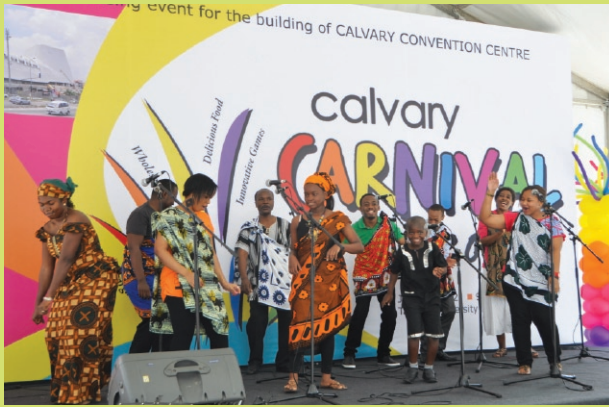
Calvary International Life Group presents a song