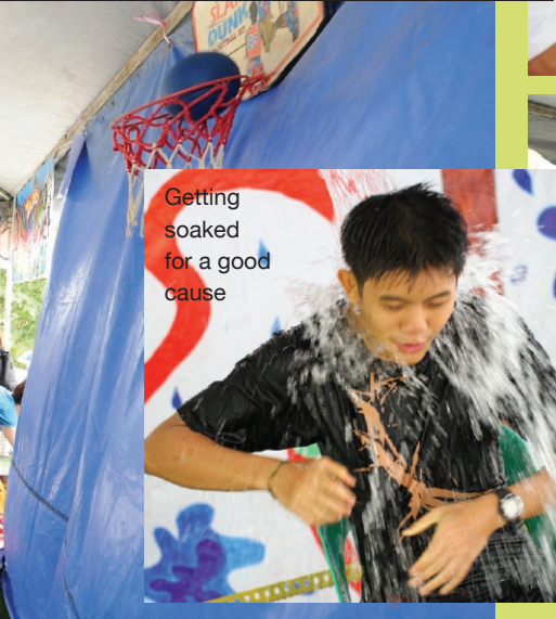
Getting soaked for a good cause