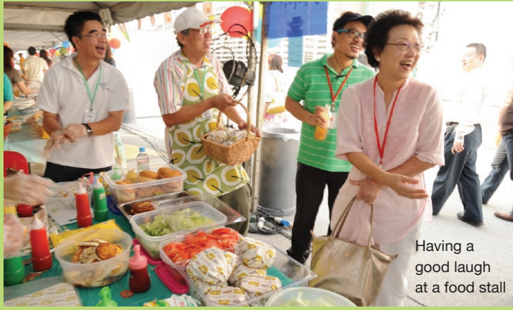
Having a good laugh at a food stall