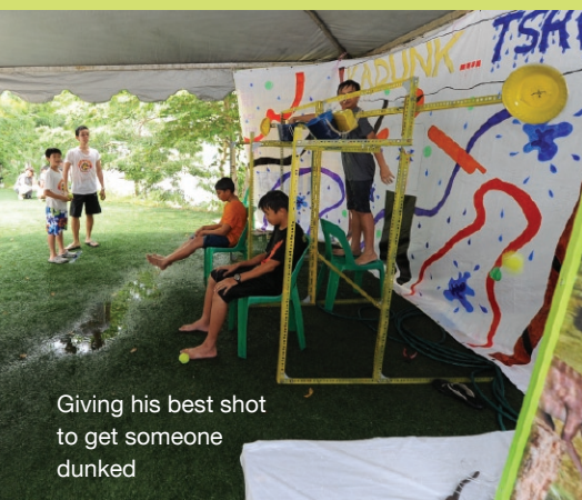
Giving his best shot to get someone dunked