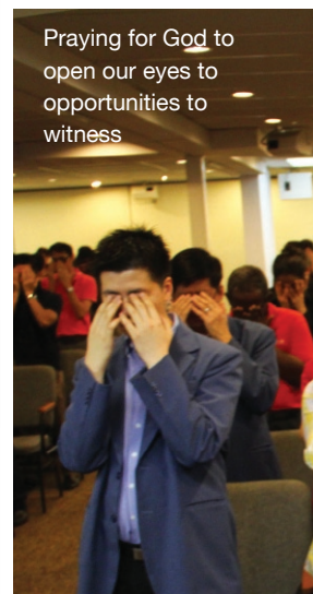
Praying for God to open our eyes to opportunities to witness