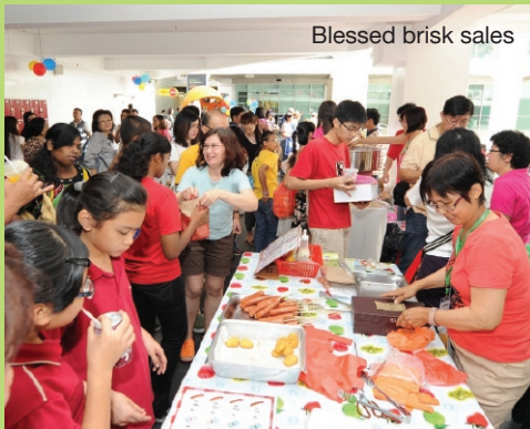
Blessed brisk sales