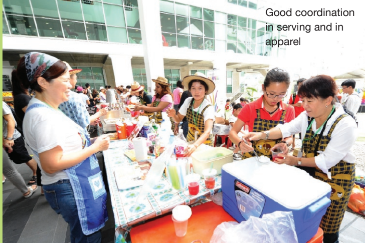
Good coordination in serving and in apparel