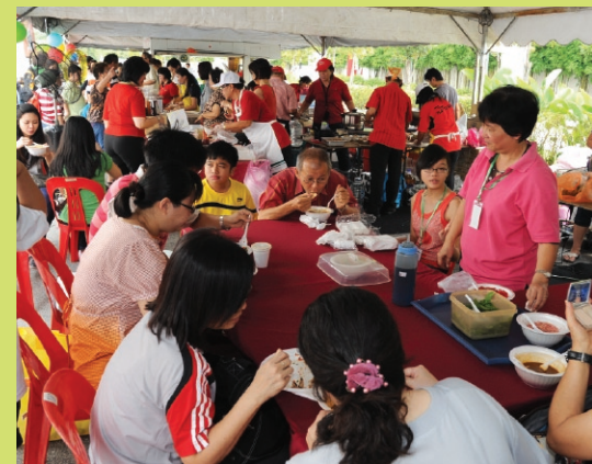
Top: Enjoying their meal