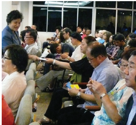
Top: Usher collecting the FP cards