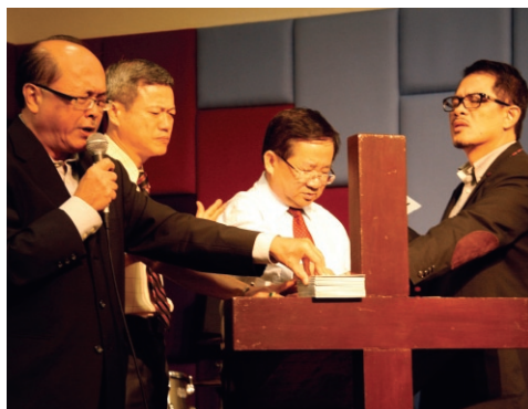
From Far Left, clockwise: Praying for Faith Promise partners symbolised by the FP pledge cards at all service locations – DH, DP, Cheras