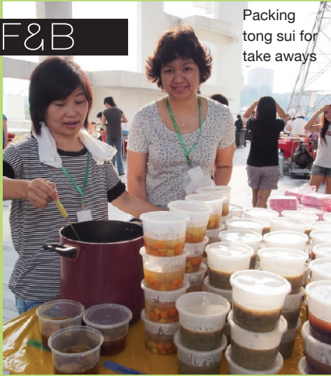
Packing tong sui for take aways