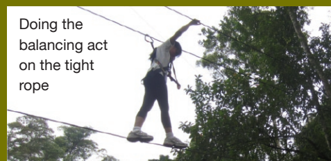
Doing the balancing act on the tight rope

We were all famished and thirsty by lunch time but each of us felt a sense of achievement and victory that we were able to overcome challenges that earlier seemed to be beyond ourselves. It was indeed a test of our physical strength, perseverance and faith in God. I am so glad that we all made it! +