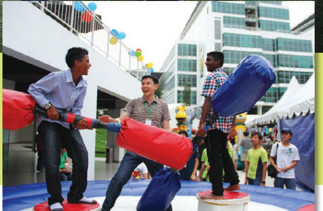
Enjoying Gladiator Game