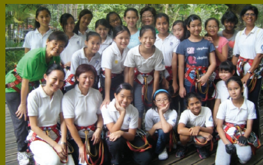
The team all set for the thrilling adventure