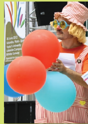
Our two emcees providing comic relief