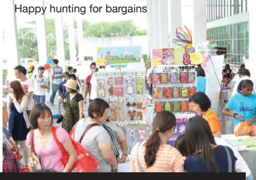
Happy hunting for bargains