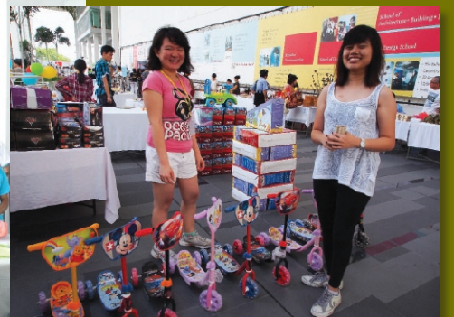
Ample room for product display