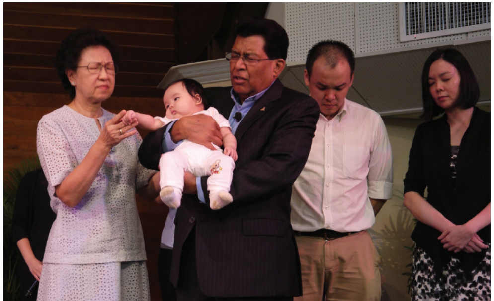
Clockwise from left