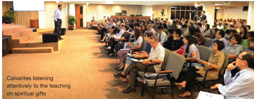
Calvarites listening attentively to the teaching on spiritual gifts

In the first session, Senior Pastor brought a holistic understanding on the purpose and benefits of spiritual gifts (1 Corinthians 1:12–2:1). Spiritual gifts refer to the supernatural manifestation by the Holy Spirit through believers. They are tools given to us by grace to continue the work of Jesus on earth. The nine gifts in 1 Corinthians 12:7–11 can be divided into 3 classifications viz. revelation gifts, communication gifts and ability gifts. Revelation gifts have to do with the message of wisdom, knowledge and the discernment of spirits.