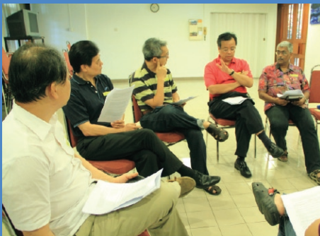
Top and right: Listening intently to the sharing | Responding to the altar call after the movie