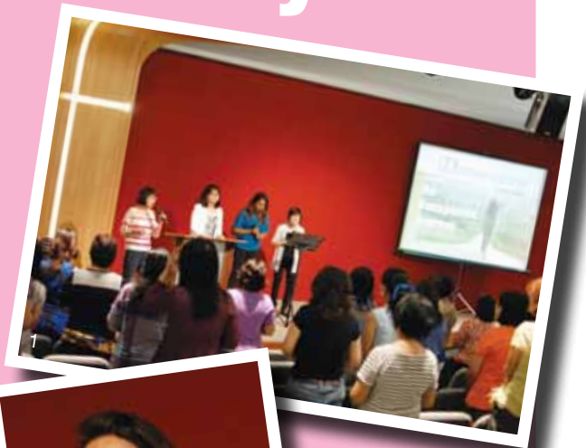
1. Women's ensemble leading in worship

Some ladies testified later that they were greatly encouraged to make a conscious effort to engage deeply in prayer and in so doing, reaped the fruit of enriching their prayer life. Some took to heart the practice of solitude for a period of 20 minutes with no agenda other than to listen to God and found it a truly blessed experience.