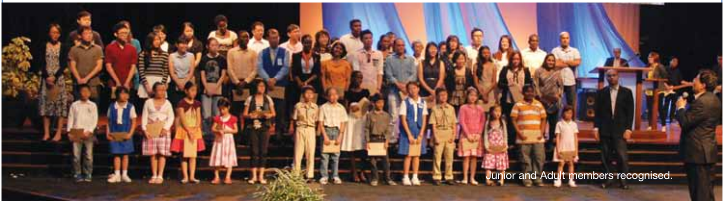
Junior and Adult members recognised.

Church membership helps the believer grow in the Christian faith as well as provides avenues for the believer to be involved in serving the Lord in various ministries.