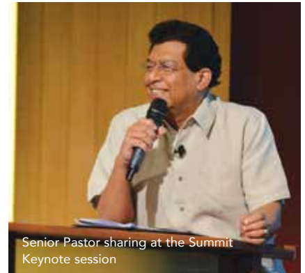
Senior Pastor sharing at the Summit Keynote session

A Church is a blessing when she is evangelistic. Calvary Church has held evangelistic meetings in public stadiums. We reach out to the lost in Kuala Lumpur and the Klang valley and other churches are blessed too. We tell those saved that they are to attend their friends' church. But we welcome those without a church to come back to our church.