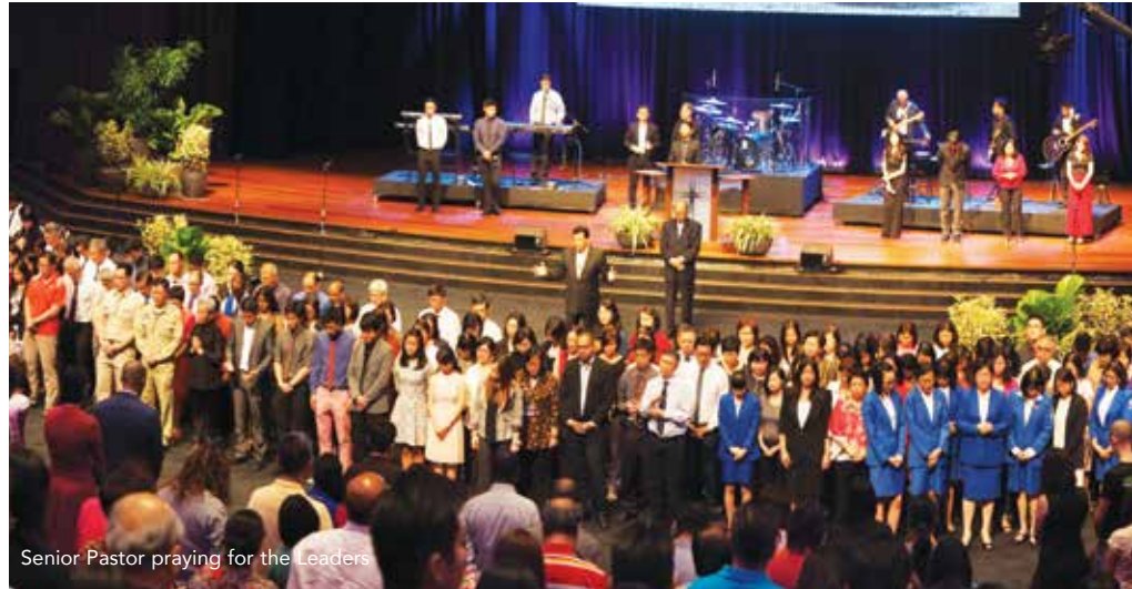
Senior Pastor praying for the Leaders

On 28 February, 220 Leaders of the various Church ministries were installed at the Sunday Worship Service at CCC.