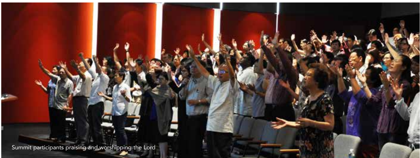
Summit participants praising and worshipping the Lord