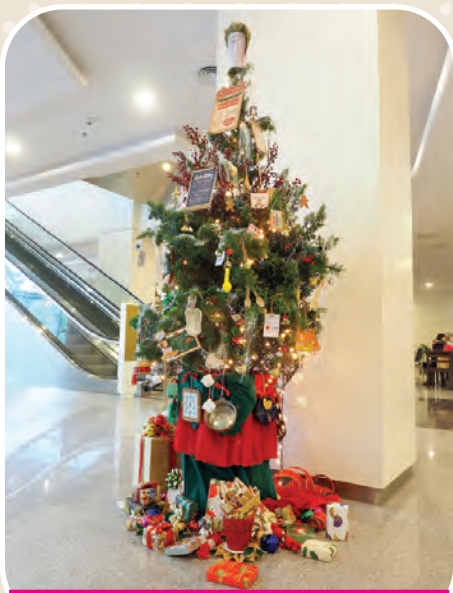
Theme : "Mama's Kitchen" Group : D'Olive Ladies