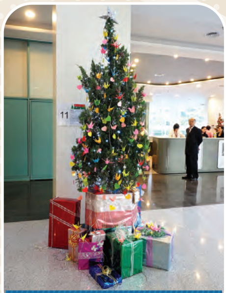
Theme : "Tree Of Hope" Group : The Ho Ho Hoes