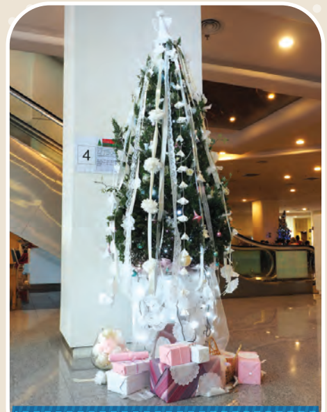
Theme : "Vintage Christmas - Ribbons Extraordinaire" Group : Peaceful Ps