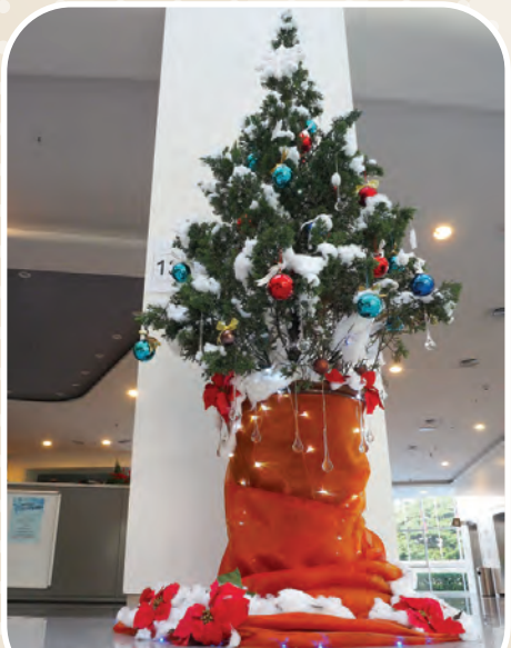
Theme : "Melting Frost" Group : Creative King