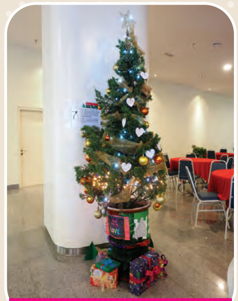
Theme : "Power Of God's Word unto Salvation" Group : Emmanuel