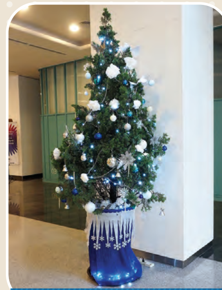
Theme : "Joy To The World" Group : The Hope