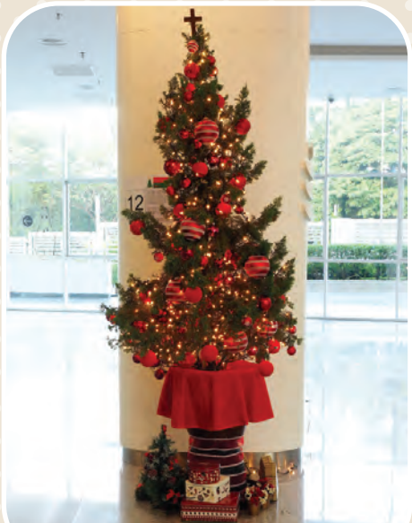
Theme : "Believe" Group : Janadelyih