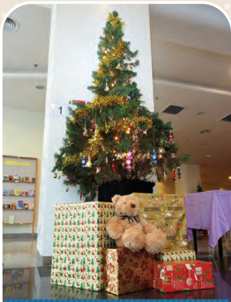
Theme : "Sweet Christmas" Group : Precious Children