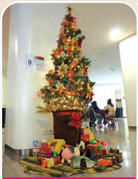
Theme : "Floral White" Group : Chocolate For Life