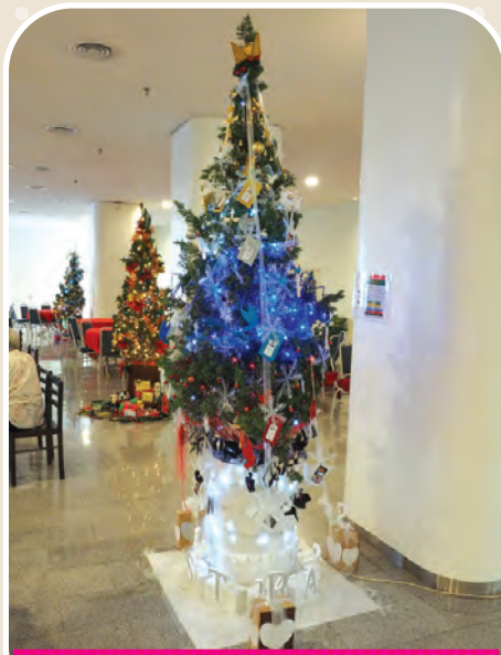
Theme : "Christmas GPS" Group : D'Miracle Family