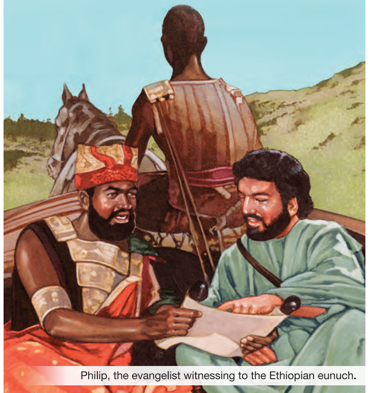
Philip, the evangelist witnessing to the Ethiopian eunuch.

The Bible continues to say, “While Peter and John were speaking to the people, they were confronted by the priests, the captain of the Temple guard, and some of the Sadducees. These leaders were very disturbed that Peter and John were teaching the people that through Jesus there is a resurrection of the dead. They arrested them and, since it was already evening, put them in jail until morning. ... The next day the council of all the rulers and elders and teachers of religious law met in Jerusalem. Annas the high priest was there, along with Caiaphas, John, Alexander, and other relatives of the high priest. They brought in the two disciples and demanded, “By what power, or in whose name, have you done this?” Then Peter, filled with the Holy Spirit, said to them, “Rulers and elders of our people, are we being questioned today because we’ve done a good deed for a crippled man? Do you want to know how he was