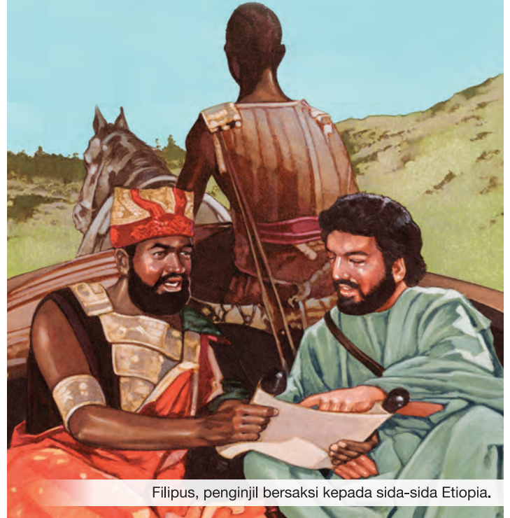
Filipus, penginjil bersaksi kepada sida-sida Etiopia.

Alkitab terus mengatakan, “Ketika Petrus dan Yohanes sedang berbicara kepada orang banyak, mereka tiba-tiba didatangi imam-imam dan kepala pengawal Bait Tuhan serta orang-orang Saduki. Orang-orang itu sangat marah karena mereka mengajar orang banyak dan memberitakan, bahwa dalam Yesus ada kebangkitan dari antara orang mati. Mereka ditangkap dan diserahkan ke dalam tahanan sampai keesokan harinya, karena hari telah malam.. ... Pada keesokan harinya pemimpin-pemimpin Yahudi serta tua-tua dan ahli-ahli Taurat mengadakan sidang di Yerusalem dengan Imam Besar Hanas dan Kayafas, Yohanes dan Aleksander dan semua orang lain yang termasuk keturunan Imam Besar. Lalu Petrus dan Yohanes dihadapkan kepada sidang itu dan mulai diperiksa dengan pertanyaan ini: "Dengan kuasa manakah atau dalam nama siapakah kamu bertindak demikian itu?" Maka jawab Petrus, penuh dengan Roh Kudus: "Hai pemimpin-pemimpin umat dan tua-tua, jika kami sekarang harus diperiksa karena suatu kebajikan kepada seorang sakit dan harus menerangkan dengan kuasa manakah orang itu