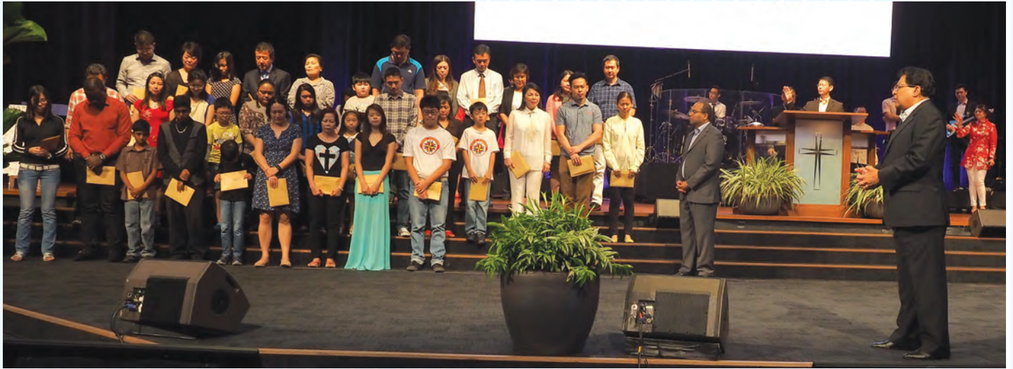
Senior Pastor prays for both the Junior and Adult members