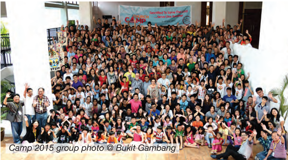
Camp 2015 group photo @ Bukit Gambang