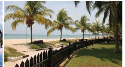
Grand Beach Resort, Port Dickson