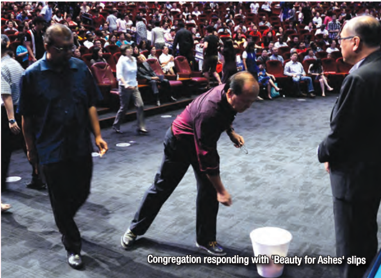
Congregation responding with 'Beauty for Ashes' slips