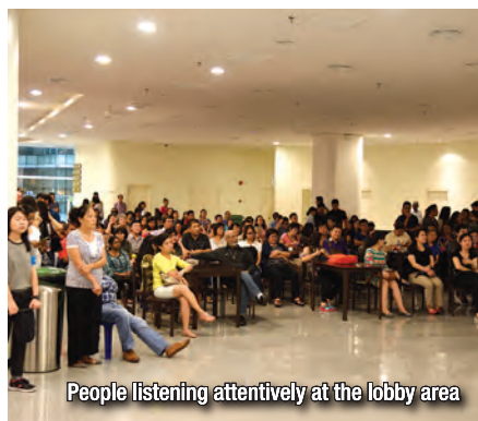
People listening attentively at the lobby area