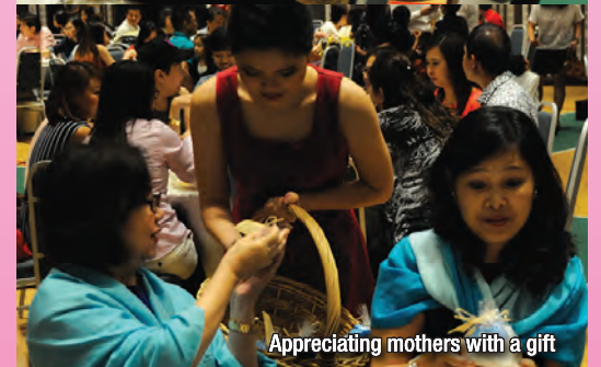
Appreciating mothers with a gift