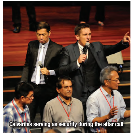
Calvarites serving as security during the altar call