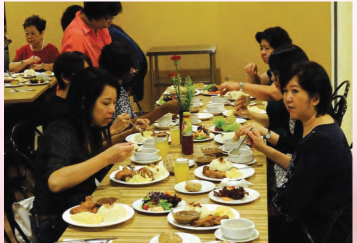
Mothers enjoying a special lunch by the Men's Ministry at Olive Cafe