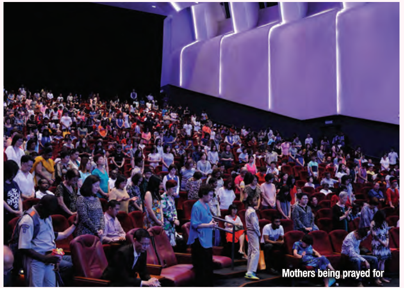
Mothers being prayed for