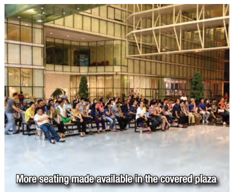
More seating made available in the covered plaza