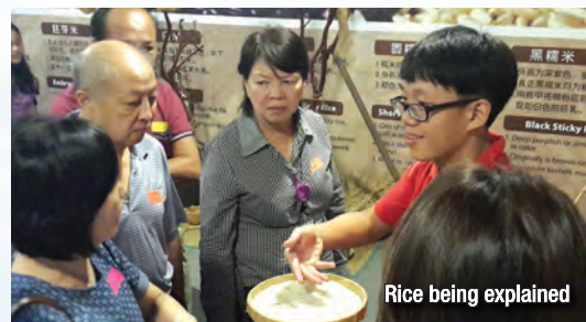
Rice being explained