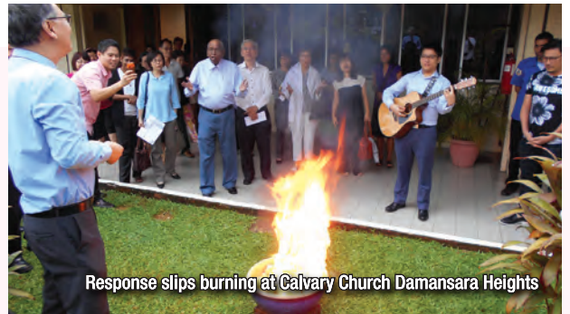
Response slips burning at Calvary Church Damansara Heights