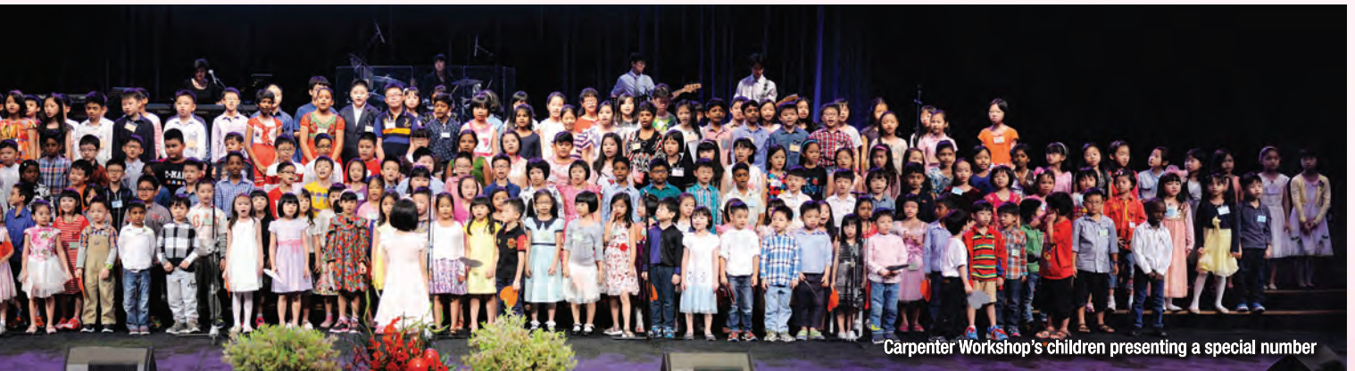
Carpenter Workshop's children presenting a special number