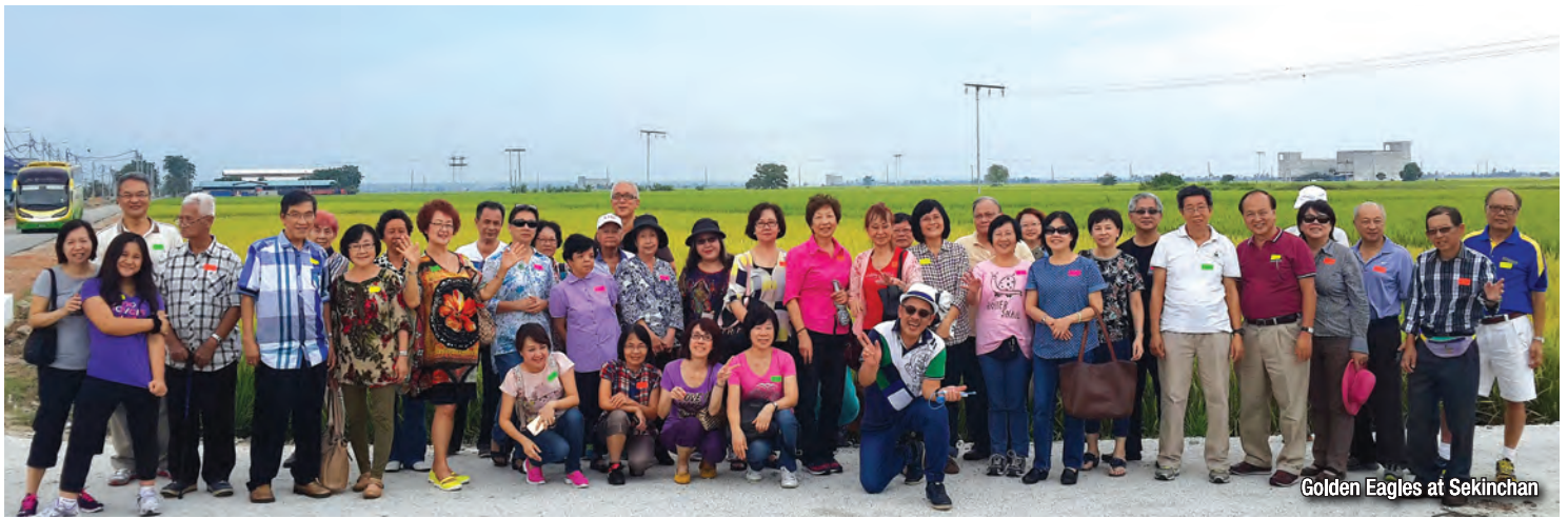
Golden Eagles at Sekinchan