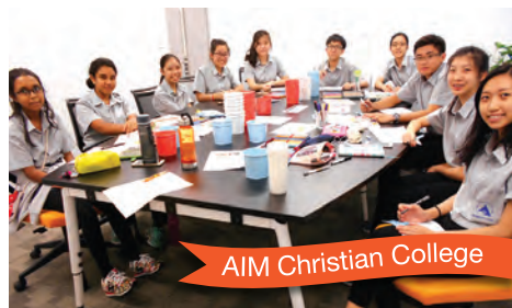
AIM Christian College