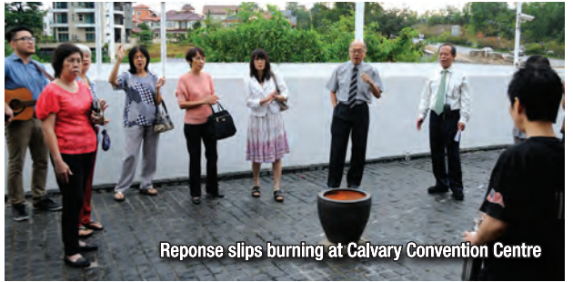
Response slips burning at Calvary Convention Centre