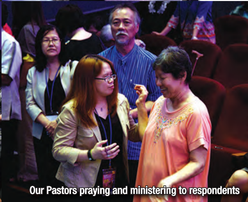
Our Pastors praying and ministering to respondents