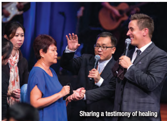
Sharing a testimony of healing