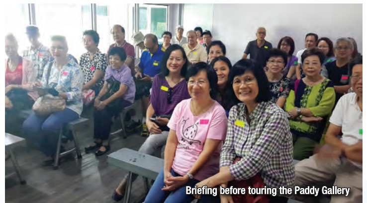
Briefing before touring the Paddy Gallery