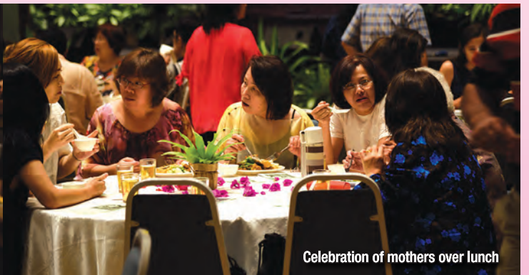
Celebration of mothers over lunch