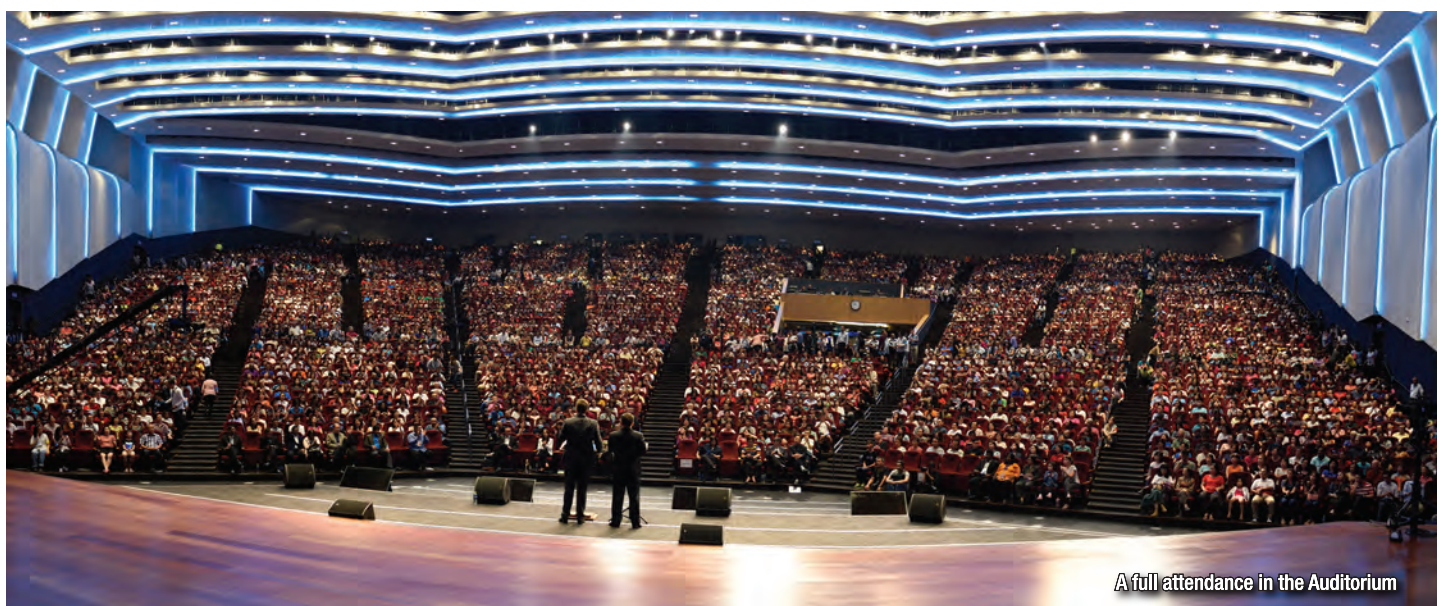
A full attendance in the Auditorium

Praise God that people from all walks of life who attended the meetings testified of God’s mercy and power as many were healed and saved during this event.