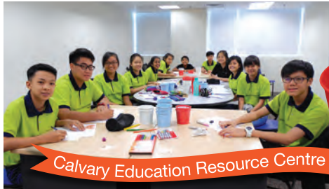
Calvary Education Resource Centre