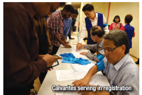
Calvarites serving in registration