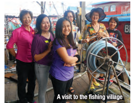
A visit to the fishing village