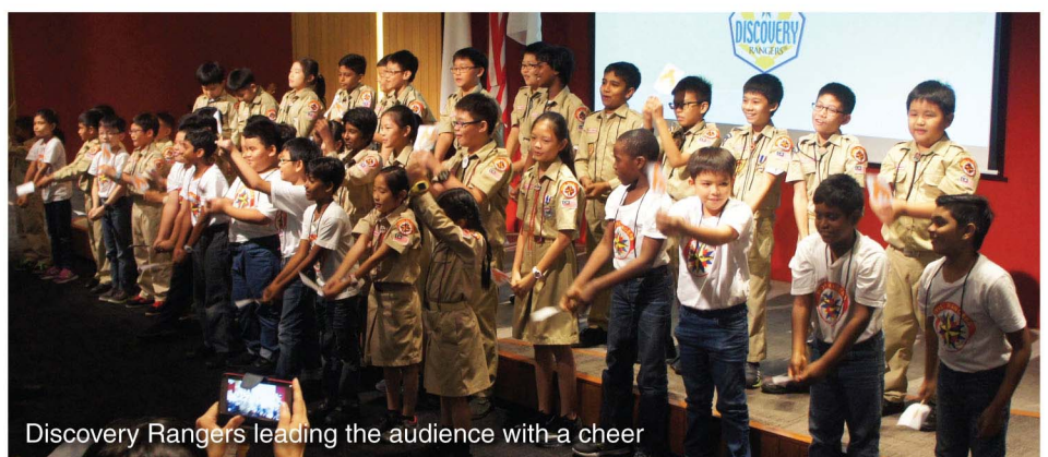
Discovery Rangers leading the audience with a cheer