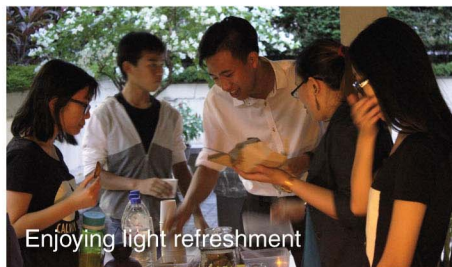
Enjoying light refreshment