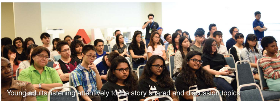
Young adults listening attentively to the story shared and discussion topics

The young adults committed themselves, their current and future relationships to God, asking God to help them glorify Him in all that they do. Many expressed that the session was a very beneficial and practical to be able to apply in their lives, and they look forward to being able to develop God-centred relationships in the future.