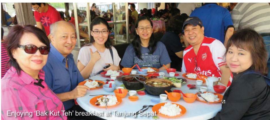
Enjoying 'Bak Kut Teh' breakfast at Tanjung Sepat

On Wednesday, 31 August 2016, the Hospitality Ministry organised a fellowship outing to Tanjung Sepat, Bukit Jugra and a visit to Calvaryland.