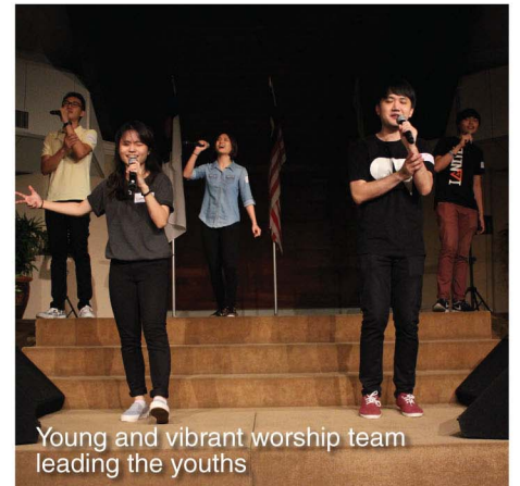
Young and vibrant worship team leading the youths

Follow us on www.fb.com/calvaryyouth.my or call 03 8999 5532 ext. 408 for more information and updates.