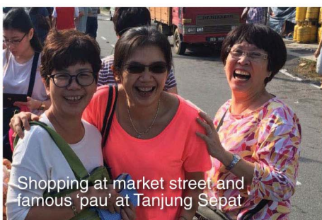
Shopping at market street and famous 'pau' at Tanjung Sepat