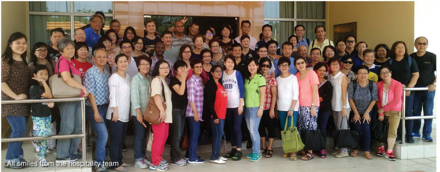
All smiles from the hospitality team