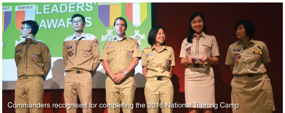
Commanders recognised for completing the 2016 National Training Camp