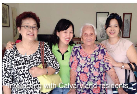
Travelling with Calvaryland residents