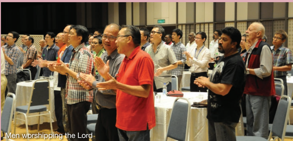
Men worshipping the Lord