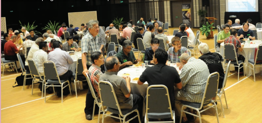
Men fellowshiping while having a sumptuous brunch