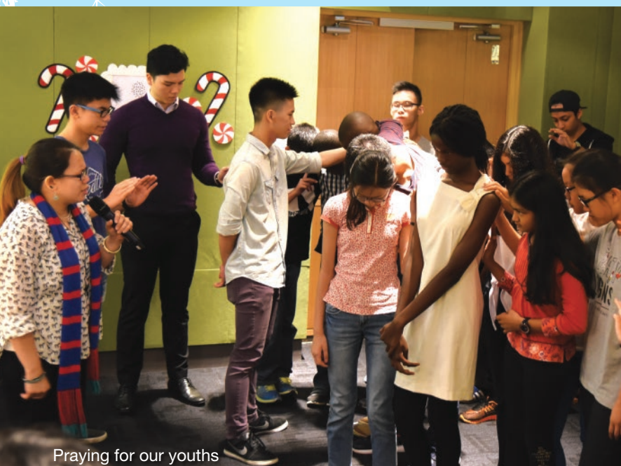
Praying for our youths

Find out more about our meetings and exciting events for 2017 at www.facebook.com/calvaryyouthmy