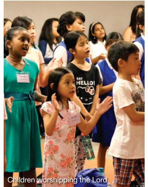
Children worshipping the Lord.

On Saturday and Sunday, 14 & 15 January 2017, with great excitement and enthusiasm, 243 children participated in the Faith Promise Commitment and eagerly pledged to proclaim the Good News, Freedom and the Lord's Favour to their family and friends who have yet to know the Lord. All glory and praise to God!