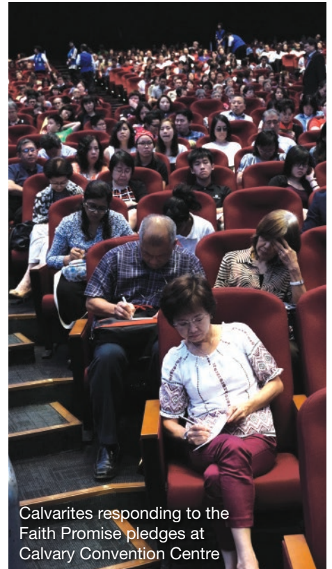
Calvarites responding to the Faith Promise pledges at Calvary Convention Centre