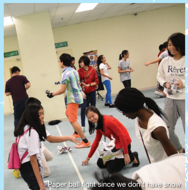
Paper ball fight since we don't have snow