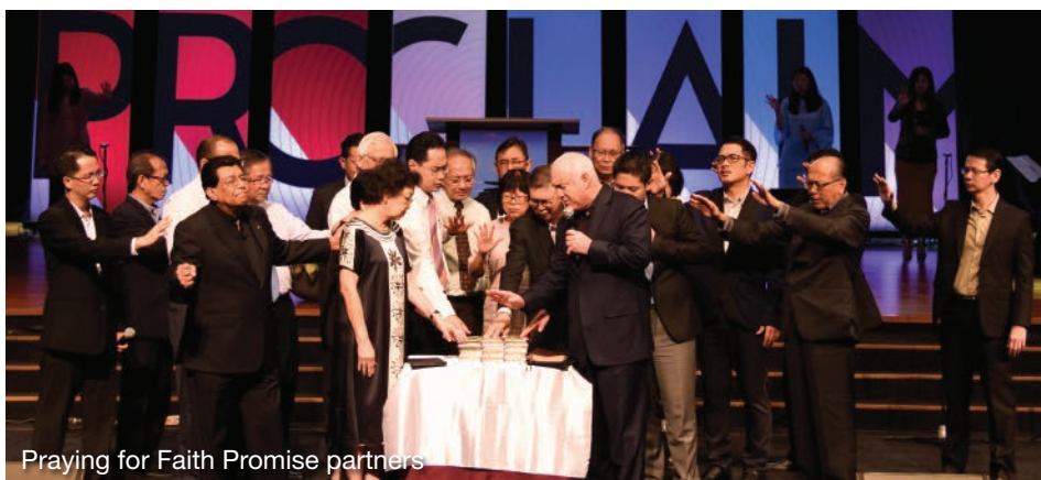
Praying for Faith Promise partners

“The Spirit of the Sovereign Lord is on me, because the Lord has anointed me to proclaim good news to the poor. He has sent me to bind up the brokenhearted, to proclaim freedom for the captives and release from darkness for the prisoners, to proclaim the year of the Lord’s favour.” (Isaiah 61:1-2)