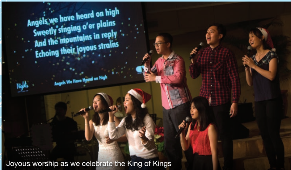
Joyous worship as we celebrate the King of Kings

Christmas is one of the best times of the year! A joyous occasion where we celebrate the birth of our Saviour.