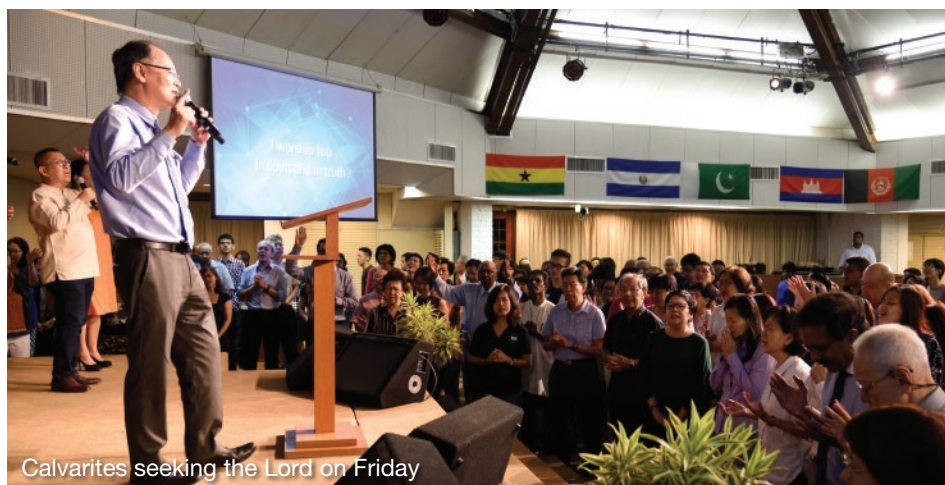
Calvarites seeking the Lord on Friday

The Bible says, “And they shall not sell or exchange any of it; they may not alienate this best part of the land, for it is holy to the Lord” (Ezekiel 48:14). God assigns the best