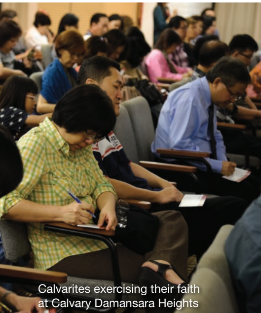
Calvarites exercising their faith at Calvary Damansara Heights