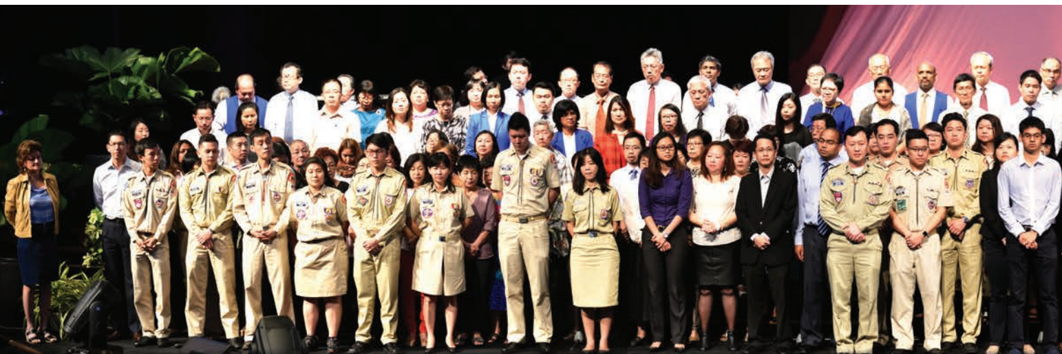
Ministries' Heads and Leaders at the altar for their installation