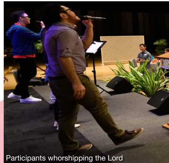
Participants worshipping the Lord