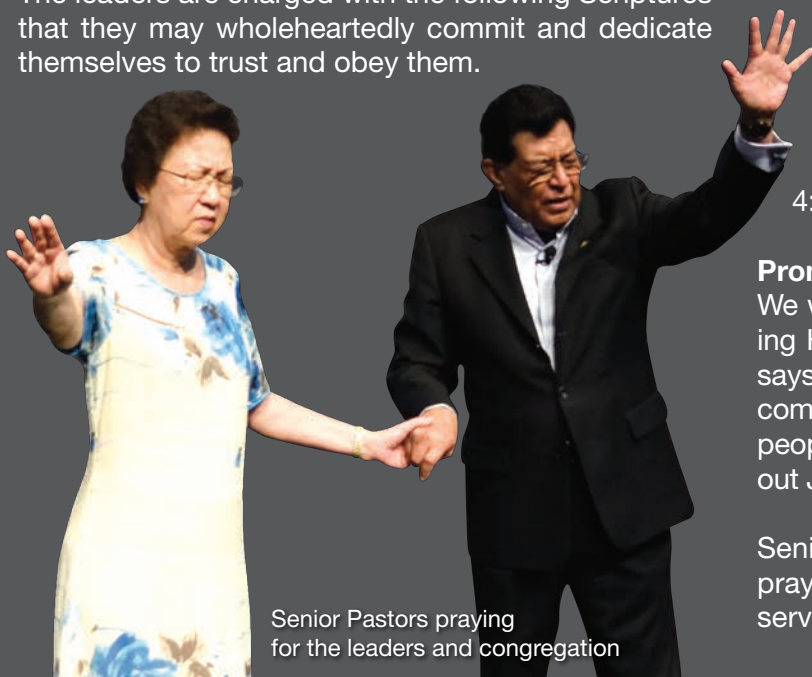
Senior Pastors praying for the leaders and congregation