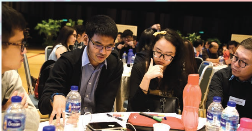
Group discussions around the tables