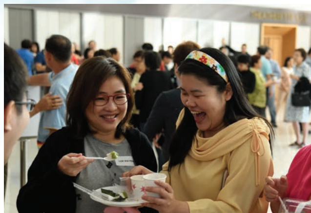
Fellowshipping over yummy food