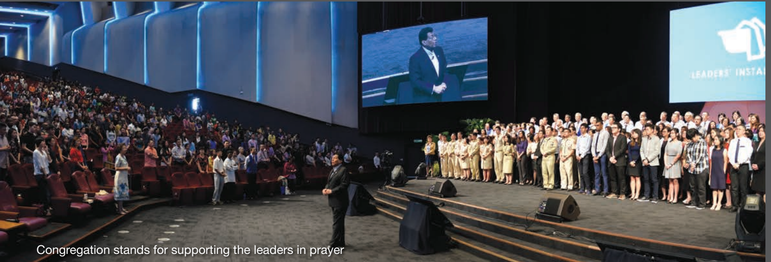
Congregation stands for supporting the leaders in prayer