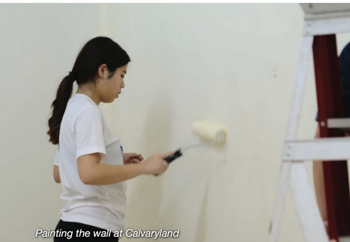
Painting the wall at Calvaryland

On 11, 18 November and 2 December 2017, 35 young adults had the opportunity to reach out to the communities through the M.A.D. Outreach Programme organized by the Youth and Young Adults Ministry. Over the span of three Saturdays, they cooked a hearty dinner for the elderly at Calvaryland, made the Calvaryland, Sunshine Home and Missions House premises look cleaner and neater, as well as carried out the gathering for the street people at Calvary Rainbow Assembly.