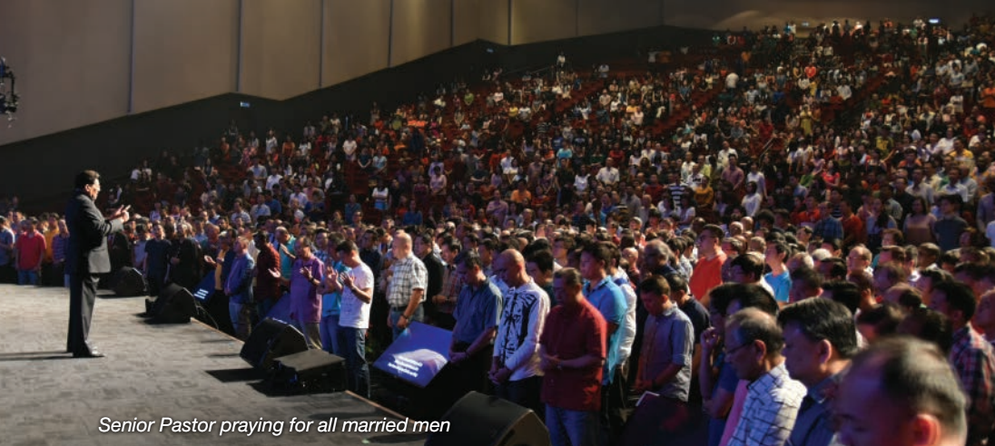
Senior Pastor praying for all married men