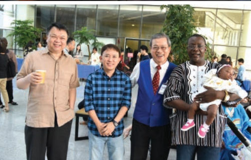
Calvarites fellowshipping during breakfast before the service