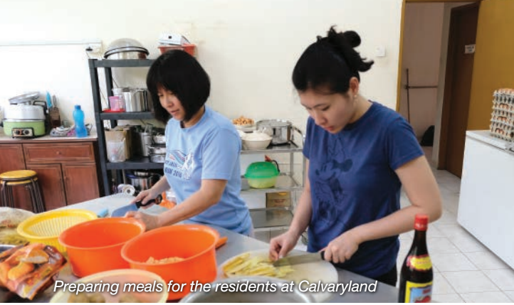
Preparing meals for the residents at Calvaryland