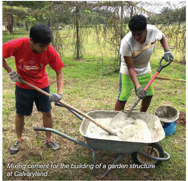
Mixing cement for the building of a garden structure at Calvaryland