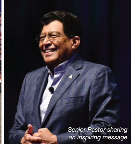
Senior Pastor sharing an inspiring message