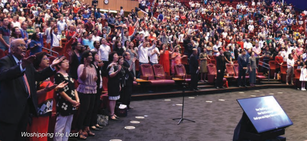
Woshipping the Lord