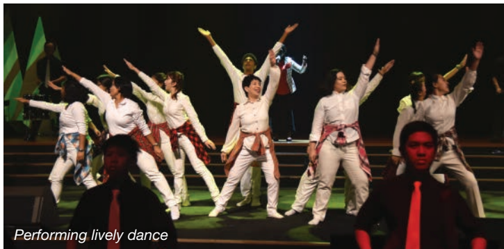
Performing lively dance