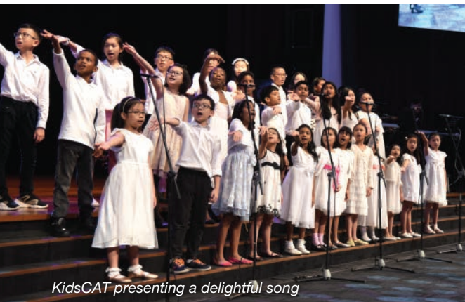
KidsCAT presenting a delightful song

It was the morning of New Year's Eve at Calvary Convention Centre (CCC) where many Calvarites were seen in fellowship over breakfast before our Year End Thanksgiving Service started. At 9.30am, songs of praise and thanksgiving filled the auditorium as the congregation were led into a time of worship. We were blessed with two special numbers presented by both the choir and the Kids Creative Arts Team (KidsCAT). After that, was a time of praise reports, as different Ministry Heads took turns to give thanks to God and share how their ministries have been blessed in 2017. Indeed, we were greatly encouraged and challenged to see greater growth in our ministries for the upcoming year.