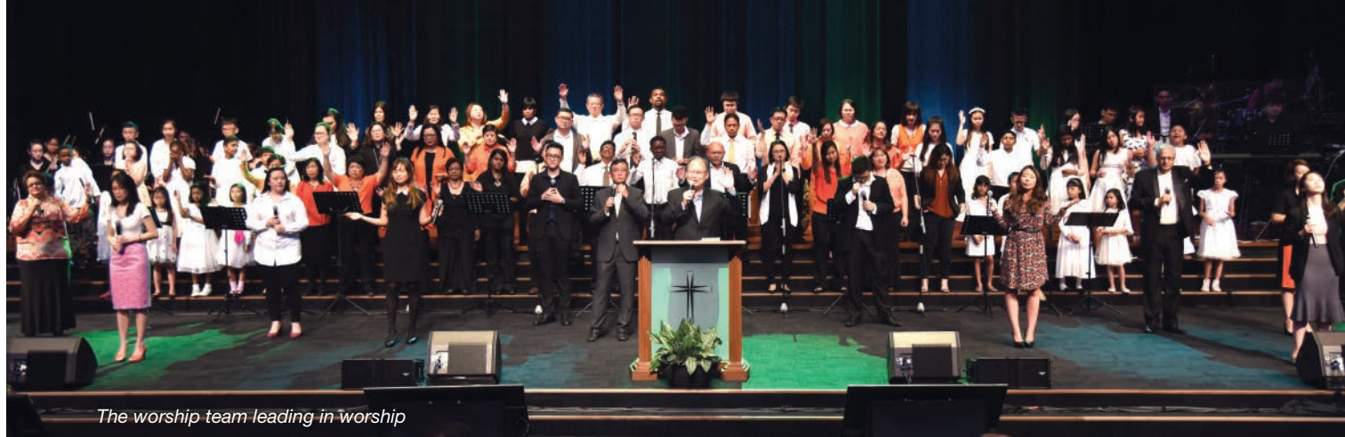
The worship team leading in worship