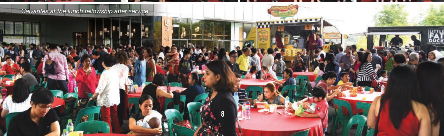
Calvarites at the lunch fellowship after service