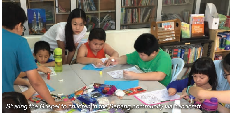
Sharing the Gospel to children in the Sepang community via handcraft