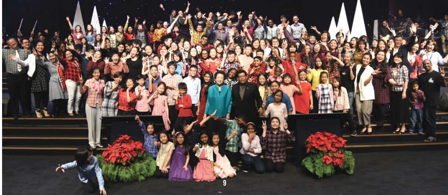
The entire cast and crew of the special Christmas performance