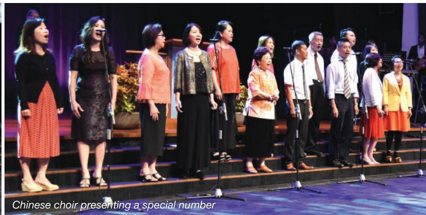
Chinese choir presenting a special number