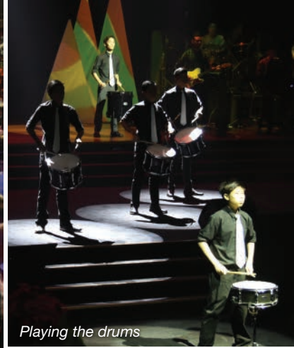
Playing the drums