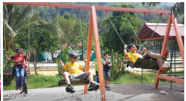
Having a splendid time on the swings