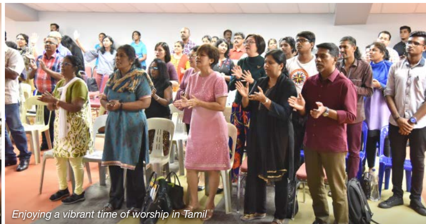
Enjoying a vibrant time of worship in Tamil