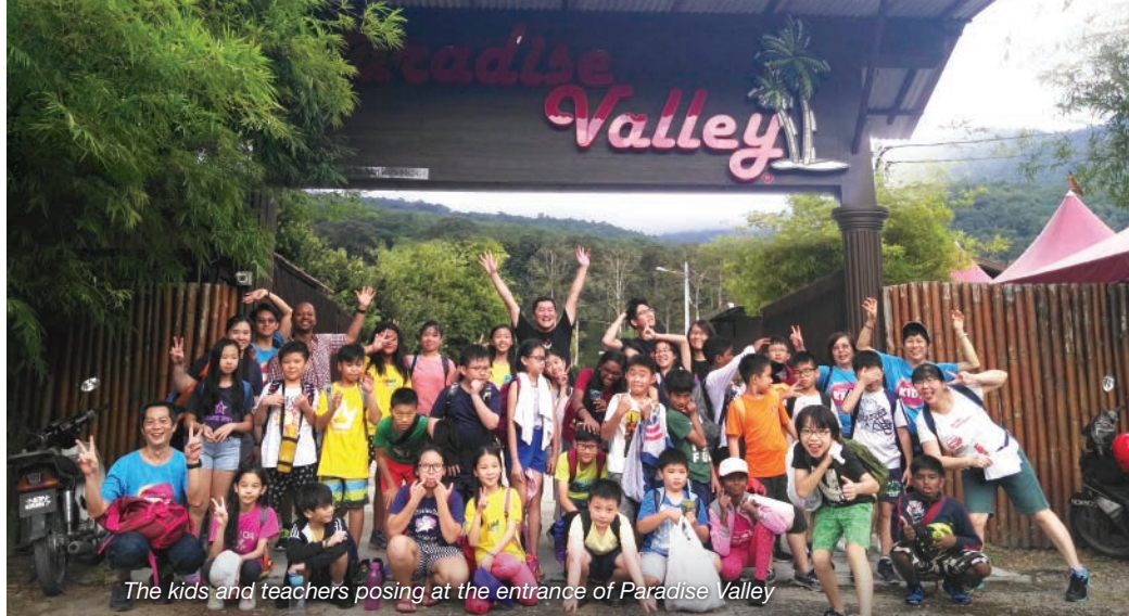
The kids and teachers posing at the entrance of Paradise Valley