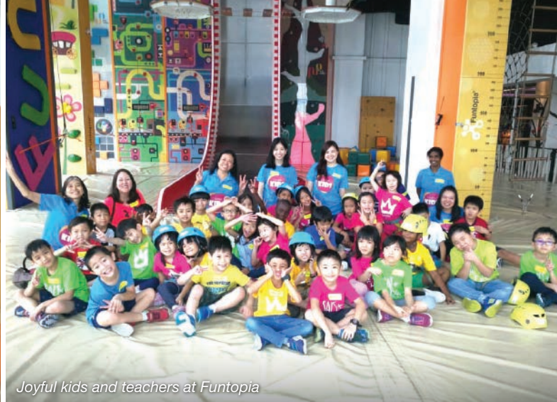
Joyful kids and teachers at Funtopia