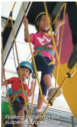
Walking by faith on the suspended rope bridge