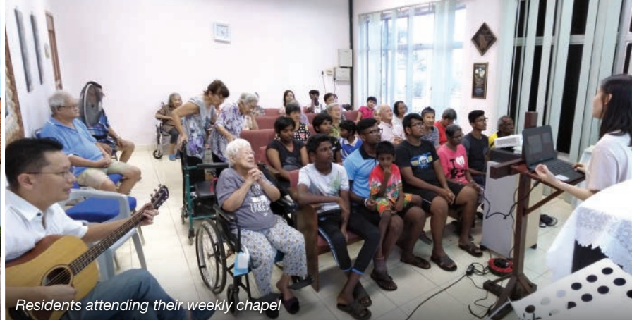
Residents attending their weekly chapel