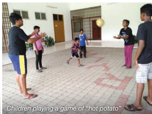
Children playing a game of “hot potato”