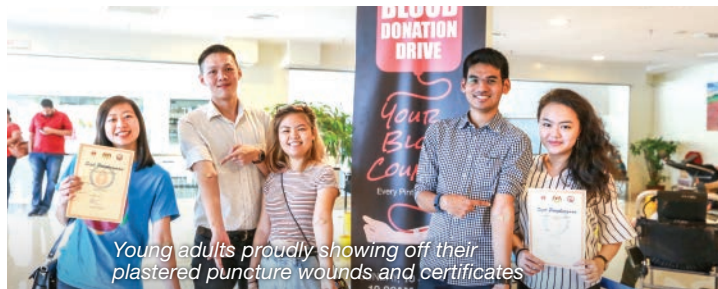
Young adults proudly showing off their plastered puncture wounds and certificates