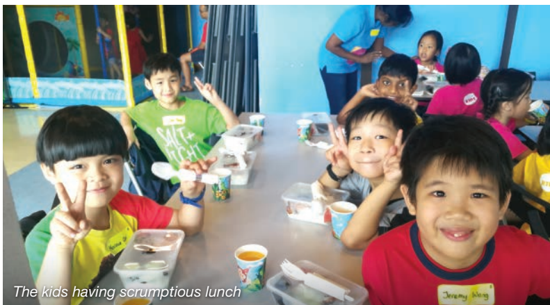
The kids having scrumptious lunch