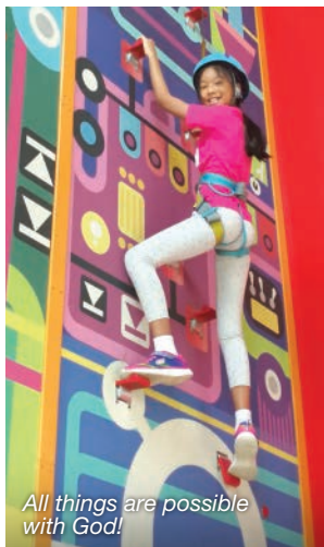
All things are possible with God!

Praise God for the new friendships formed, bonds strengthened and a fun-filled experience for the kids!