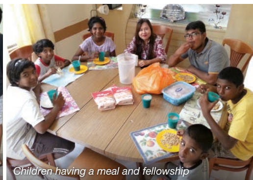
Children having a meal and fellowship