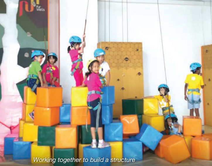
Working together to build a structure