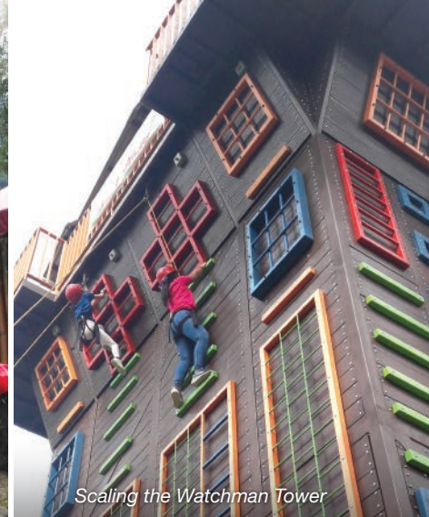
Scaling the Watchman Tower