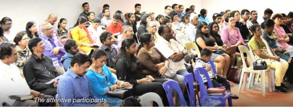
The attentive participants