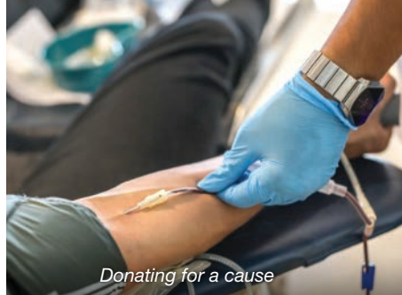
Donating for a cause