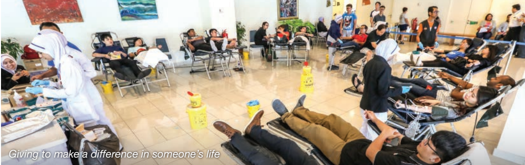
Giving to make a difference in someone's life