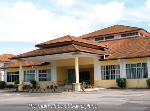
The main office at Calvaryland