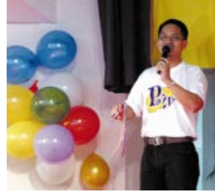
The worship team ▼