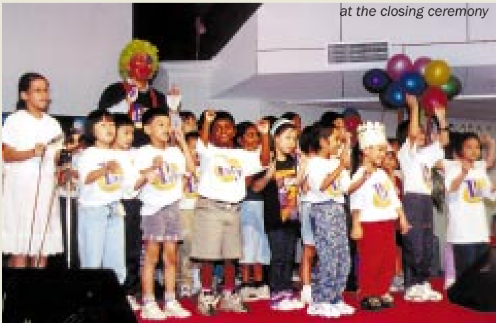
Singing the theme song at the closing ceremony