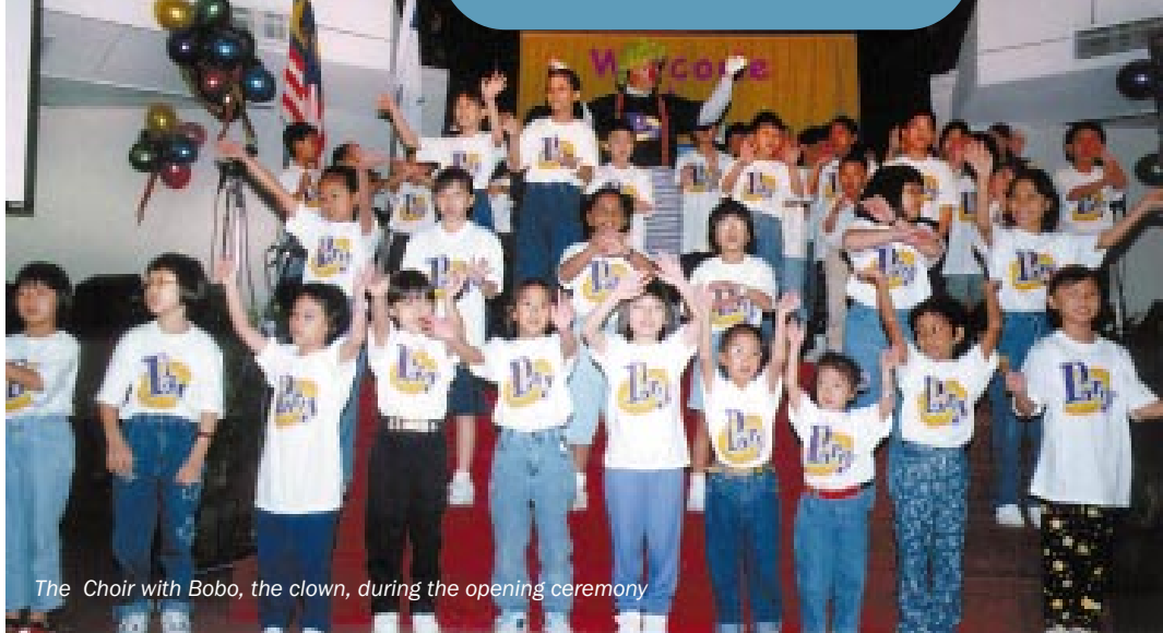
The Choir with Bobo, the clown, during the opening ceremony