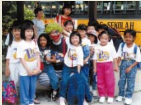
Singing the theme song at the closing ceremony