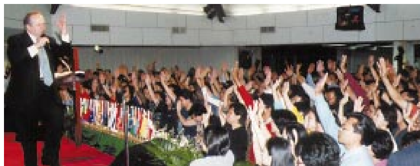
The people indicating their desire to receive the Lord's deliverance from their fears

In order to develop and restore our hope in Christ, we have to realise that: