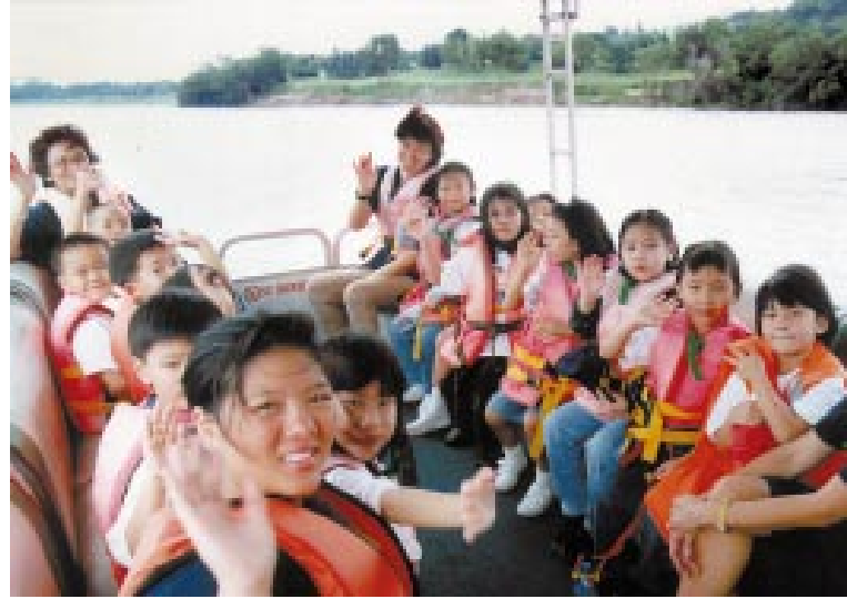
Enjoying the boat ride at the Mines Wonderland