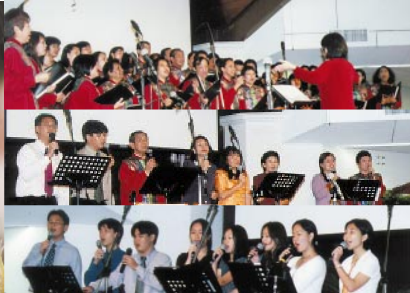
The Choir and ensembles presenting special songs nightly