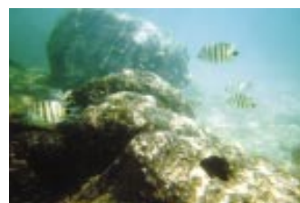
God's creation underwater

day and we were able to see the corals and the marine life that depended on it. We enjoyed the snorkelling so