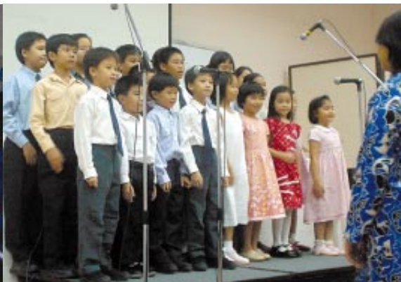
The CW Choir in Bandar Utama

her son was raised to life! Once again, she experienced a miracle. Then came Elisha's warning of an impending famine and she experienced God's protection from starvation. When