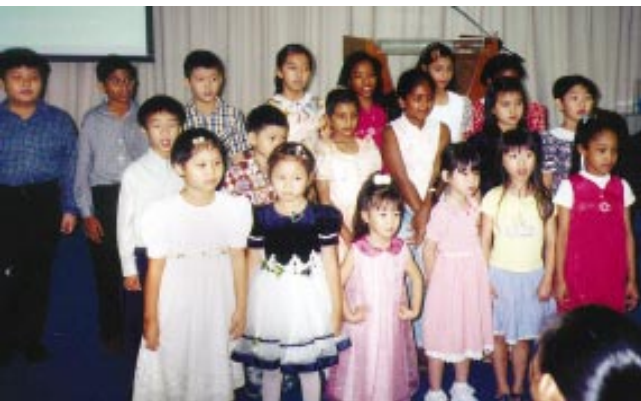
The CW Choir in Ampang

response to their faith in God to restore and provide. 🙏