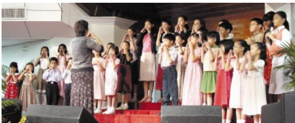
The Carpenter’s Workshop (CW) Choir in Damansara Heights singing for their mothers while four of the girls did a dance