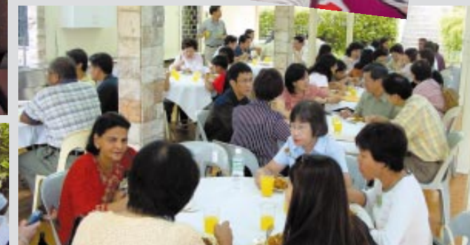
More fellowship over refreshments graciously sponsored by TT Resources Bhd at the Calvary Refreshment Centre