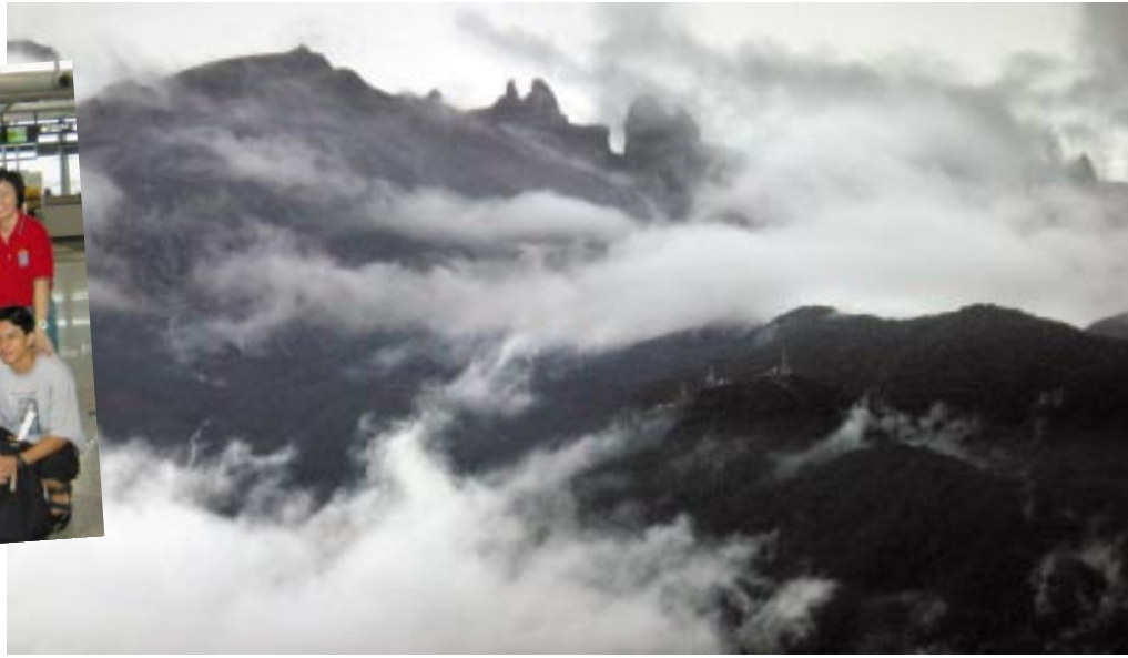
Mount Kinabalu shrouded in mist