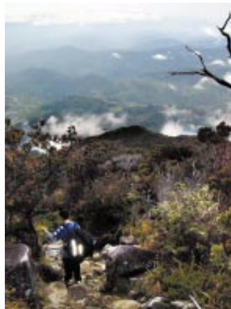
Descending the mountain...

temperature was just above freezing and we were greeted with small hailstones instead of a sunrise. We did not stay long because it was so cold that our hands had gone numb. The only evidence that we had reached the summit was a signboard that said 'Low's Peak' (4,095 metres), the highest peak in Southeast Asia named after the first recorded ascent by Sir Hugh Low. Still, overcoming all the difficulties and the extreme weather conditions made the ascent of Mount Kinabalu even sweeter. The satisfaction of knowing we have conquered the highest peak in the Southeast Asia was too much for words to describe.