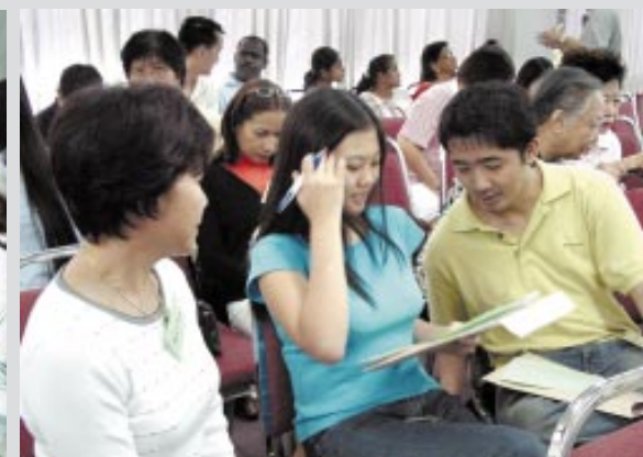
Getting to know our new friends