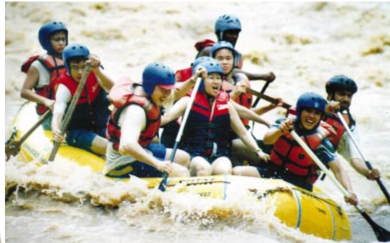
Whitewater rafting—an exhilarating experience!

We had breakfast near the jetty before taking a boat to Sapi Island, where we were to go snorkelling. After a 20-minute ride, we arrived and soon enough, were enjoying God's creation underwater as we "ooh-ed" and "aah-ed" at the schools of fish swimming around us. The water was very clear that