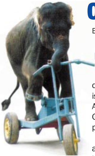
Whatever will elephants do next?

All in all, they were thankful to have the opportunity to participate in this outing. Truly it was a wonderful trip! 🙏