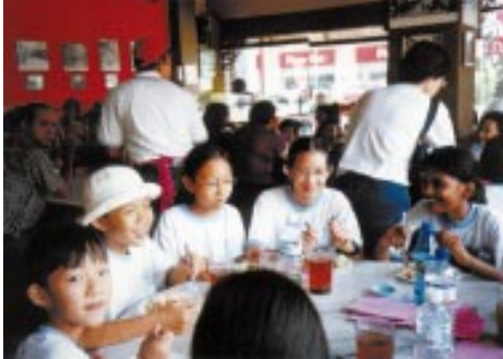
Trying out the famous chicken rice balls!