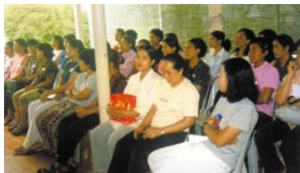
The Indonesian LGs at the Special Lunch and Cooking Demonstration