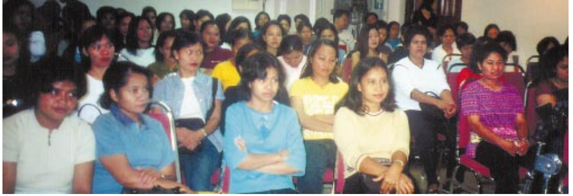
Blessed by the devotion before setting off to Malacca