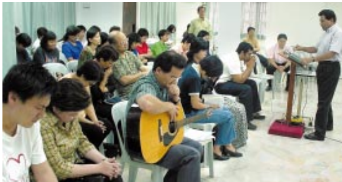
Senior Pastor praying for the team

It was indeed a very beneficial and an encouraging afternoon. All glory and praise to God! 🙏