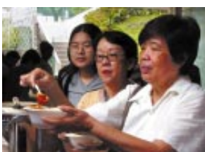
Hmm...that looks good...