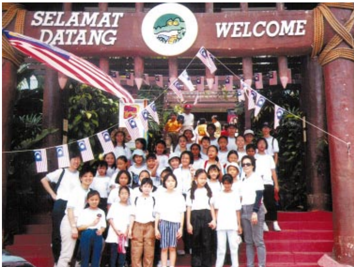
At the Crocodile Farm

with an eye-opening "Malacca River Cruise-Ride" along the "muddy waters". Besides viewing the different landmarks, they were amazed by the many iguanas that live under the houses!