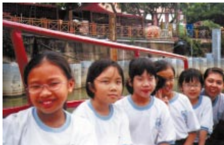
Enjoying the "Malacca River Cruise-Ride"

with an eye-opening "Malacca River Cruise-Ride" along the "muddy waters". Besides viewing the different landmarks, they were amazed by the many iguanas that live under the houses!