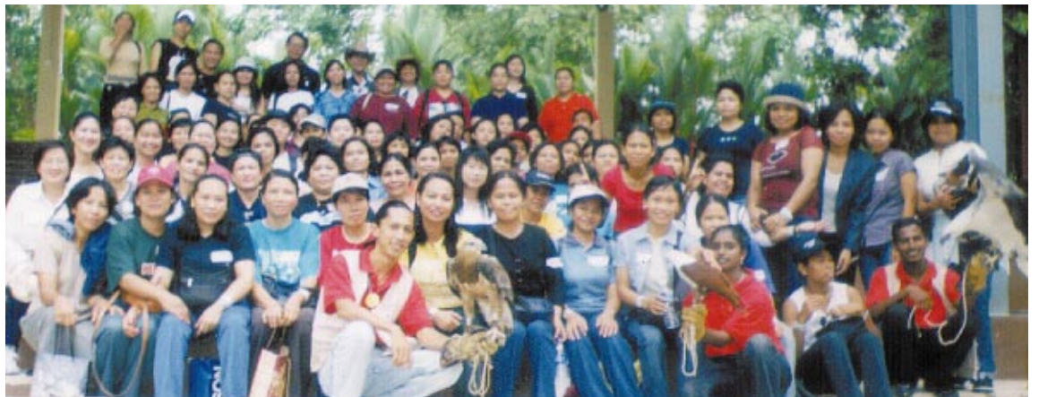
The group at A' Famosa