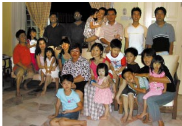
The Bukit Antarabangsa LG