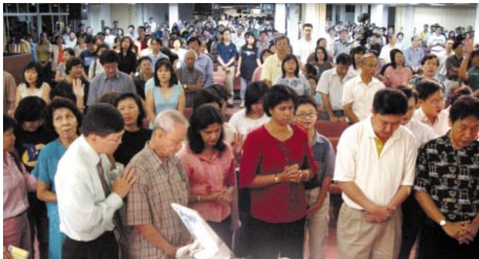
Responding to God at the end of the meeting