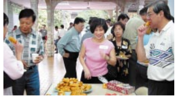
Enjoying the food they contributed

About 80 ministry personnel from the Ushering, Visitors' Lounge and Information Counter Ministries attended the Hospitality Fellowship held on the Saturday afternoon of 18 October 2003.