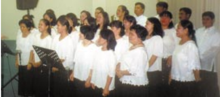
The Filipino Choir

“Praise the Lord for His Faithfulness” was the special song of testimony sung by the Filipino Choir during the annual Thanksgiving Service of the Filipino Life Group Ministry which was held on Sunday, 9 November 2003 at Calvary Church Ampang. The Lord indeed has been good and answered many of their prayers and lifted their burdens.