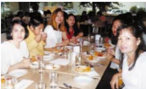
Fellowship over hi-tea at a nearby hotel

Finally, together with the Pastors, the group proceeded to fellowship over hi-tea. ☺