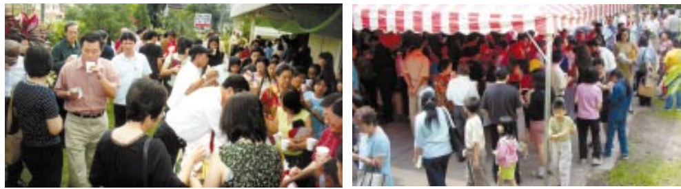
Fellowship over light refreshments provided at various locations of the Church premises