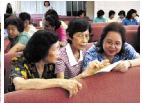
Ladies interacting with one another while trying to form as many words as possible with the word, "Pleasure"