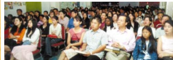
At the overflow room at the Education block