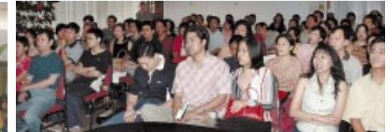
More overflow rooms: at the Worship Nursery (above) and at Berean bungalow