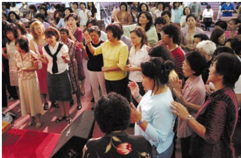
Thanking the Rose of Sharon for His love and praying to be the aroma of Christ

2 Corinthians 2:15 which says, "For we are to be to God the aroma of Christ among those who are being saved and those who are perishing." So we are to walk in love and be the fragrance of life. 🌸