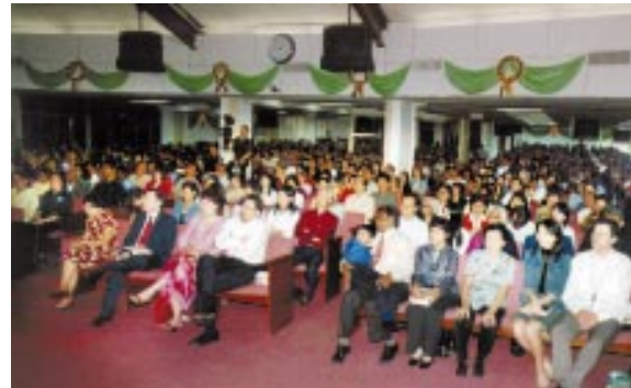
The packed sanctuary during the 8am Worship Service and the equally packed sanctuary during the 10.30am Worship Service.