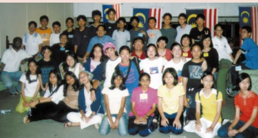
The CW 2J Graduating class with their retreat speakers, teachers and chaperones 10

We would like to thank our teachers and chaperones for taking care of us. 🙌