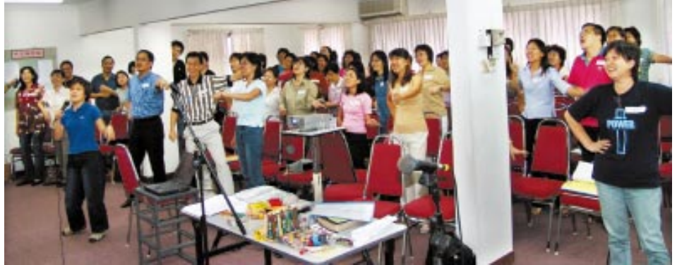
Participants learning to put actions to the songs they teach the children