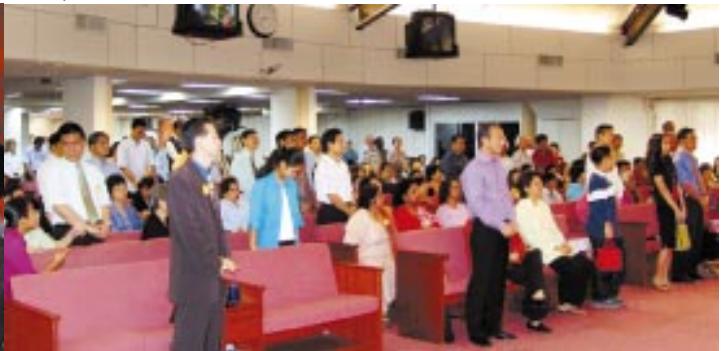
A total of 653 fathers who attended the various Services received gifts from Calvary Church