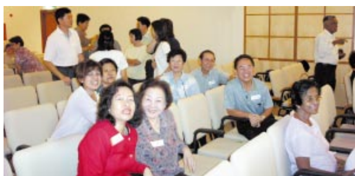
Participating in an ice-breaker