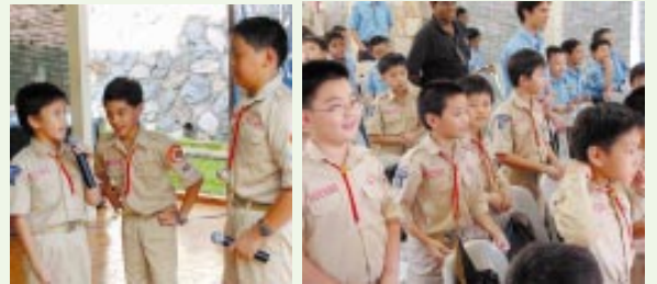
Rangers presenting a skit and also enjoying the presentations