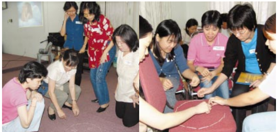
There's more than one way to make a circle with toothpicks—a lesson on paradigm shift