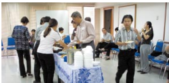
Fellowship over a delicious 'tim sum' breakfast