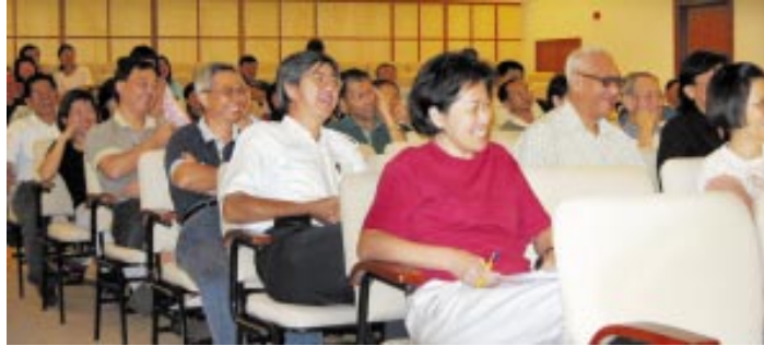
The participants enjoying the Seminar