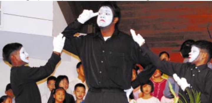
A mime by the Music & Creative Arts Department accompanied each choir