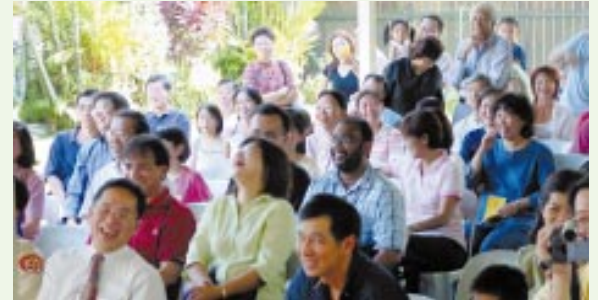
Parents and relatives enjoying the presentation