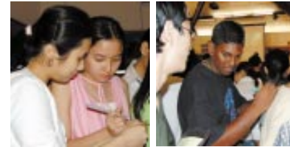
Inclusive: attended by the young and the young at heart!