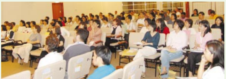
The participants listening attentively