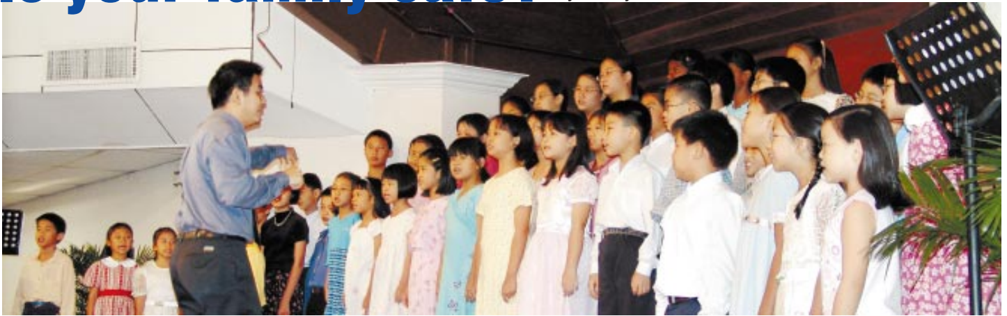
Different groups of Carpenter's Workshop children sang "Rock On Rock" at the Worship Services