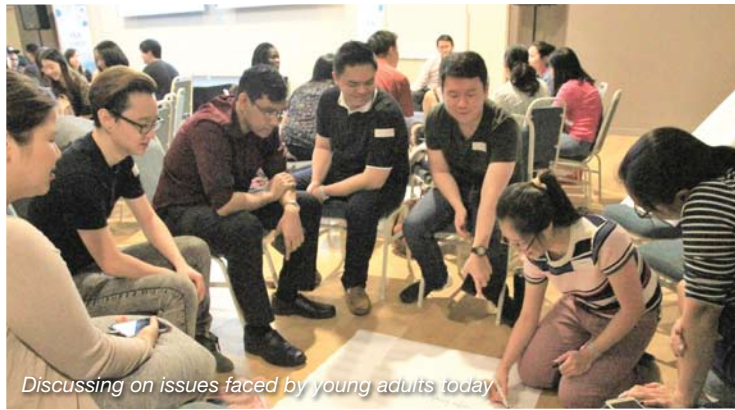
Discussing on issues faced by young adults today