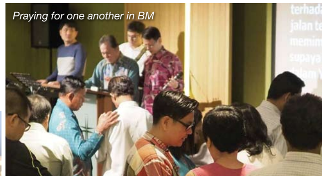
Praying for one another in BM