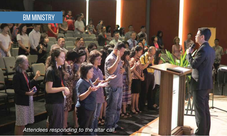
Attendees responding to the altar call