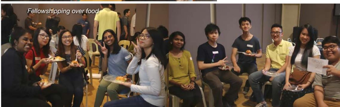
Fellowshipping over food