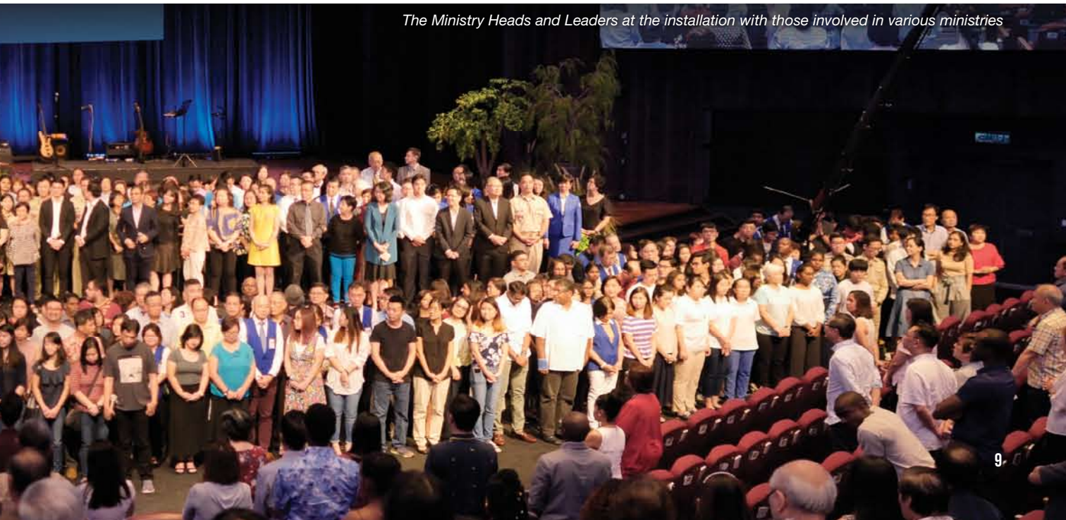
The Ministry Heads and Leaders at the installation with those involved in various ministries