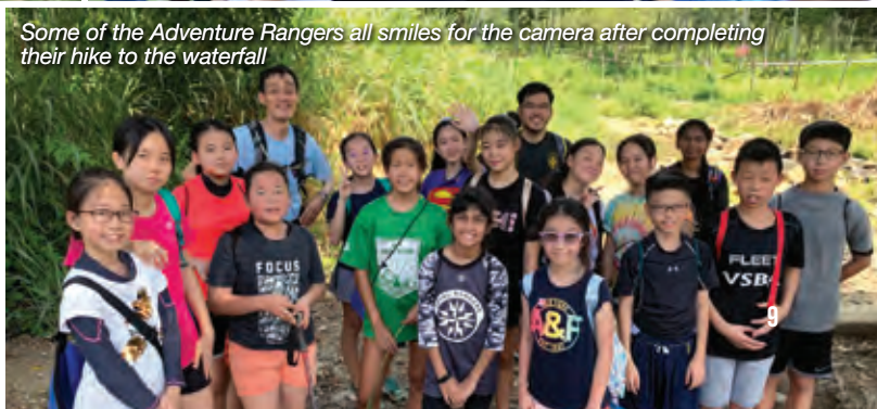
Some of the Adventure Rangers all smiles for the camera after completing their hike to the waterfall