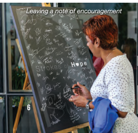
Leaving a note of encouragement