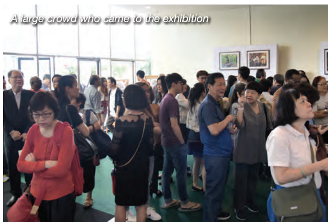
A large crowd who came to the exhibition