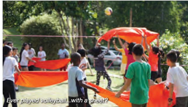
Ever played volleyball...with a sheet?