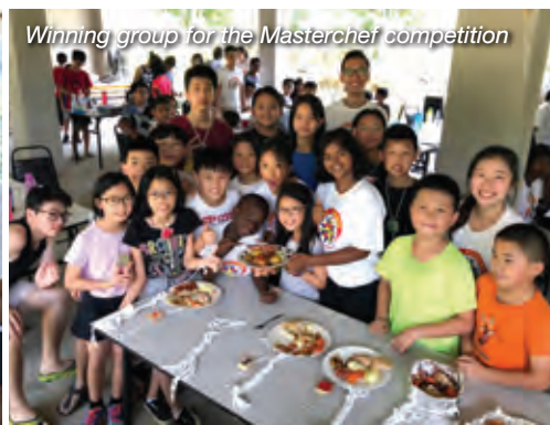
Winning group for the Masterchef competition