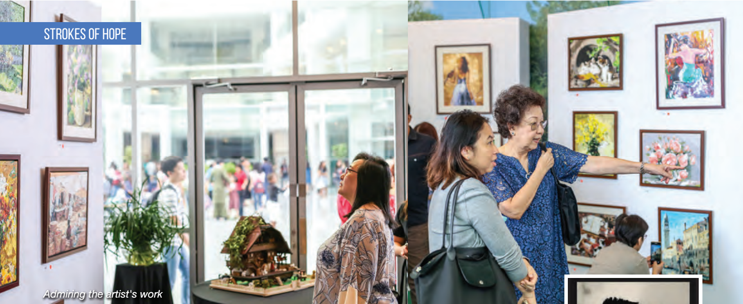
Admiring the artist's work