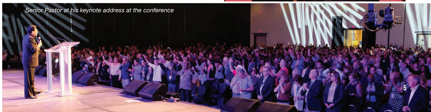
Senior Pastor at his keynote address at the conference