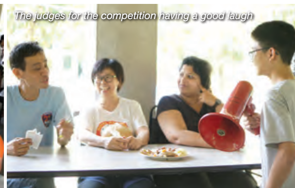
The judges for the competition having a good laugh