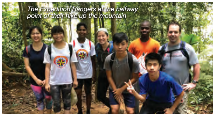
The Expedition Rangers at the halfway point of their hike up the mountain