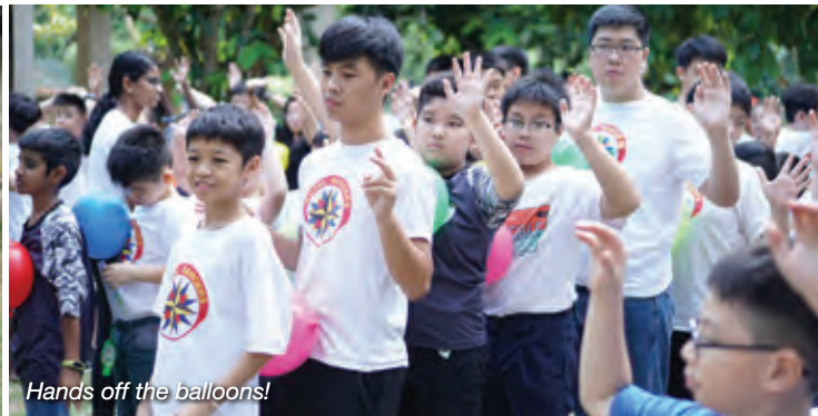
Hands off the balloons!