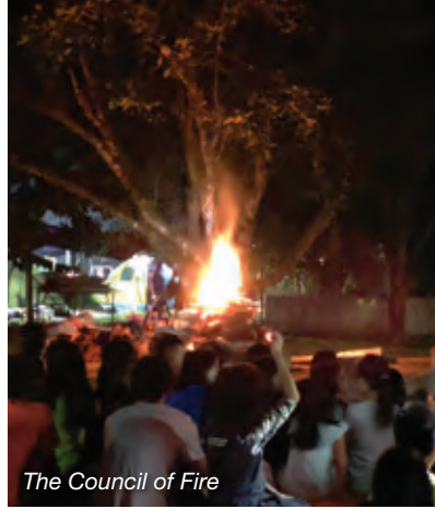
The Council of Fire