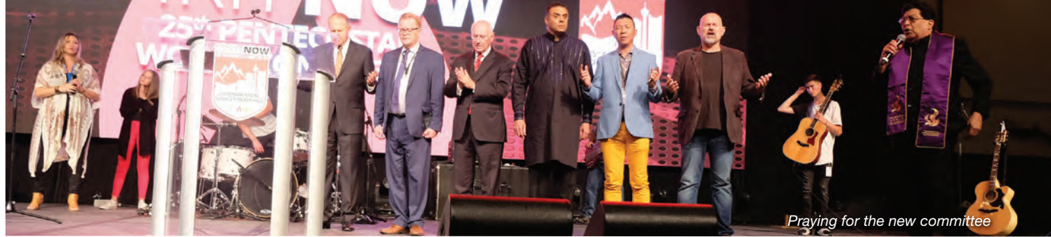
Praying for the new committee