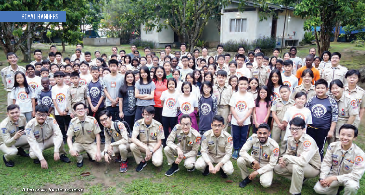
A big smile for the camera!