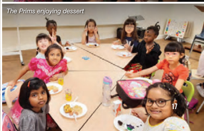
The Prims enjoying dessert