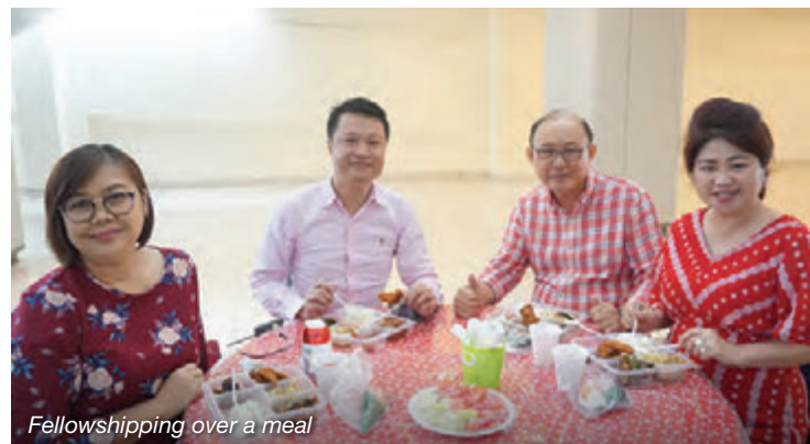
Fellowshipping over a meal