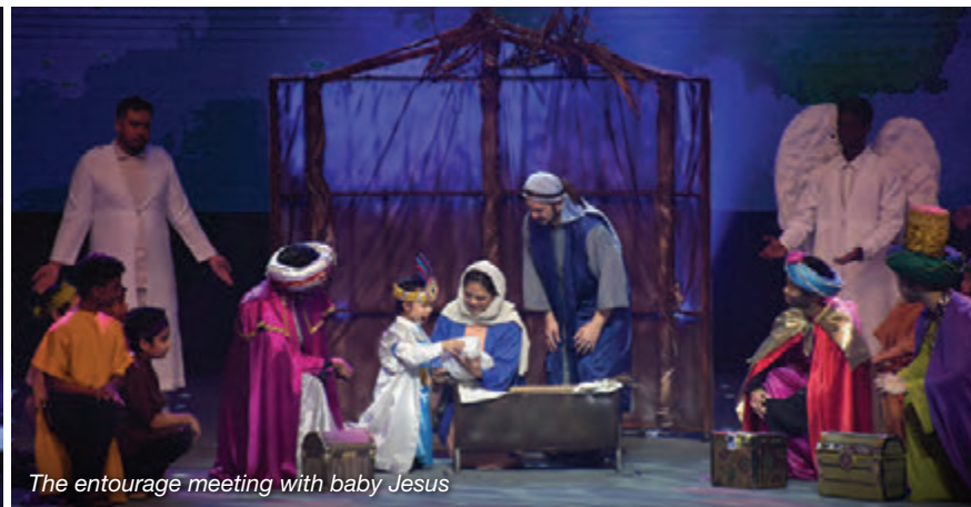
The entourage meeting with baby Jesus