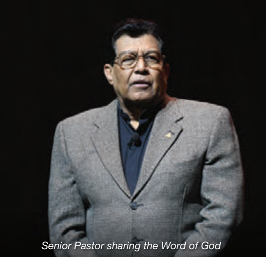
Senior Pastor sharing the Word of God