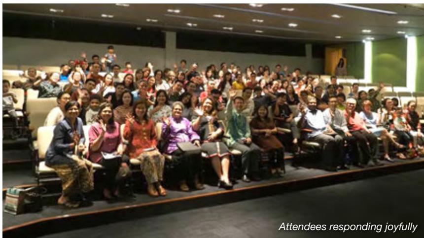
Attendees responding joyfully

Join the Chinese Fellowships on the last Sunday of each month, 11.30am, at Calvary Convention Centre.