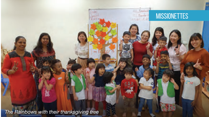
The Rainbows with their thanksgiving tree