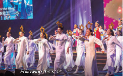
Following the star