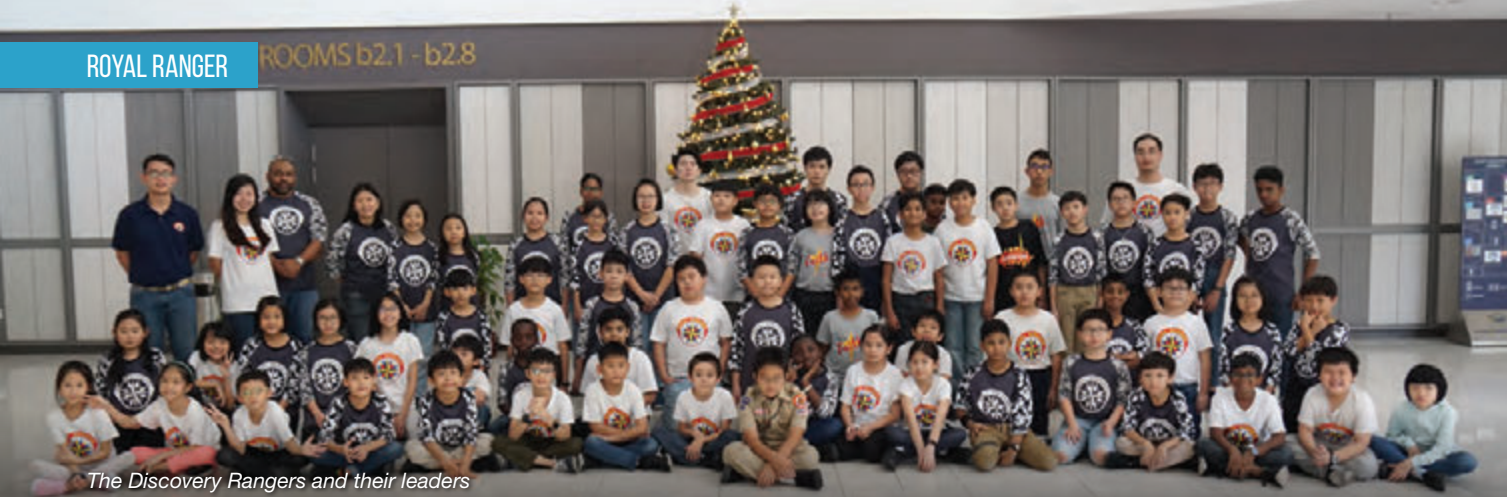
The Discovery Rangers and their leaders