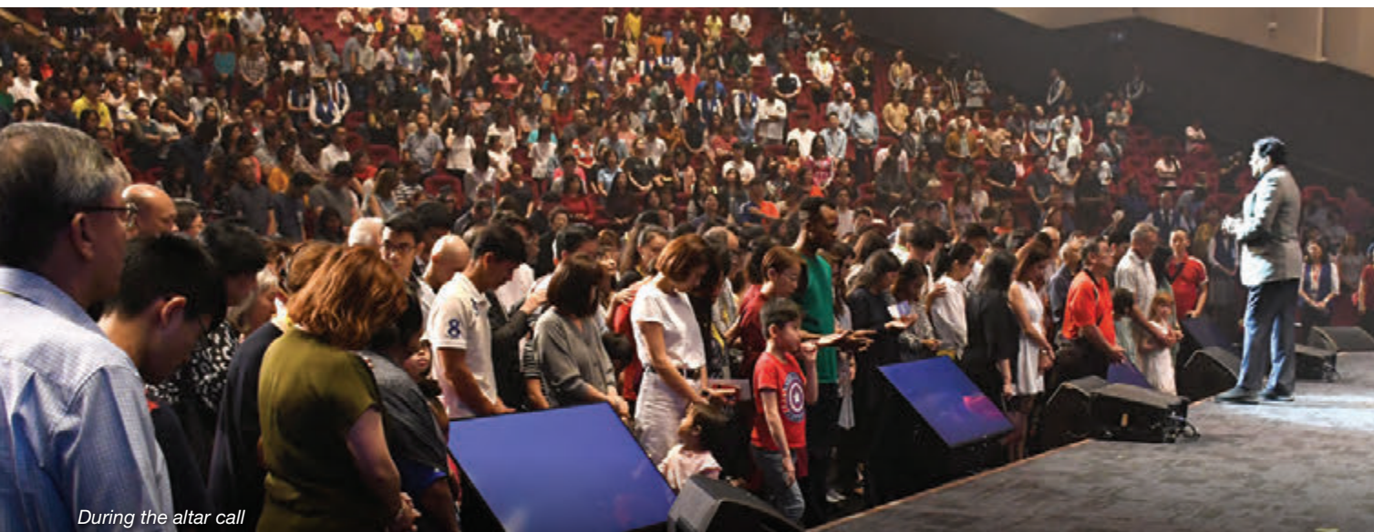
During the altar call

Keen to relive The Star of Christmas all over again? Watch it on our YouTube channel, @calvaryone