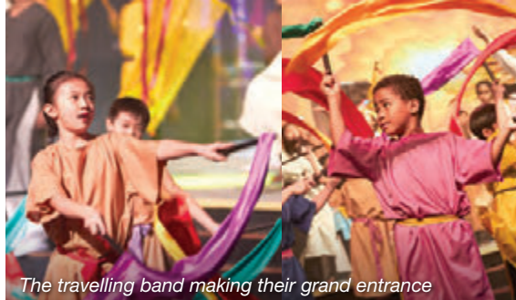
The travelling band making their grand entrance