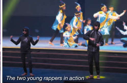
The two young rappers in action