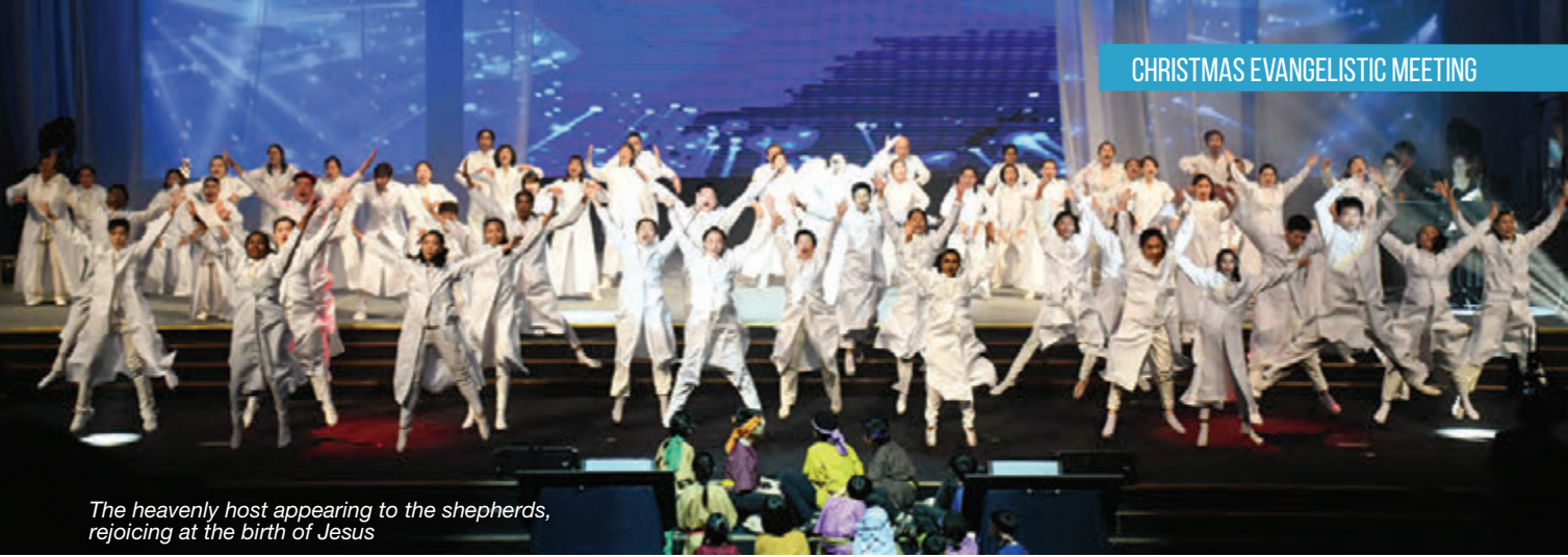
The heavenly host appearing to the shepherds, rejoicing at the birth of Jesus