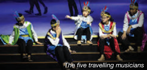
The five travelling musicians