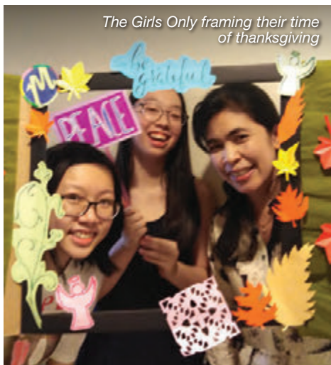
The Girls Only framing their time of thanksgiving

Missionettes is for girls from 3-17, and boys from 3-5 years. Join us on Sundays, 11.30am at Calvary Convention Centre. For more information, call 03-8999 5532 ext. 416.