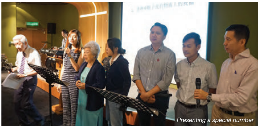
Presenting a special number