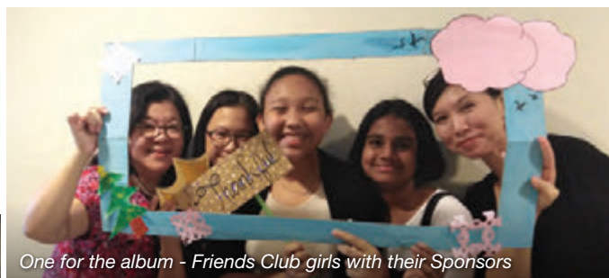
One for the album - Friends Club girls with their Sponsors