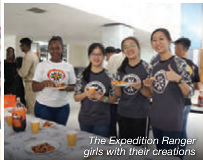
The Expedition Ranger girls with their creations