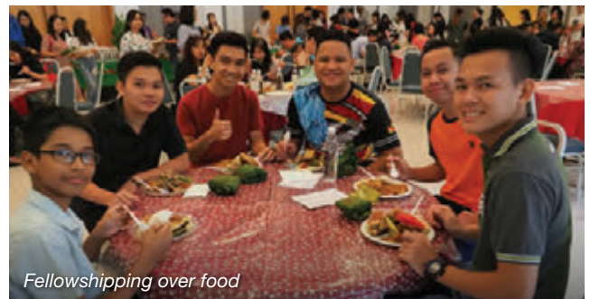
Fellowshipping over food

Sertailah Pelayanan BM kami setiap suku tahunan di Calvary Convention Centre! Untuk maklumat lanjut, sila hubungi 03-8999 5532 sambungan 414.