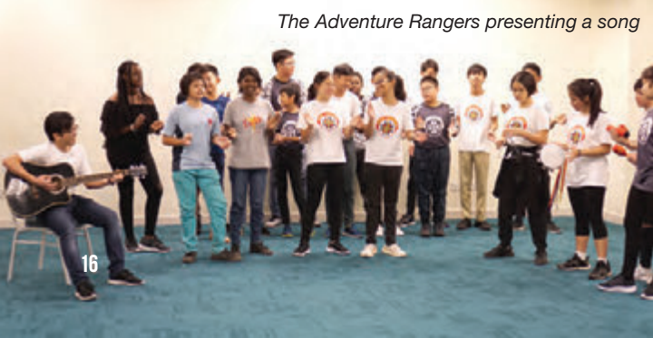
The Adventure Rangers presenting a song