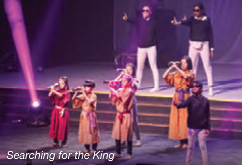
Searching for the King