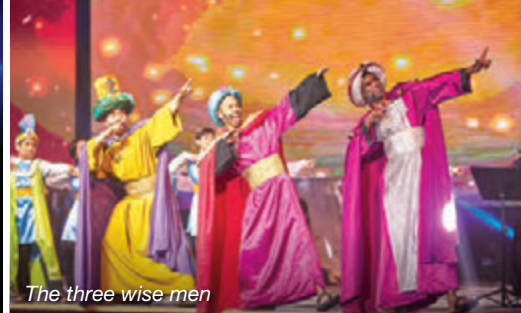
The three wise men