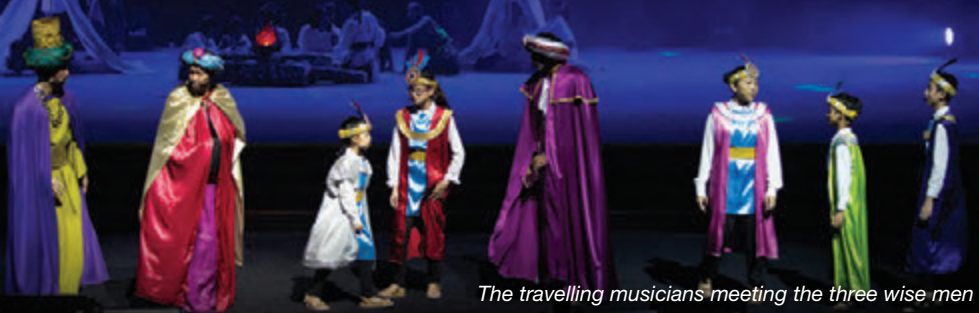
The travelling musicians meeting the three wise men