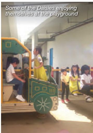
Some of the Daisies enjoying themselves at the playground