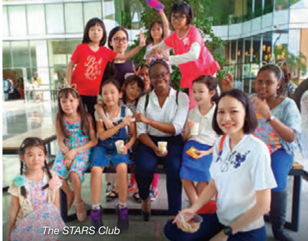
The STARS Club