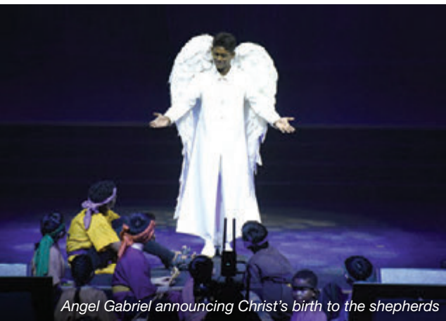
Angel Gabriel announcing Christ's birth to the shepherds