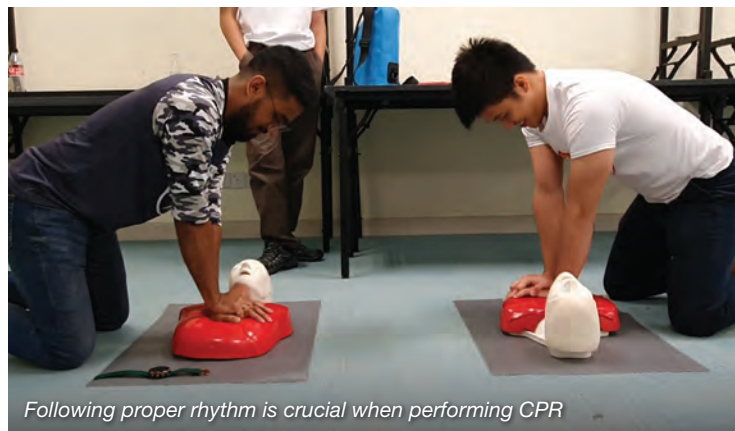
Following proper rhythm is crucial when performing CPR