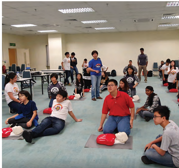
About to practice CPR on the mannequins

Royal Rangers is for boys and girls 6-17 years old. Join us on Sundays, 11.30am at Calvary Convention Centre.