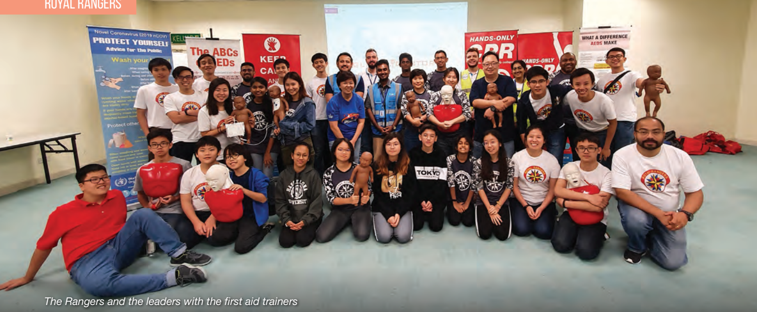
The Rangers and the leaders with the first aid trainers