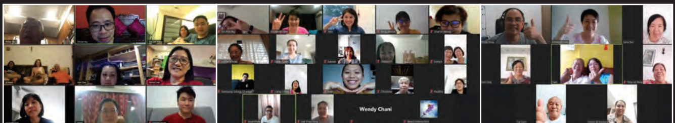
LG meetings, online!