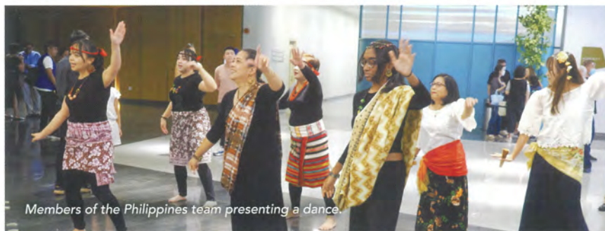
Members of the Philippines team presenting a dance.