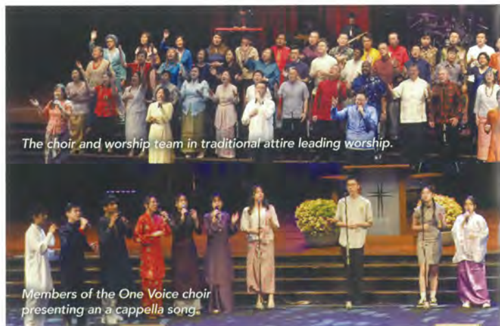
The choir and worship team in traditional attire leading worship.

Before the end of the service, the congregation was given the opportunity to be God's agency by being a faith promise partner. The Faith Promise programme is not a fund-raising endeavour; it is an avenue for believers to grow their faith. A missions offering was also taken to assist victims of human trafficking in countries such as India, Russia, and Spain.