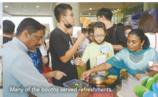
Many of the booths served refreshments.