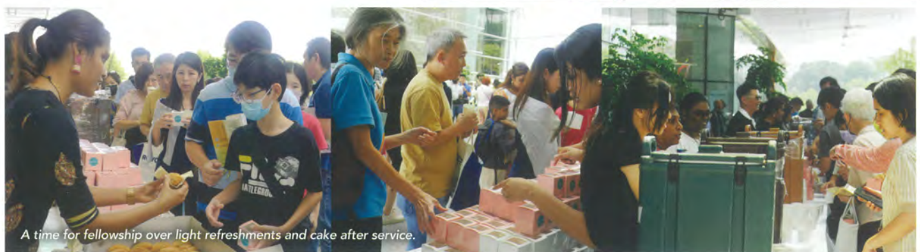
A time for fellowship over light refreshments and cake after service.