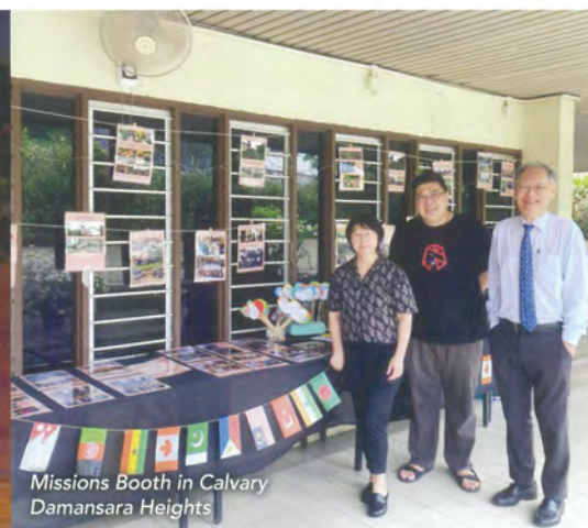
Missions Booth in Calvary Damansara Heights