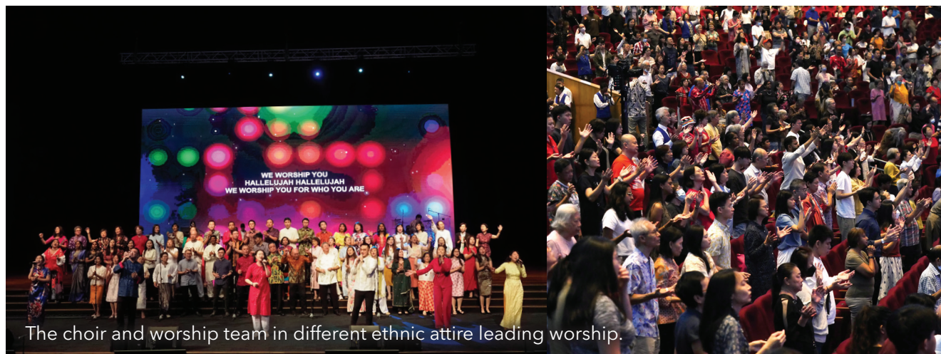
The choir and worship team in different ethnic attire leading worship.

Finally, Esther's choice involved a costly commitment . She could have made excuses such as 'why her' or the crisis was too mammoth. However, she risked her life to meet the king.