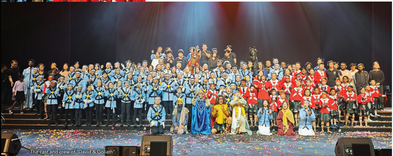
The cast and crew of "David & Goliath".