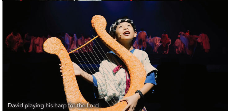
David playing his harp for the Lord.