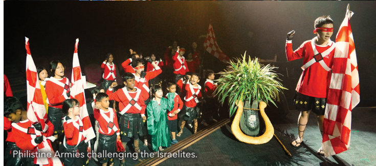
Philistine Armies challenging the Israelites.