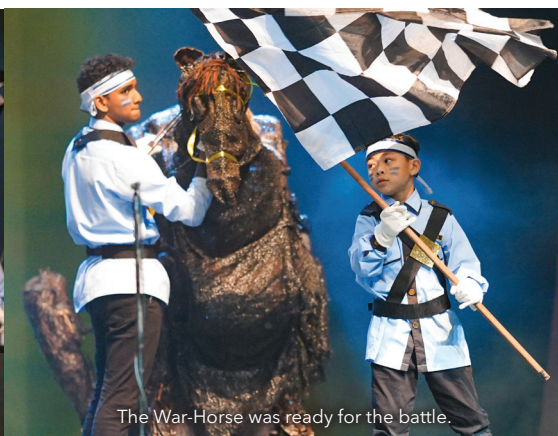
The War-Horse was ready for the battle.