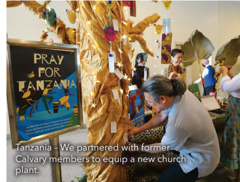
Tanzania - We partnered with former Calvary members to equip a new church plant.