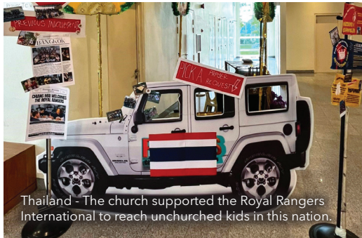
Thailand - The church supported the Royal Rangers International to reach unchurched kids in this nation.