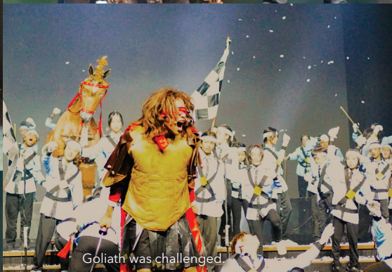
Goliath was challenged.