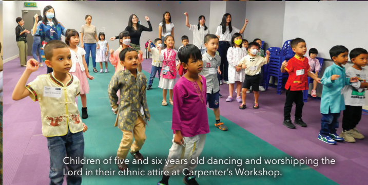
Children of five and six years old dancing and worshipping the Lord in their ethnic attire at Carpenter's Workshop.