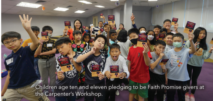
Children age ten and eleven pledging to be Faith Promise givers at the Carpenter's Workshop.