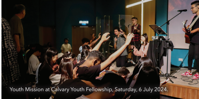
Youth Mission at Calvary Youth Fellowship, Saturday, 6 July 2024.