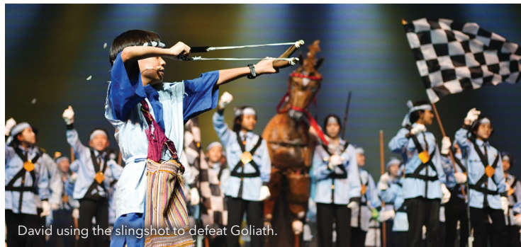
David using the slingshot to defeat Goliath.