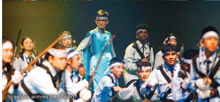
Israelites armies trembling.