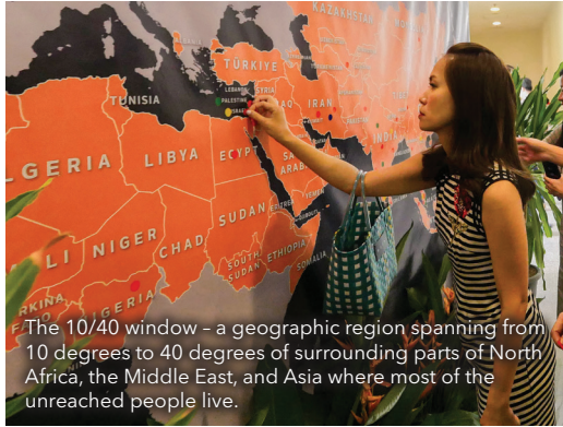
The 10/40 window - a geographic region spanning from 10 degrees to 40 degrees of surrounding parts of North Africa, the Middle East, and Asia where most of the unreached people live.

At the main foyer, ministries set up four booths to raise awareness and give updates on Calvary Church's missions, both locally and abroad.