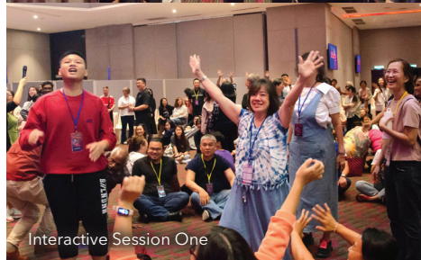
Interactive Session One