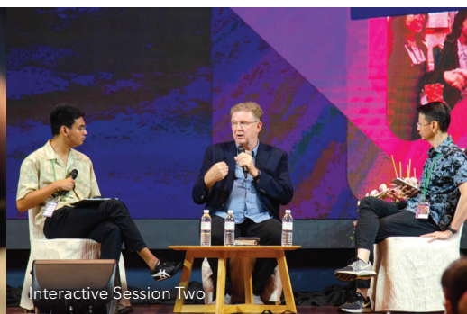
Interactive Session Two