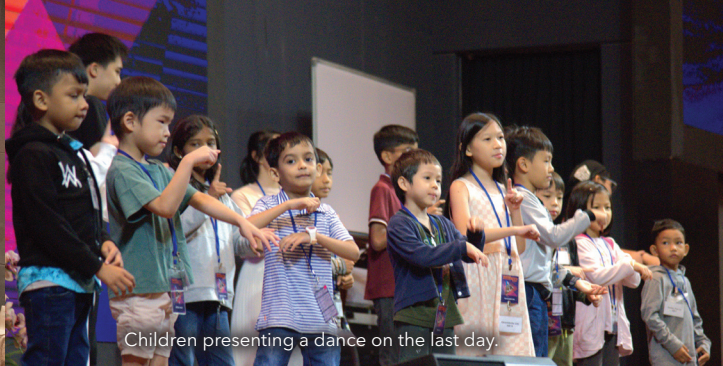
Children presenting a dance on the last day.