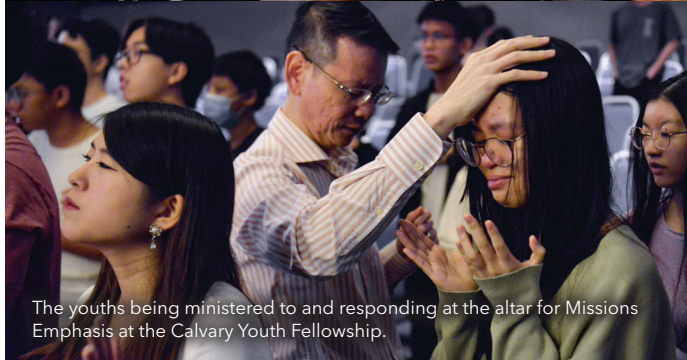
The youths being ministered to and responding at the altar for Missions Emphasis at the Calvary Youth Fellowship.