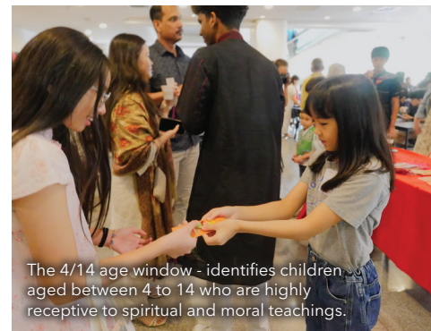
The 4/14 age window - identifies children aged between 4 to 14 who are highly receptive to spiritual and moral teachings.