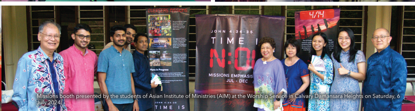
Missions booth presented by the students of Asian Institute of Ministries (AIM) at the Worship Service in Calvary Damansara Heights on Saturday, 6 July 2024.

Through the dedication and hard work of a cohesive team, we were able to distribute essential food supplies to needy families, providing much-needed relief and hope during these challenging times. At the point of writing, a total of 21 families have been blessed.