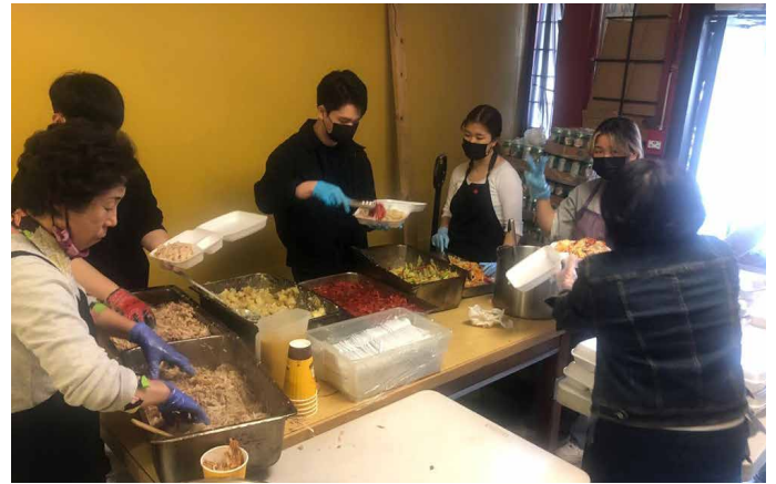
At the Potter's Place Mission, volunteers distribute food to the street people