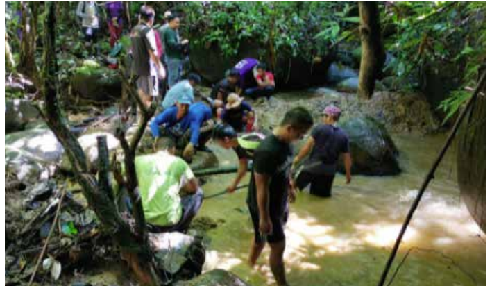
Meetings between WVM Field Staff and Starter Group and Water Committee in March 2021

During the Movement Control Order period, individuals from within these communities that were identified, recruited as “starter group” were equipped and mobilised to assist key groups within the communities such as parents, caregivers, educators, church leaders and water committee.