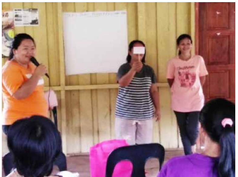
WVM Field Staff plays an important role in the CDP, their talent and experience are used to equipped the local communities