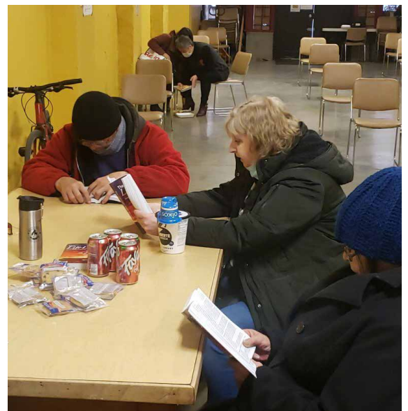
Worship services and Bible studies at the Potter's Place Mission