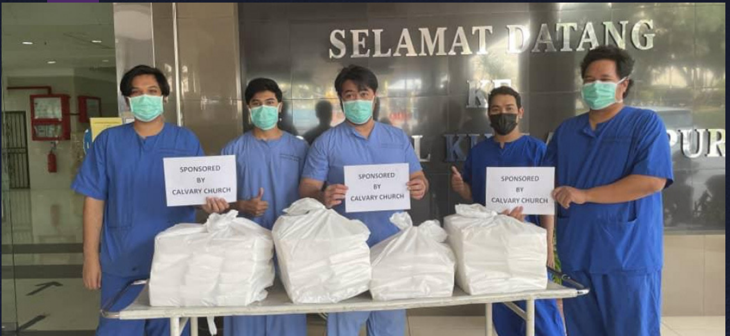
Frontliners of HKL receiving a meal sponsored by Calvary Missions Ministry

Calvary Missions took the opportunity to appreciate our frontliners by providing a meal to 150 staff from the Intensive Care Unit (ICU) and Accident & Emergency (A&E) departments of Hospital Kuala Lumpur (HKL) on 7 August 2021.