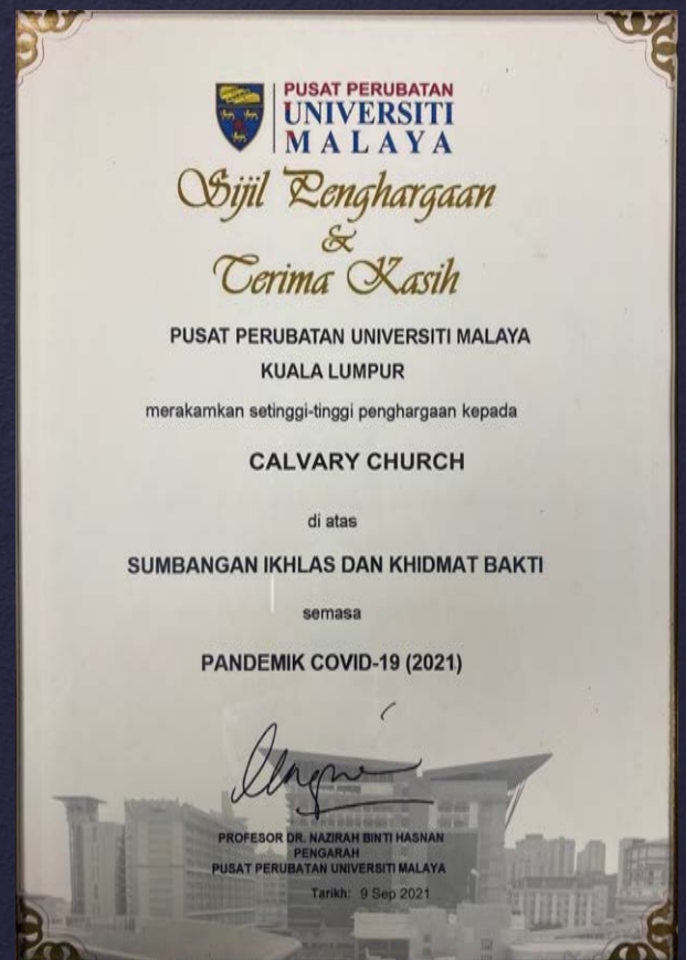
A letter of appreciation from UMMC

In response to an appeal for assistance to meet the need for medical equipment during this pandemic, Calvary Church donated five oxygen concentrators worth RM4,000 per unit to the University of Malaya Medical Centre (UMMC) on 9 September 2021. Your missions giving has made saving lives in critical moments like this possible.