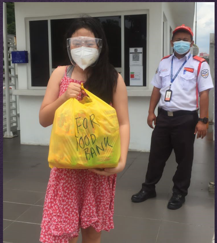
Royal Rangers bringing their contributions to Calvary Church