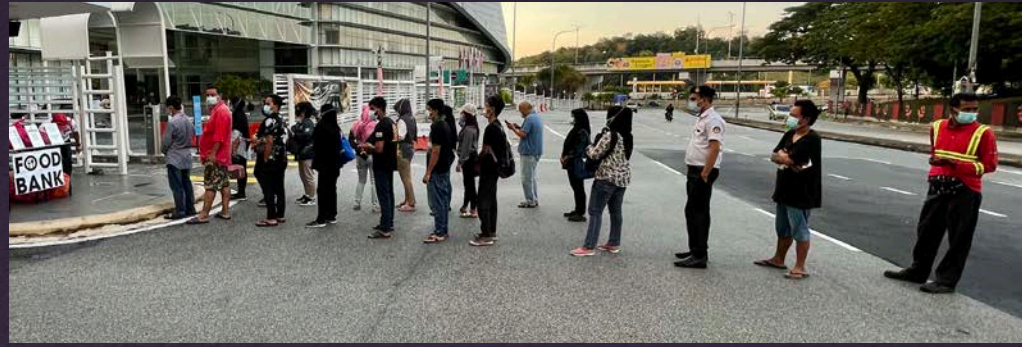
Food Bank at Calvary Convention Centre in August 2021

A food bank was set up at the entrance of Calvary Convention Centre on every Saturday from 21 August to 25 September 2021. The food distributed to people in need living or working around Bukit Jalil was made possible through your giving in cash and kind.